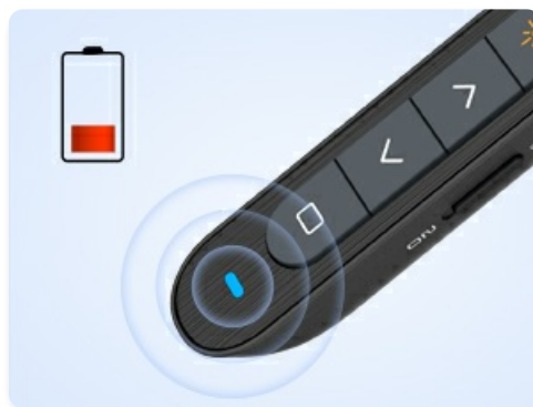
Image: The presenter indicates a low battery state, prompting for recharge.