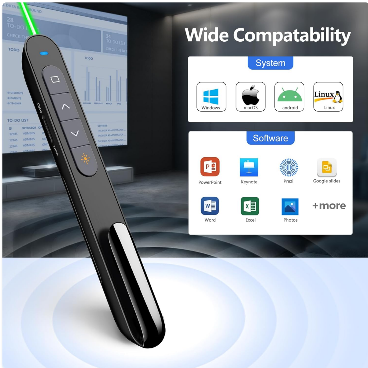
Image: The Norwii N76 offers wide compatibility with major operating systems and presentation software.

to adjust the audio output of your computer.