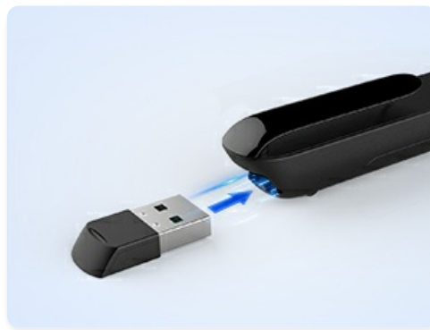
Image: The USB-A receiver is conveniently stored within the presenter.