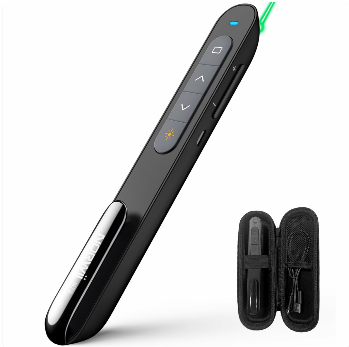
Image: The Norwii N76 in use, demonstrating its green laser pointer on a presentation screen.

Press and hold the Laser Pointer button (often marked with a sun or star icon) to activate the green laser. Release the button to turn off the laser. The green laser is 8 times brighter than a red laser, providing clear visibility on most screens. Note: The laser is not intended for use on TV screens.