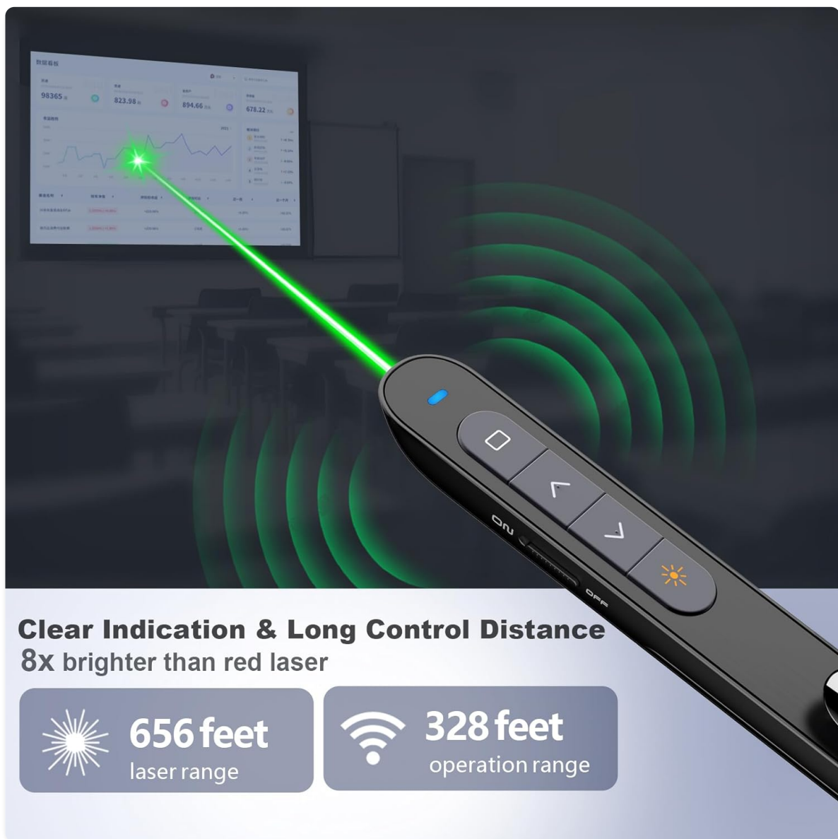
Image: Front view of the Norwii N76 presentation remote.