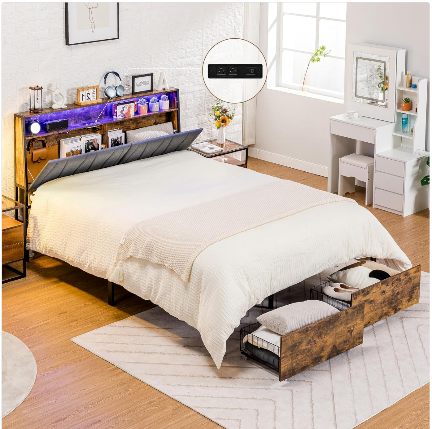
Figure 1: Fully assembled COMHOMA Platform Bed Frame.