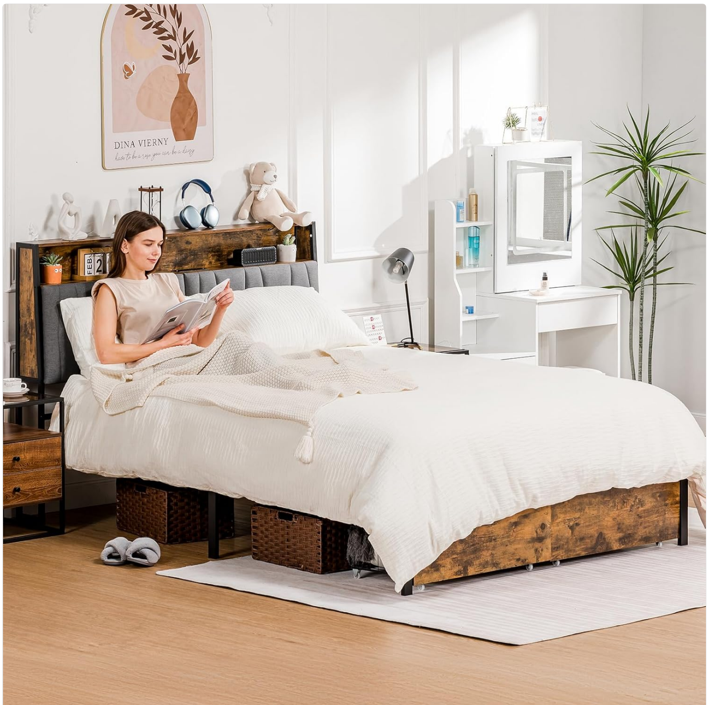
Figure 6: The two push-pull storage drawers located at the foot of the bed.