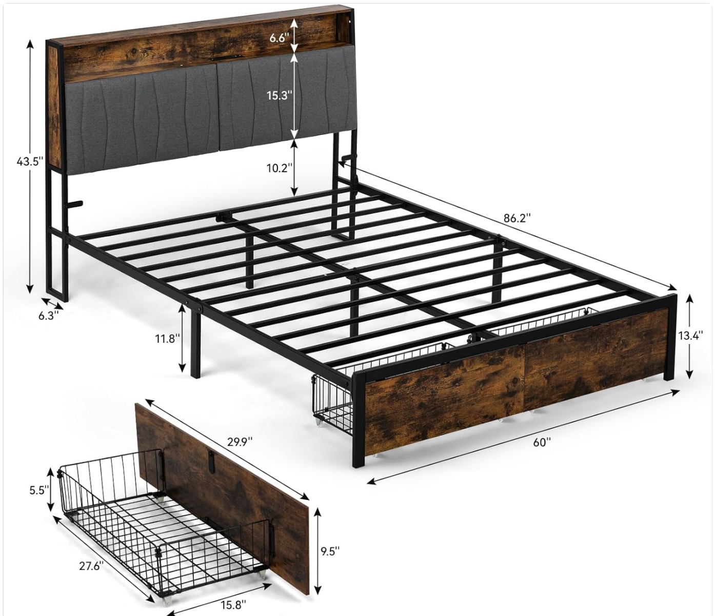
Figure 2: Key dimensions of the bed frame components.