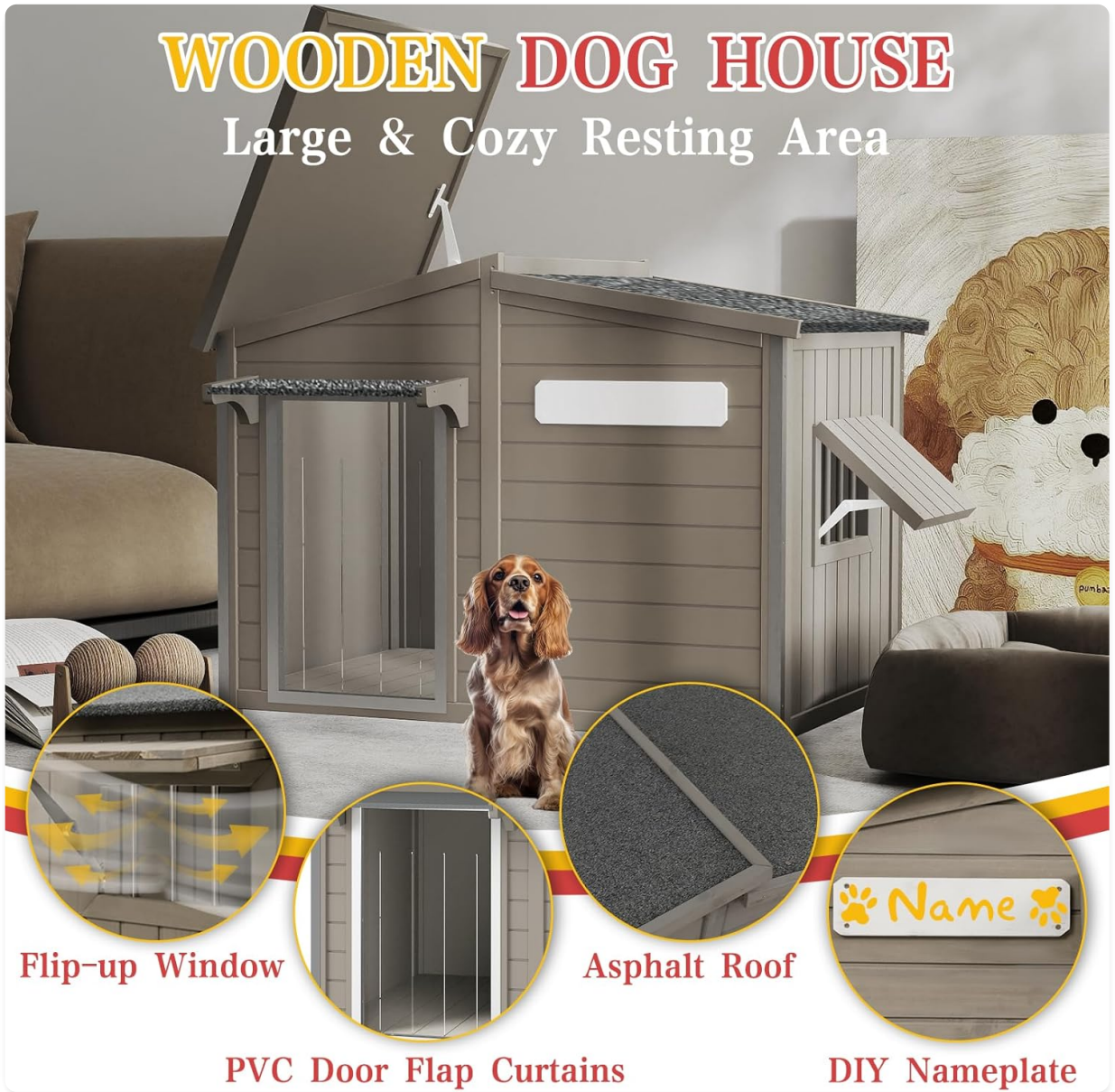
Image: Key Features. This image details key features such as the flip-up window for ventilation, PVC door flap curtains for weather protection, the asphalt roof, and the customizable DIY nameplate.