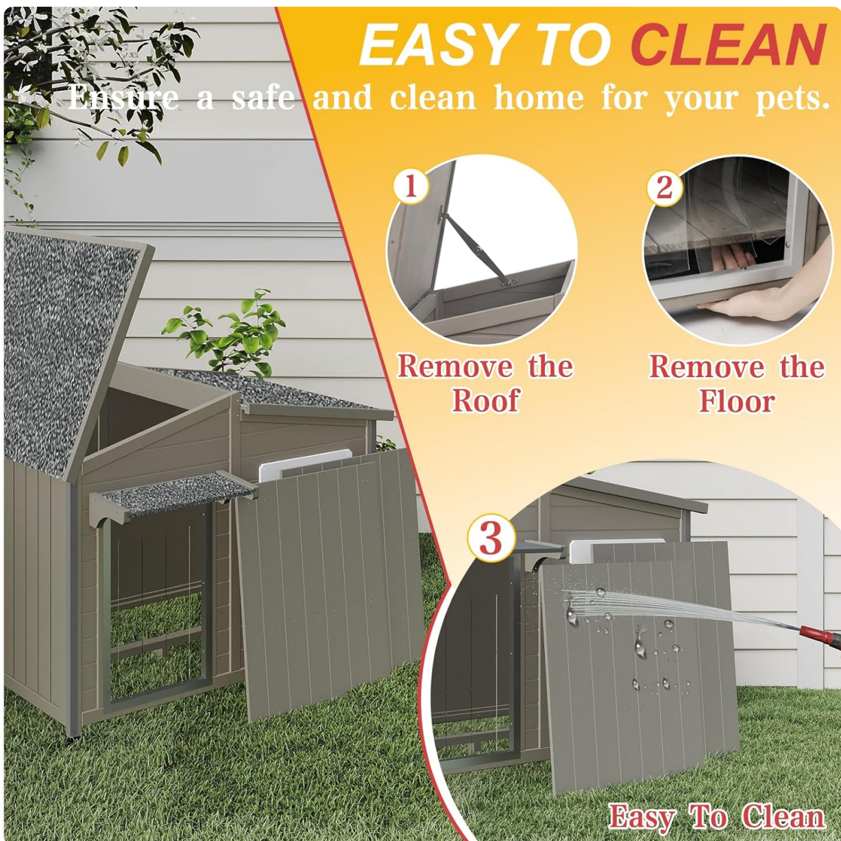
Image: Easy to Clean. This image demonstrates the ease of cleaning, showing how the roof can be opened and the floor removed for thorough maintenance.