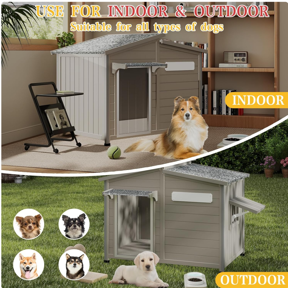
Image: Indoor & Outdoor Use. This image illustrates the versatility of the dog house, showing it used comfortably in both indoor and outdoor settings.