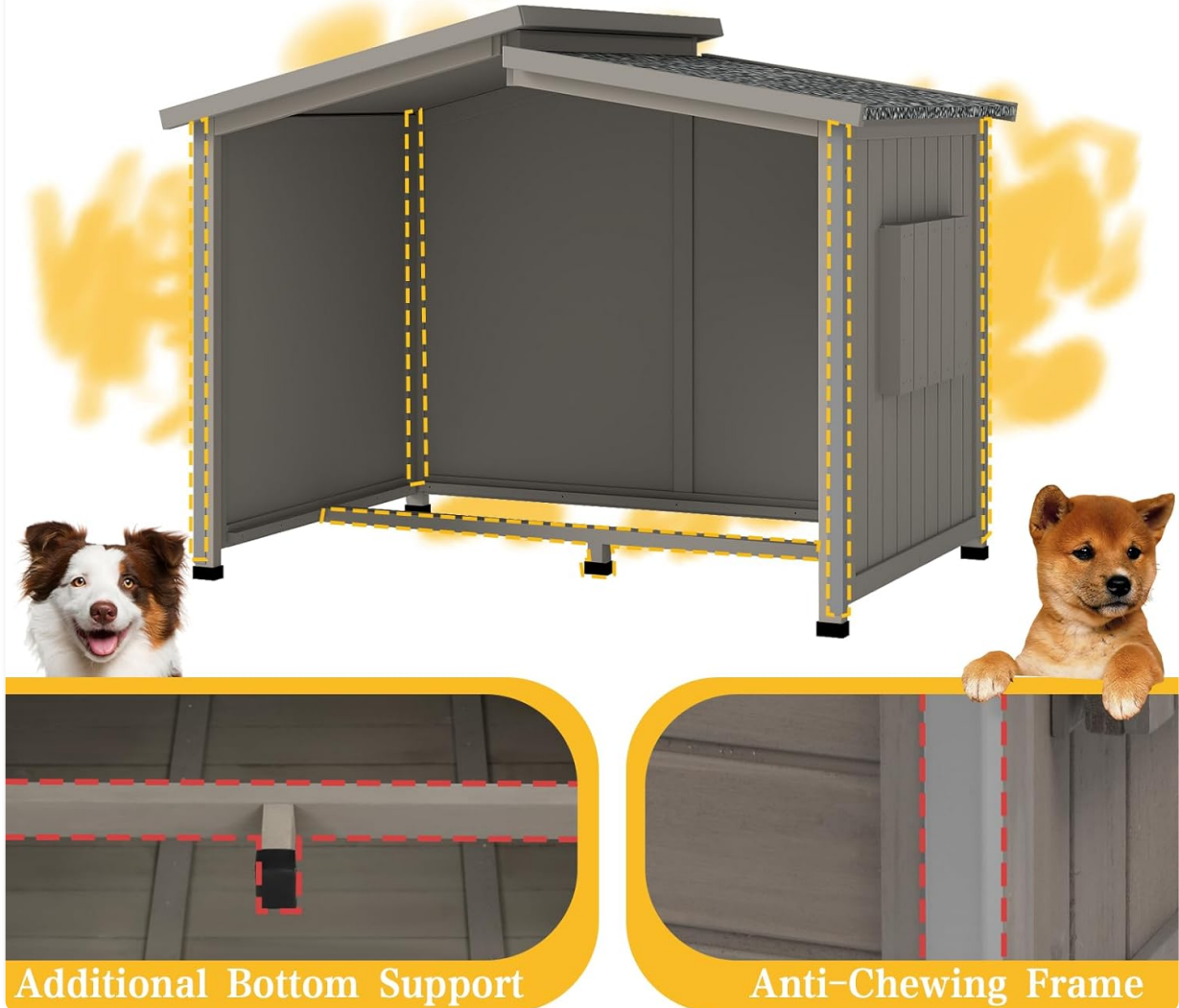
Image: Additional Bottom Support. This image shows the additional bottom support structure, which enhances stability and increases the weight capacity of the dog house.