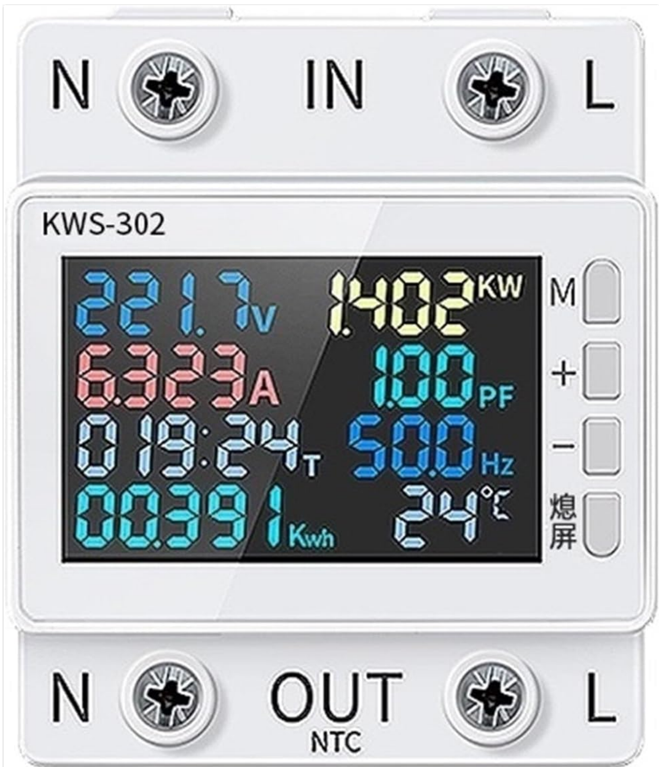
Figure 5.1: Example of data displayed on the KWS-302 screen.