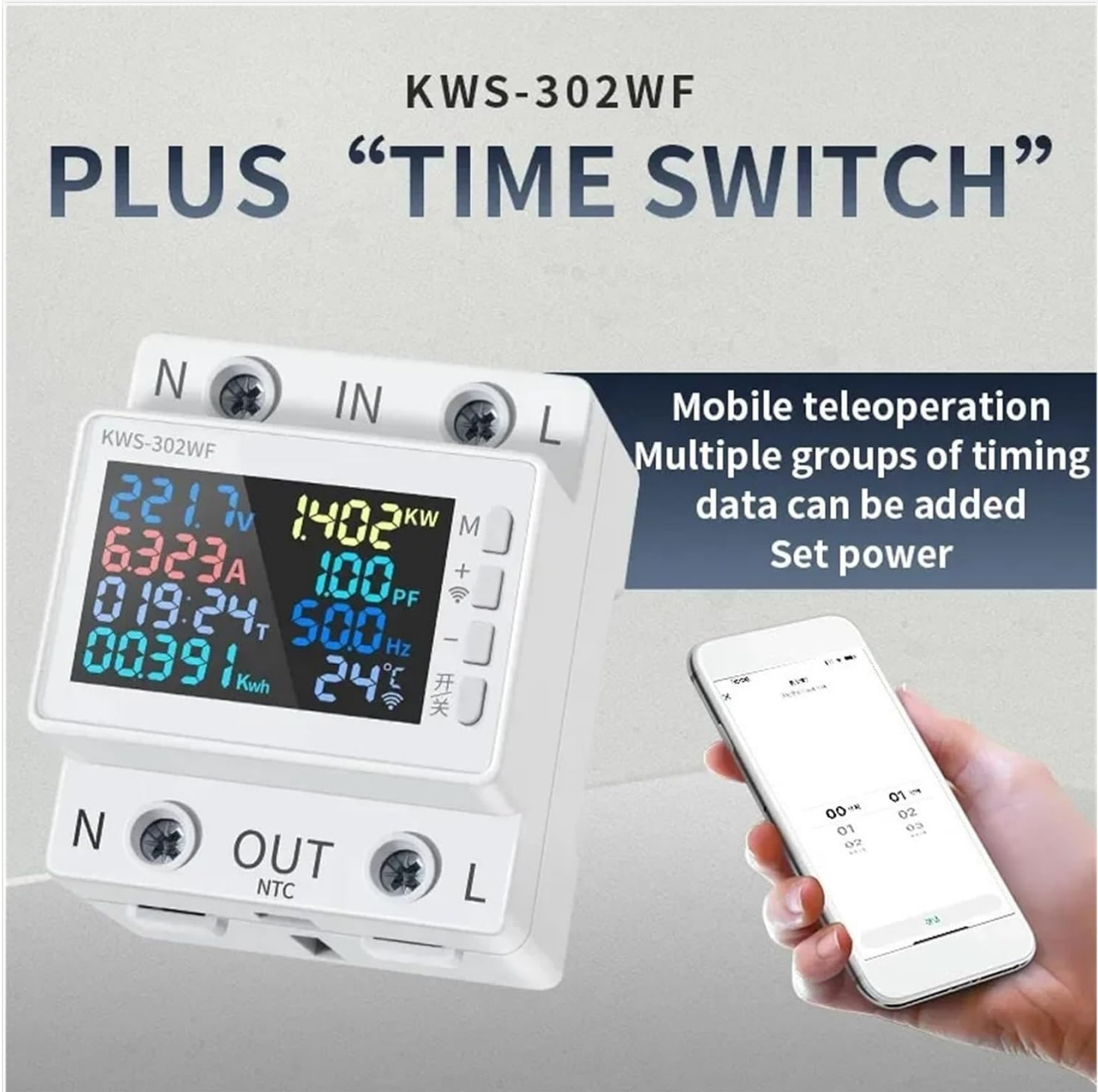
Figure 5.2: KWS-302WF model demonstrating mobile app control (feature not available on KWS-302).