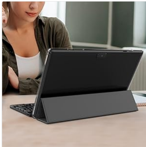
Image: The tablet screen highlighting its dual camera capabilities, specifying a 2.0MP front camera and an 8.0MP rear camera for various photography and video conferencing needs.

The tablet features a 2MP front camera and an 8MP rear camera. Open the 'Camera' app to capture photos or record videos. You can switch between front and rear cameras within the app interface.