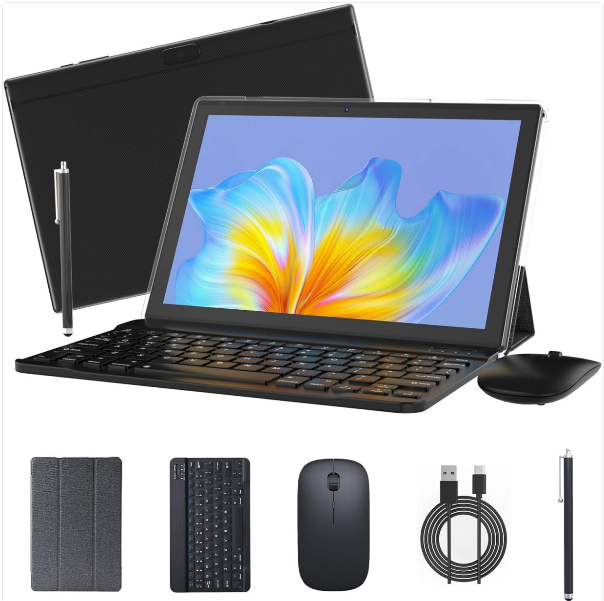
Image: The Aheadlink Android Tablet displayed with its full set of accessories, including the detachable keyboard, wireless mouse, stylus pen, protective case, and charging cable.