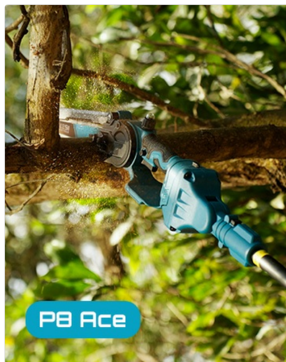
Image: Multi-angle adjustable extension pole in use.

The extendable pole adjusts from 6 to 9 feet, allowing for a maximum reach of 16 feet. To adjust, loosen the locking mechanism, extend the pole to the desired length, and securely tighten the mechanism.