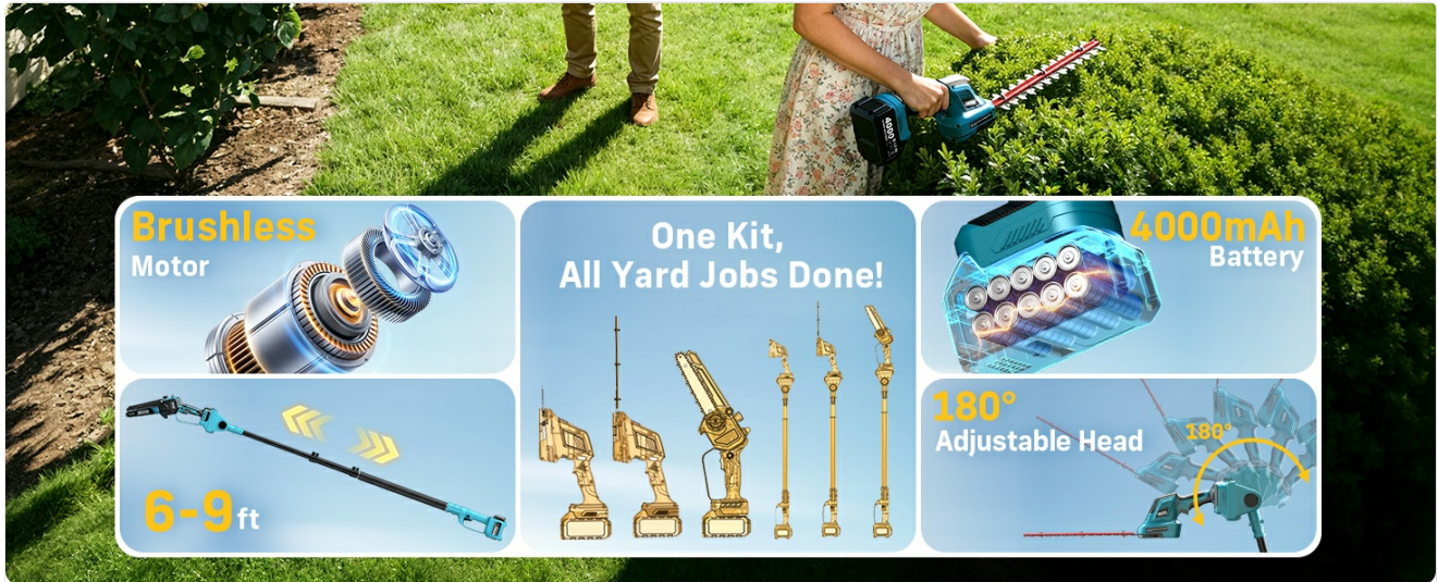
Image: Key features and specifications of the Seesii 6-in-1 tool.