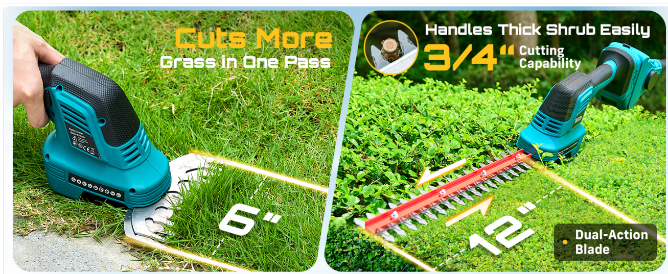
Image: Grass shear and hedge trimmer blade specifications.