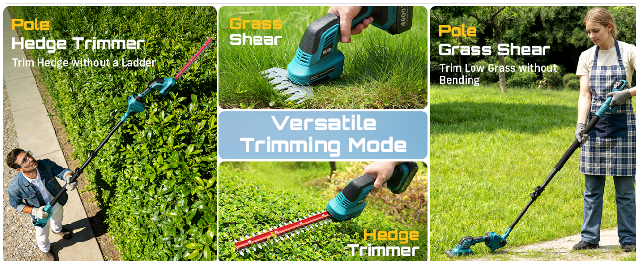
Image: Versatile trimming modes of the Seesii 6-in-1 tool.