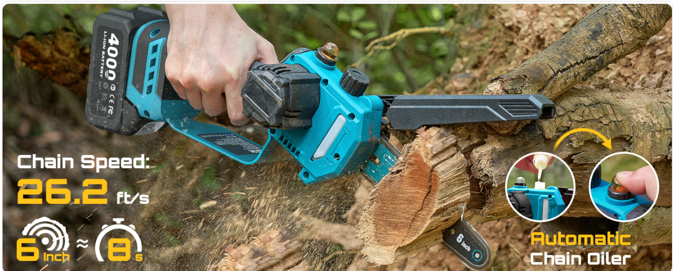
Image: Mini chainsaw in action, demonstrating automatic chain oiling.