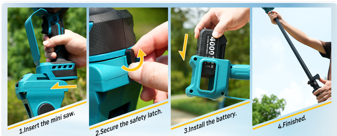
Image: Step-by-step assembly of the mini chainsaw.