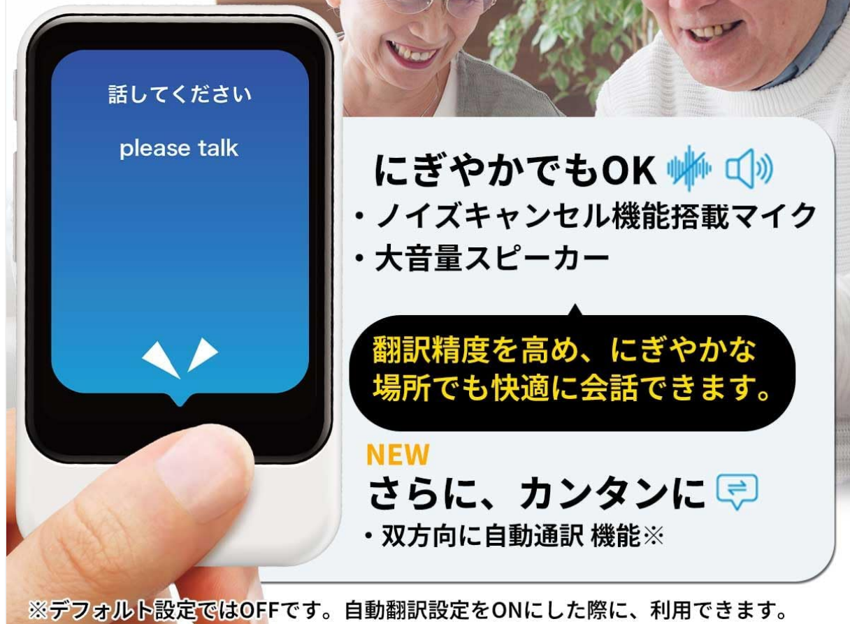
Image: User interacting with the POCKETALK S2 for voice translation, showing the "please talk" prompt on the screen.