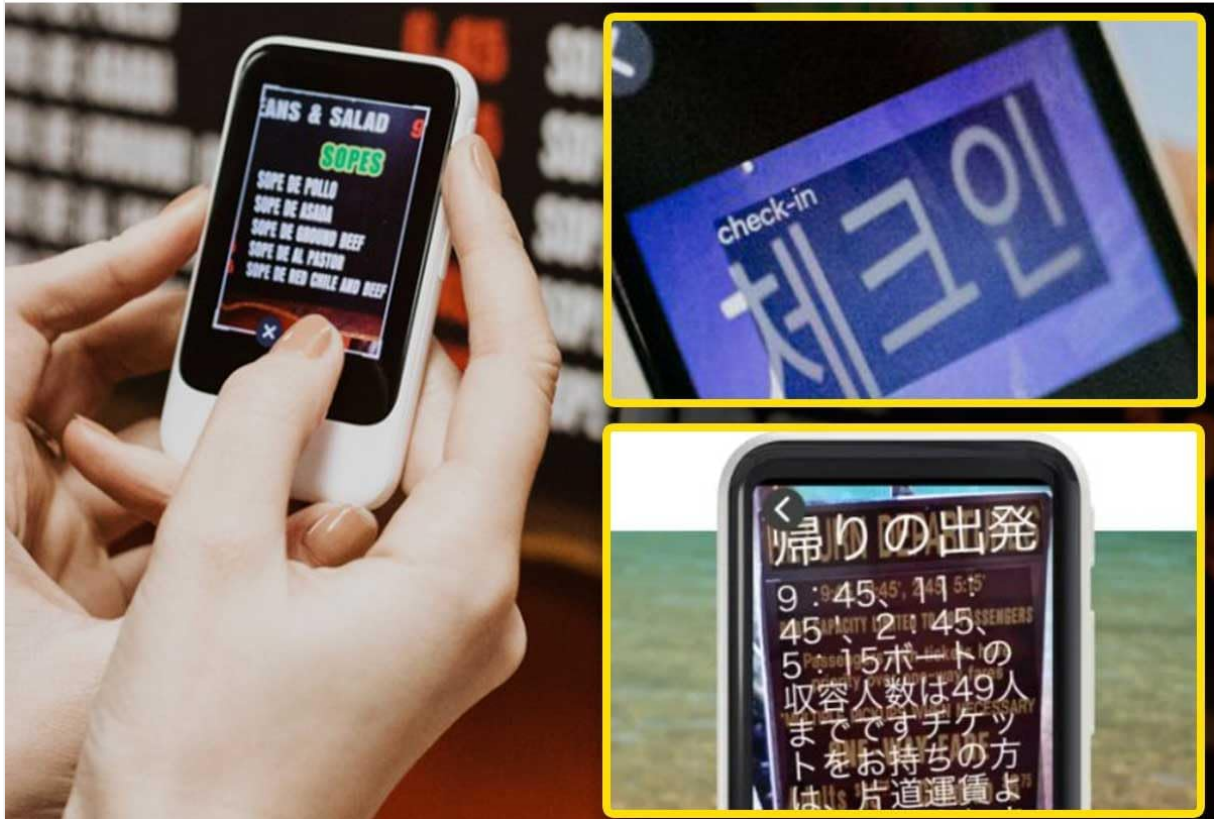
Image: Demonstrations of the camera translation feature, translating text from a menu and a sign.

お店のメニューや看板など、カメラで撮影するだけで翻訳できます。何語か分からない文字でも言語を自動判別します。（56言語対応）