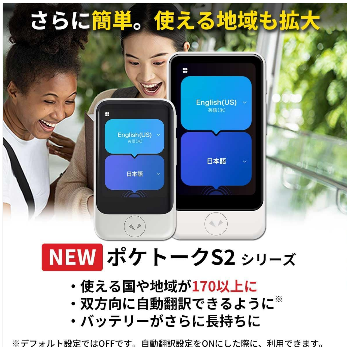
Image: Two POCKETALK S2 devices demonstrating the language selection interface, set to English (US) and Japanese.

translation. Choose the two languages you wish to translate between.