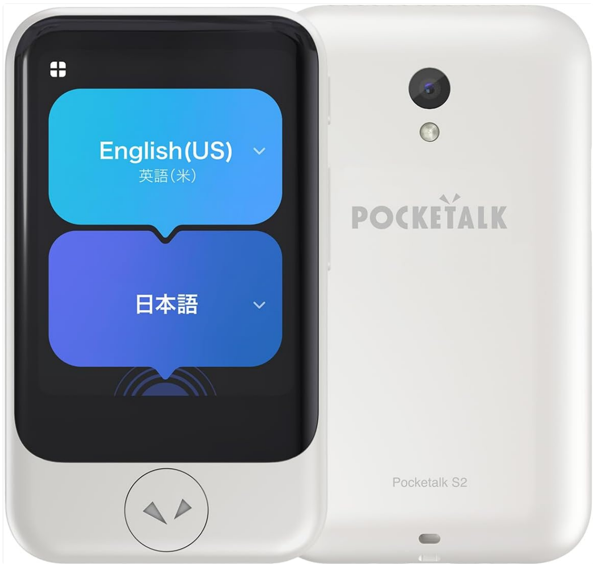
Image: Front and back view of the POKETALK S2 device, displaying language selection on its screen.