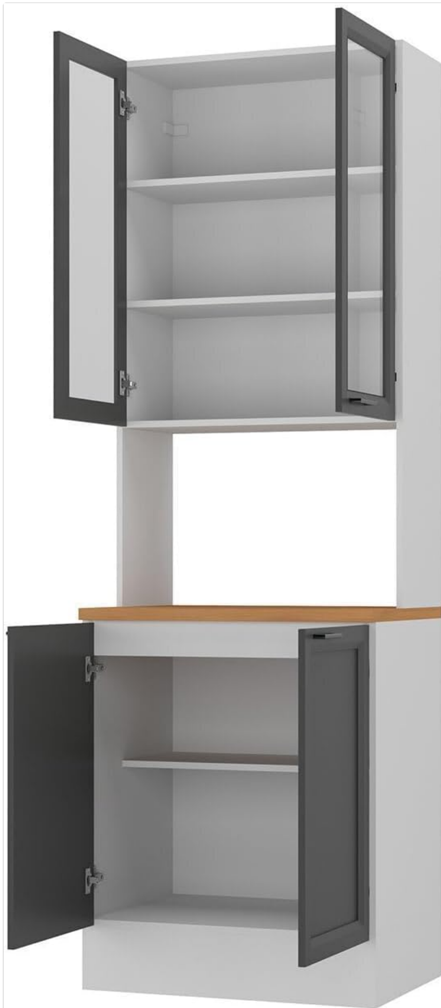
Image: The Soho Double Pantry Cabinet with its doors open, revealing the internal shelving for organized storage of kitchen items.