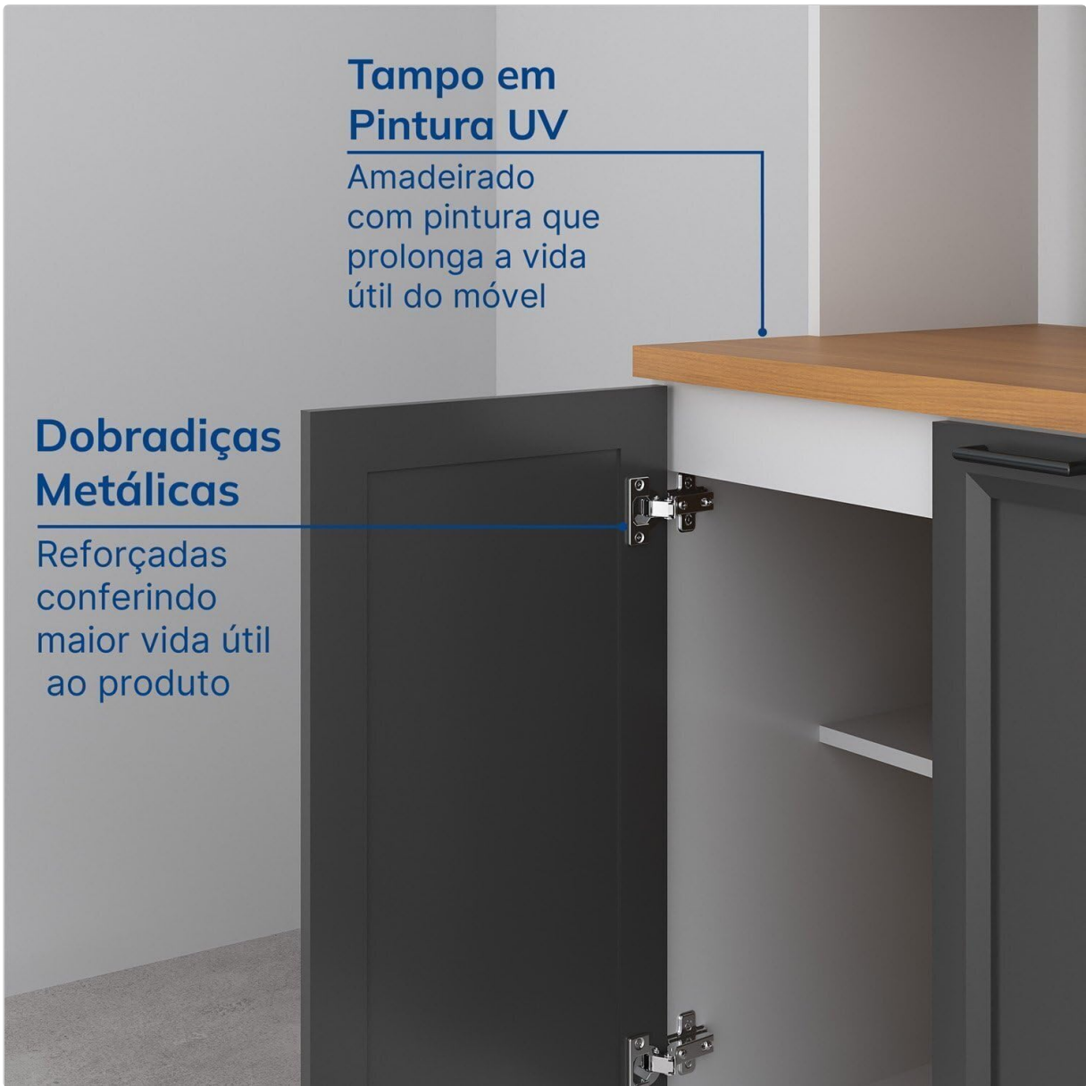
Image: Detail of the cabinet's American-style doors with MDF moldings and contemporary aluminum handles with high-quality epoxy paint finish.

Reforçadas conferindo maior vida útil ao produto