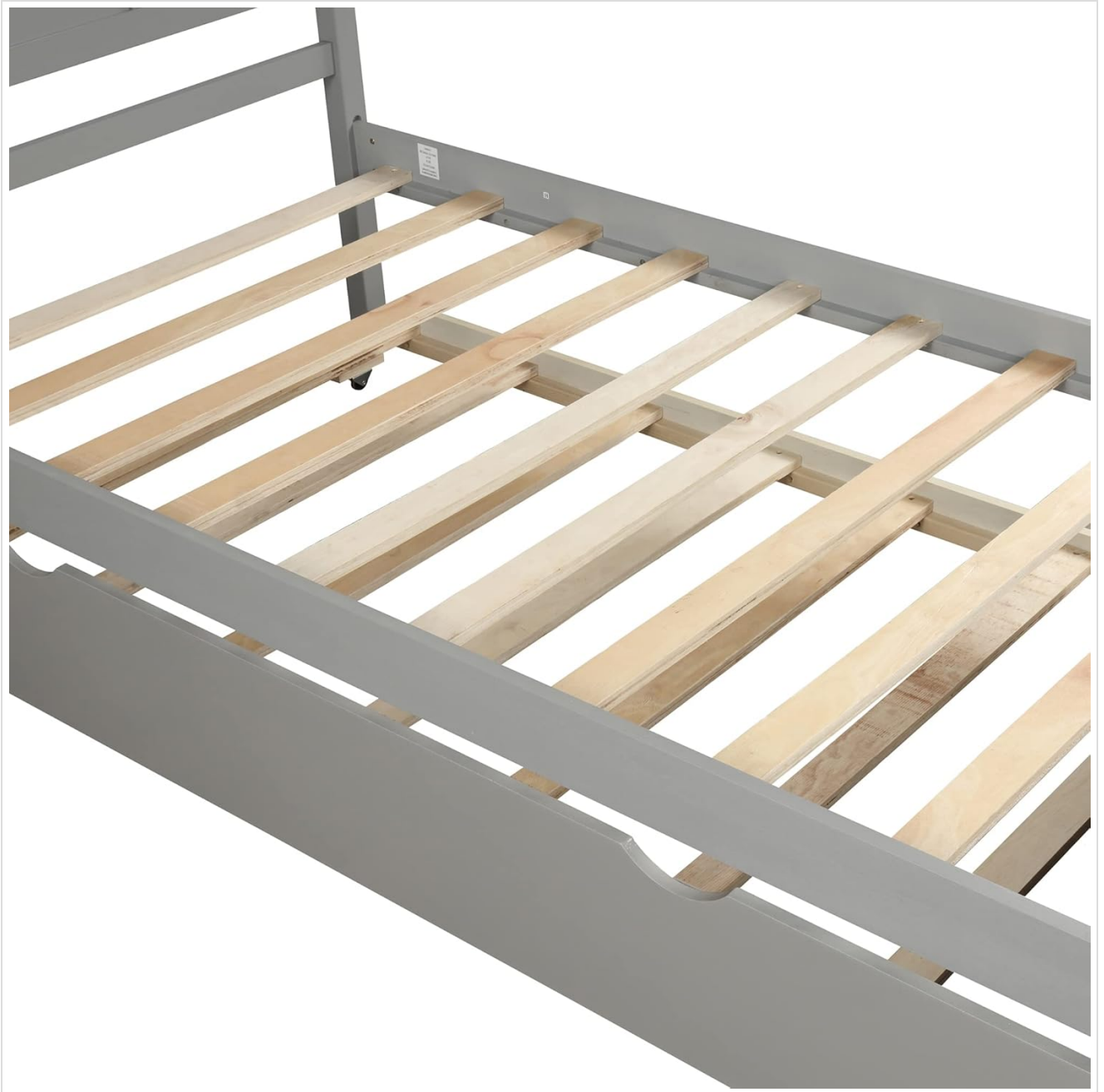
Image Description: A detailed view of the wooden slats installed on the bed frame, demonstrating the support structure for the mattress.