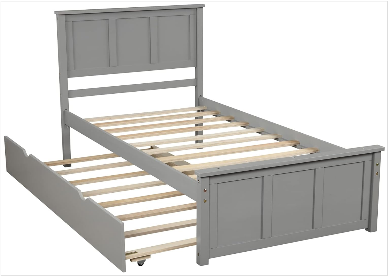
Image Description: An angled view of the twin platform bed frame with the trundle bed fully extended, demonstrating its functionality as an additional sleeping space.