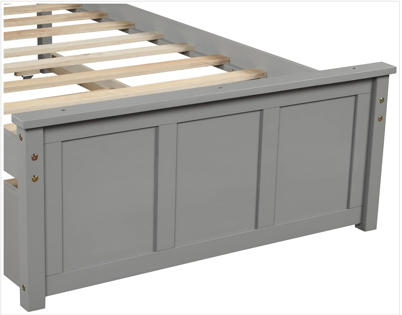
Image Description: A close-up view showing the connection points of the bed frame, specifically where the side rail attaches to the footboard, secured with visible bolts.