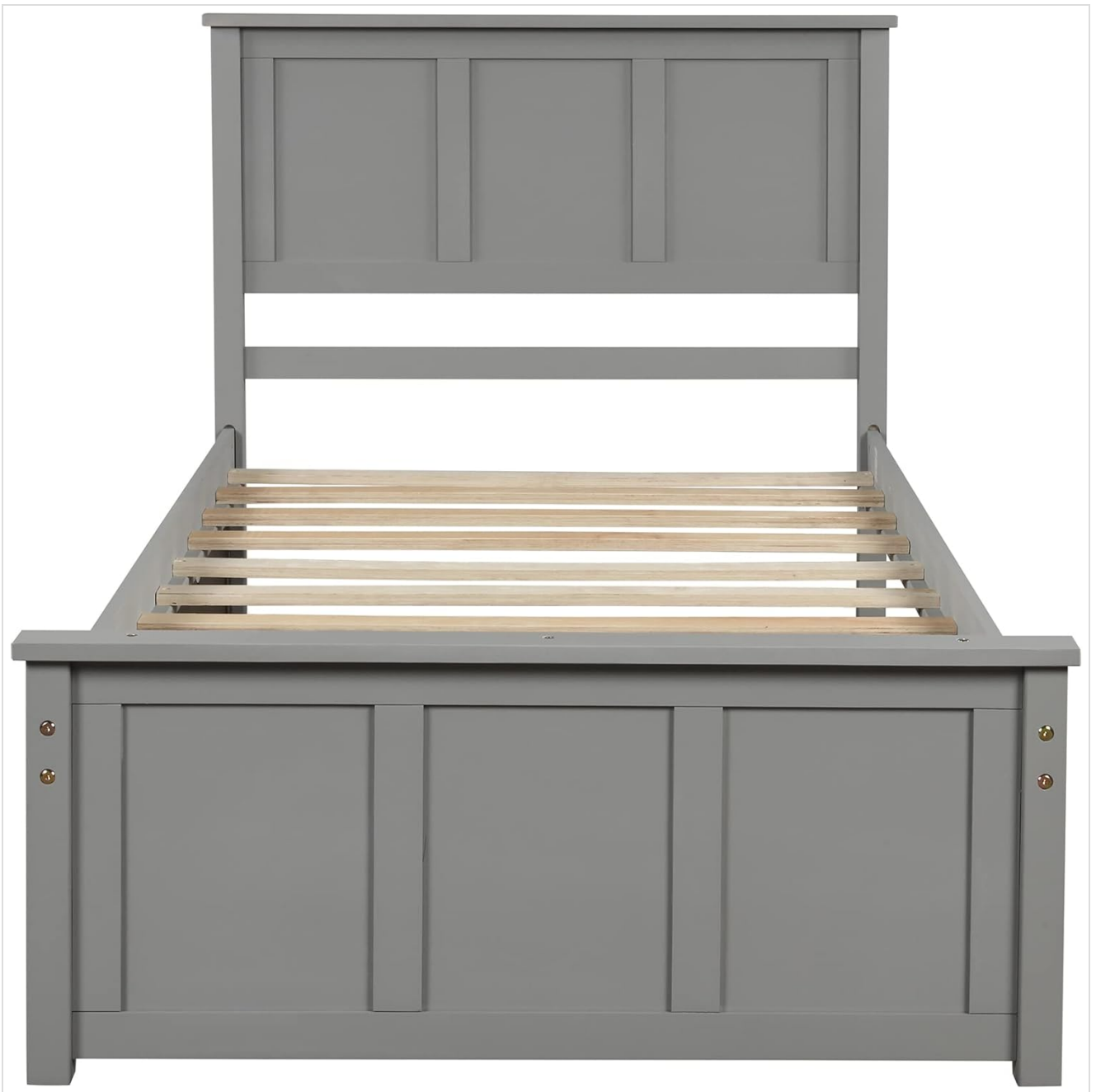
Image Description: A front-facing view of the fully assembled twin platform bed frame, showcasing the headboard, footboard, and the integrated slat system.