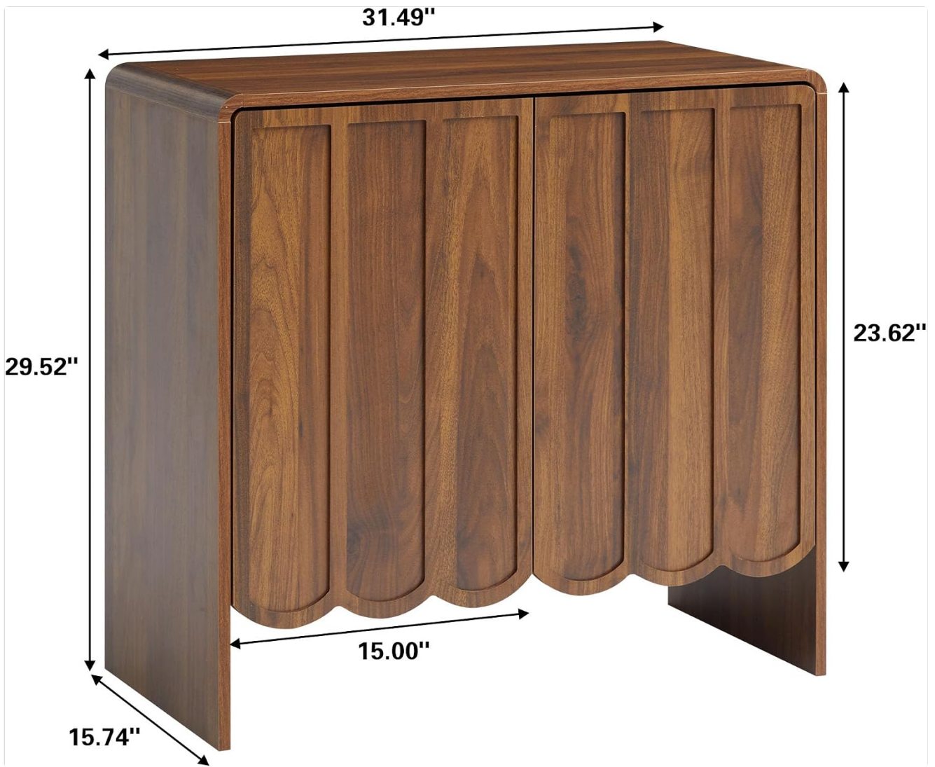
Figure 2.1: Cabinet dimensions for planning placement.