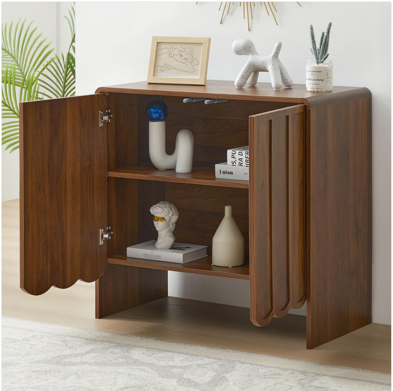
Figure 3.1: Interior view with adjustable shelves.