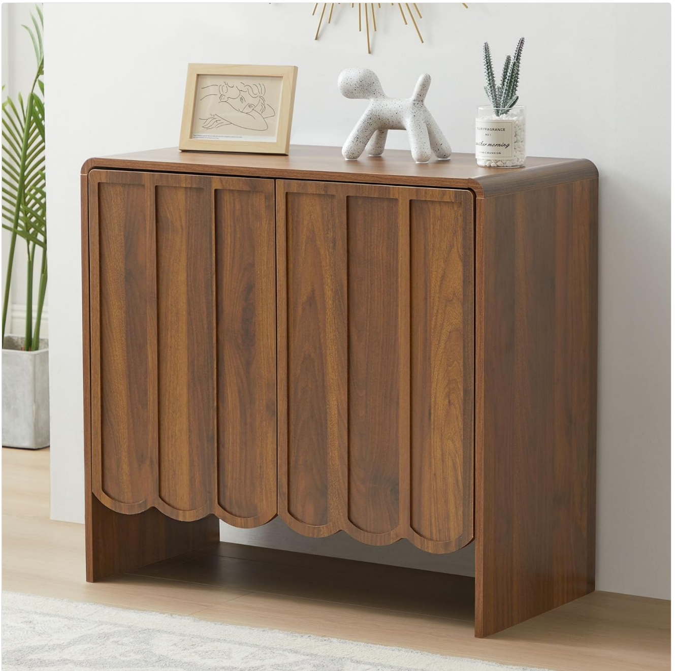
Figure 1.1: Front view of the ORRD Sideboard Buffet Cabinet.