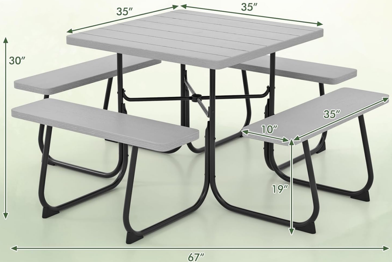
Figure 1: Product dimensions for assembly reference. The table measures 67 inches by 67 inches by 30 inches high. The tabletop is 35 inches by 35 inches. Each bench is 35 inches long, 10 inches wide, and 19 inches high.