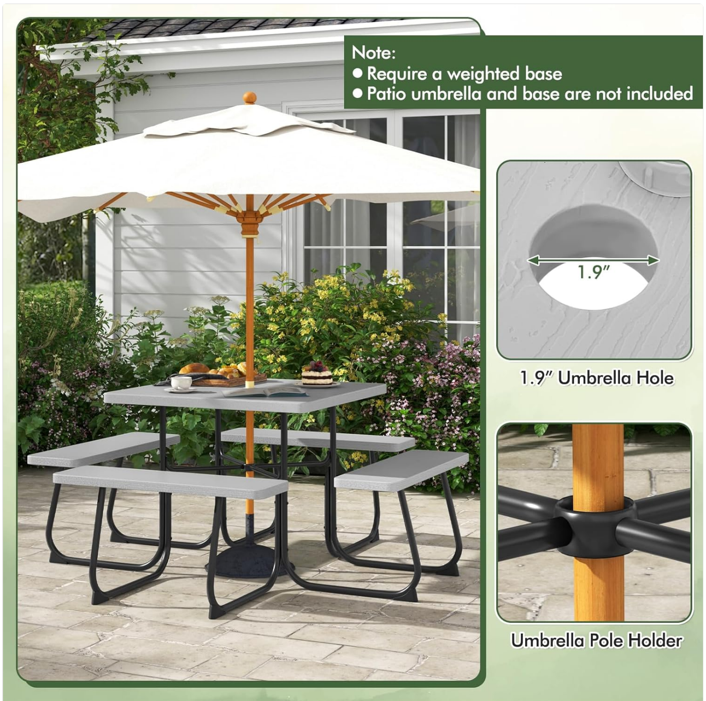
Figure 4: Detailed view of the 1.9-inch diameter umbrella hole in the tabletop and the integrated umbrella pole holder beneath, designed to secure a standard patio umbrella.