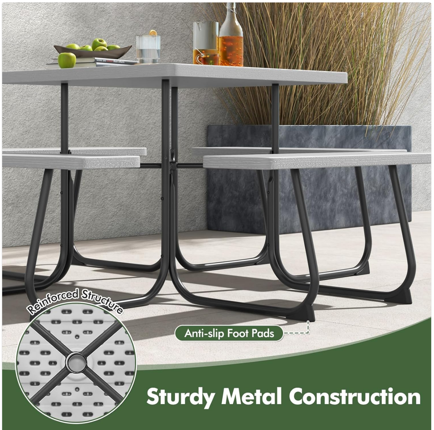
Figure 2: Detail of the sturdy metal construction, including reinforced structure under the tabletop and anti-slip foot pads on the bench legs, ensuring stability.