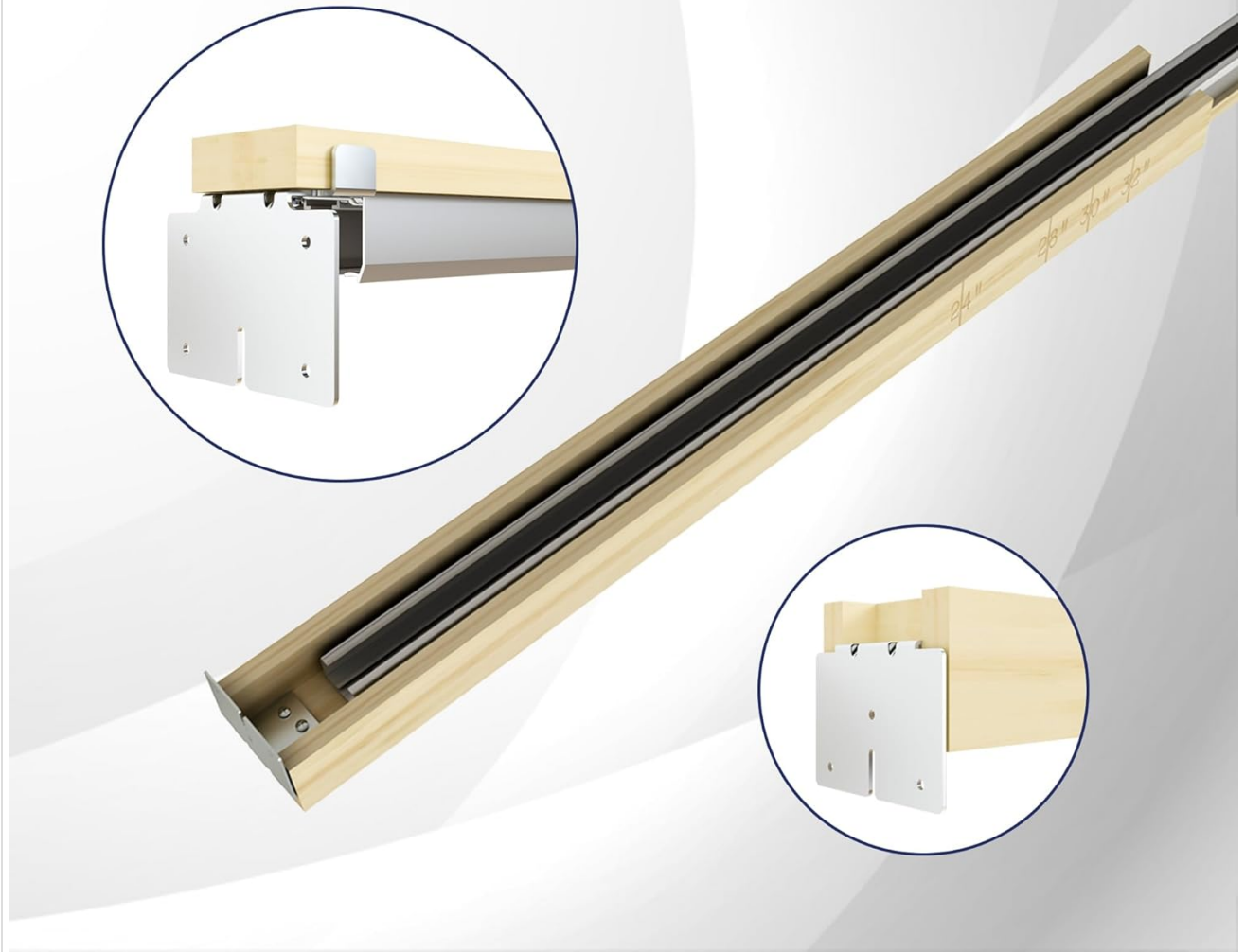
Image: Close-up of the precision aluminum box track, designed to prevent the door from jumping and ensure smooth rolling.

Precision aluminum box design prevent door jumping from track, Convex rails on track allow flexible rolling.