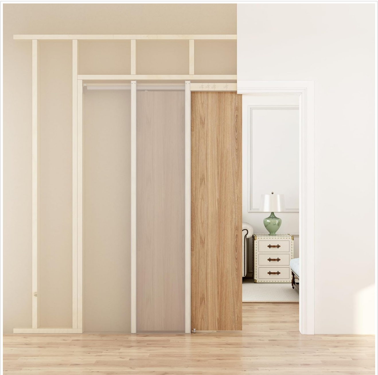
Image: A fully installed JUBEST Pocket Door Frame Kit with a wooden door, showcasing the seamless integration into a wall.

The header can be cut to accommodate different door widths. The cutting line is marked for standard door sizes (24", 28", 30", 32"). If your door size is not standard, measure from the fixed bracket end of the header board 2 times the door width plus 1 inch, then mark and cut the wood header and metal track accordingly. The metal track should be cut 1 3/8 inches shorter than the wood header.