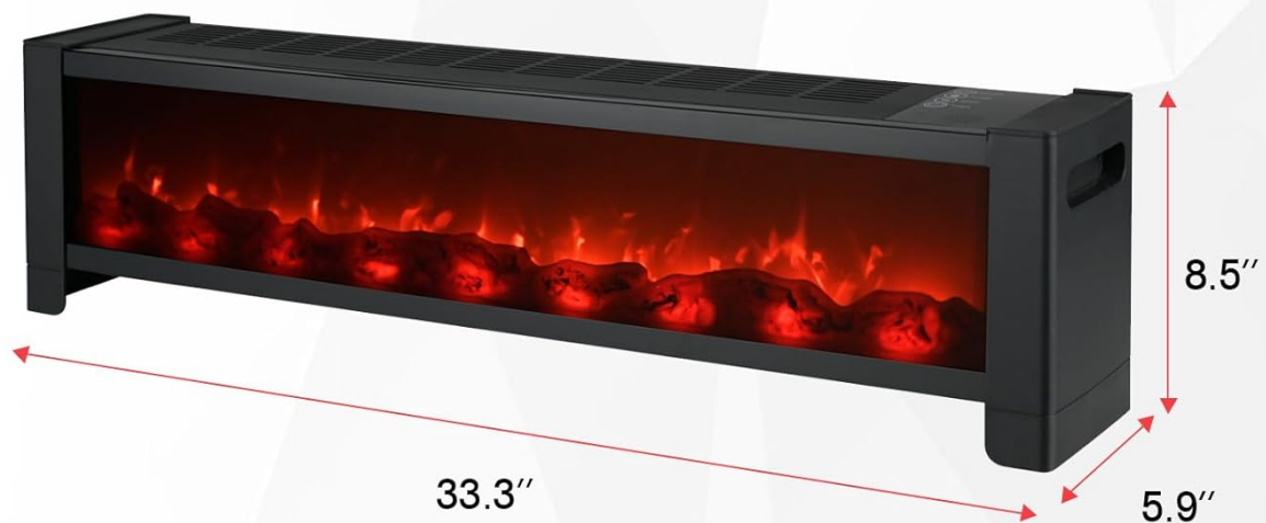
Figure 4: Product dimensions and key electrical specifications.