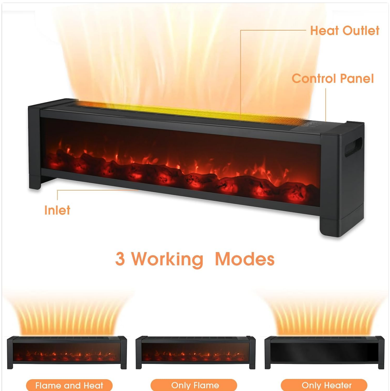
Figure 1: Front view of the heater highlighting the heat outlet, control panel, and inlet, along with illustrations of the three operating modes.