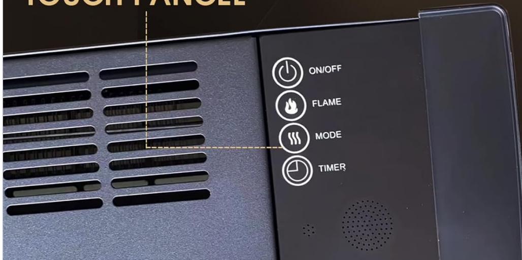
Figure 2: Detailed view of the LED touch control panel and its functions.