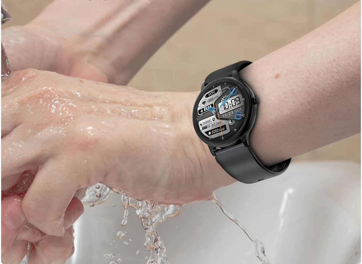
Figure 6.3: IP67 Waterproof. This image shows a person wearing the smartwatch while washing their hands under running water, illustrating the device's resistance to water splashes and brief immersion.

It makes you to deal with various daily situations while doing sports even in face of wind and rain.