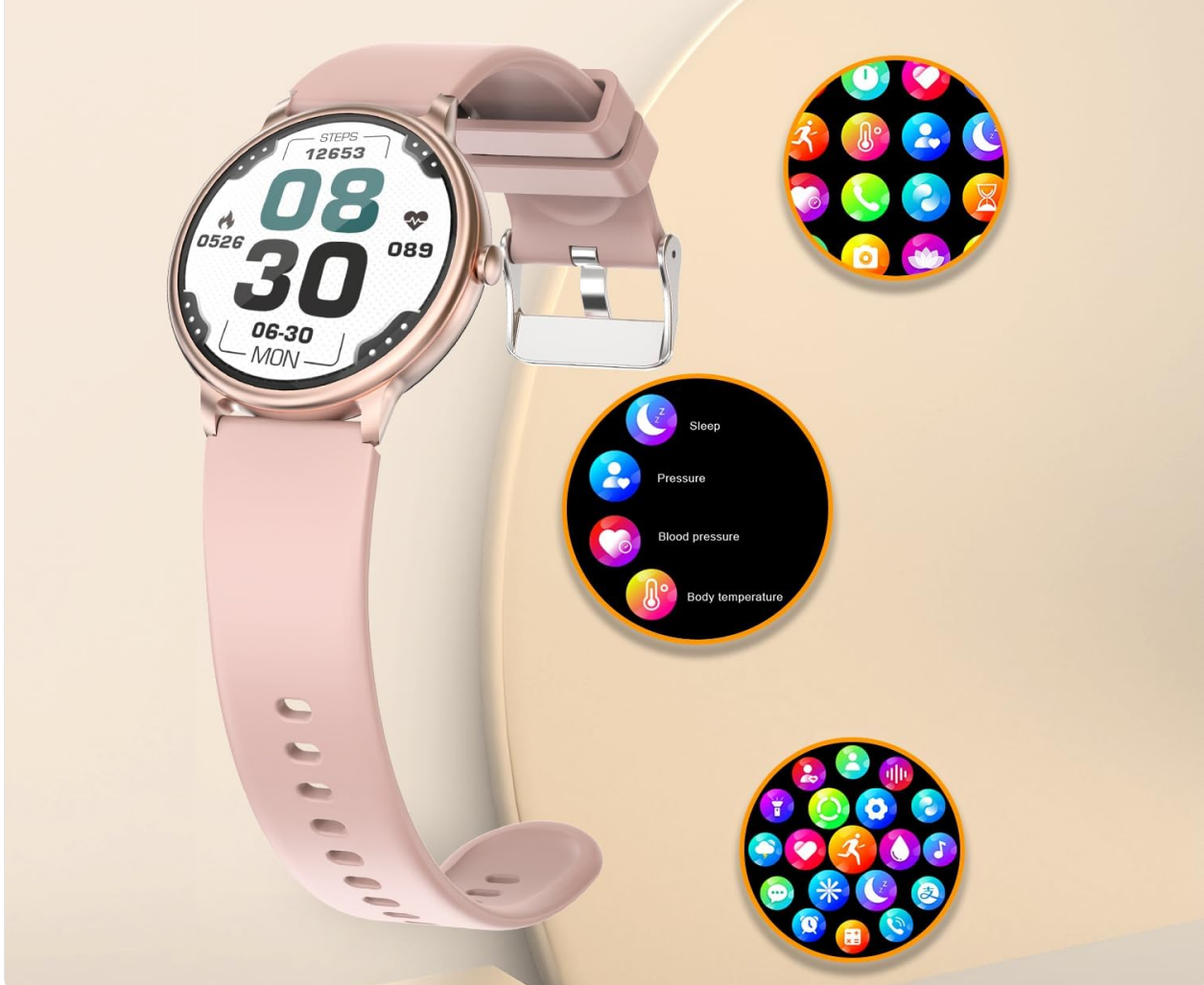
Figure 5.1: Smartwatch menu interaction. This image illustrates different menu styles available on the smartwatch, including a honeycomb grid and a vertical list, demonstrating the intuitive navigation.

Interesting menu interaction design meets diversified aesthetics. Honeycomb circular menu, And an arc list menu. There is always one that suits you. There is also a pop-up shortcut menu by swiping to the right to quickly select frequently used functions recently.