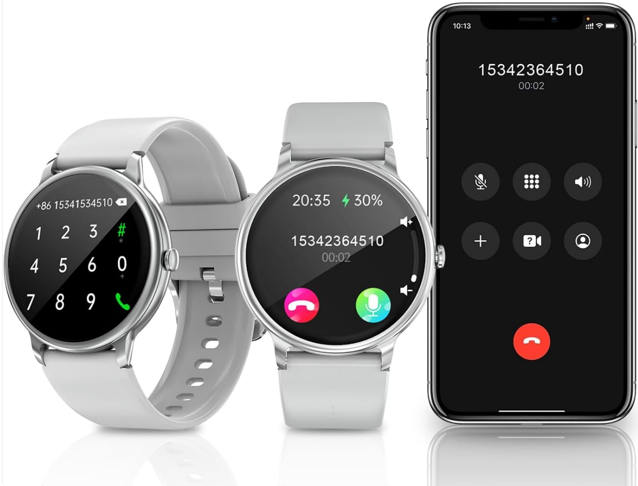
Figure 5.3: Smart reminder and notifications. This image shows the smartwatch displaying an incoming call and message icons, illustrating its ability to synchronize mobile phone information.