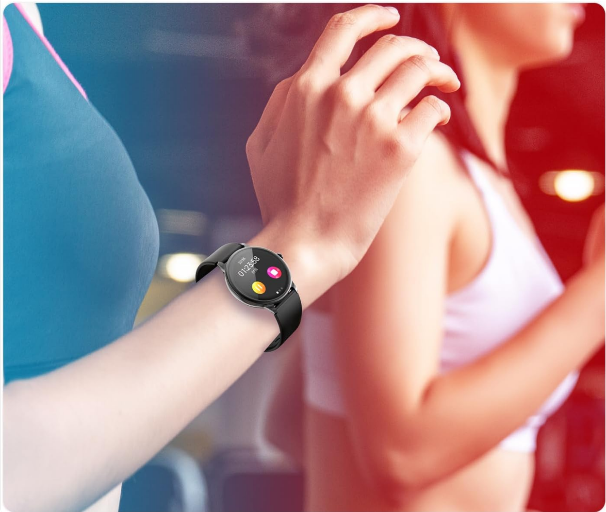
Figure 6.1: Activity modes. This image depicts a person wearing the smartwatch during a workout, emphasizing the availability of numerous activity modes for diverse exercise routines.