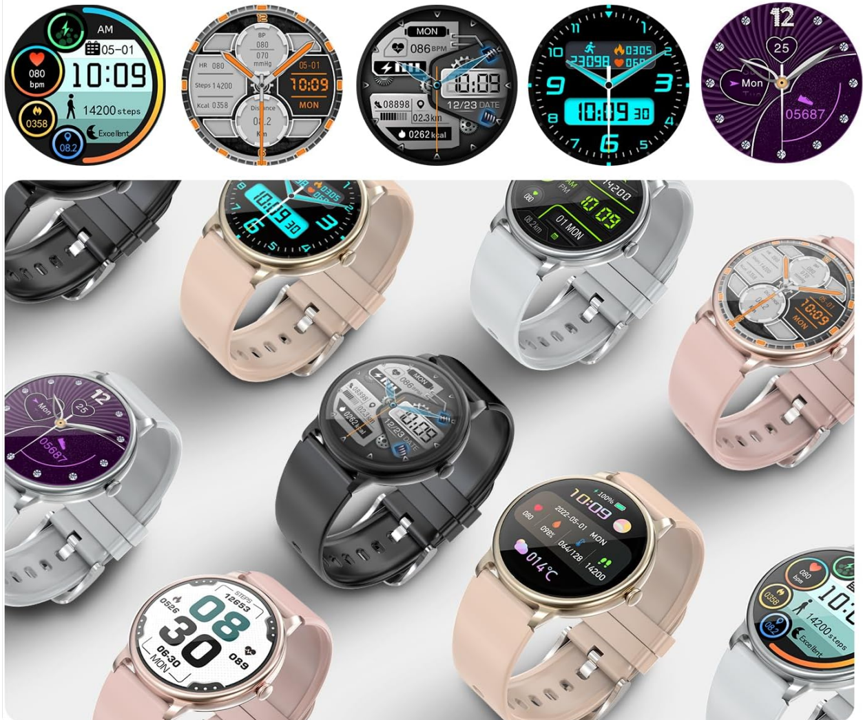
Figure 5.2: Customizable watch faces. This image displays a selection of different digital and analog watch faces available, showcasing the variety of styles users can choose from to personalize their device.

Large number of dial faces in APP background can be provided for users to choose from, Such as technical,Sports, Mechanical, Cartoon...; Custom dials by yourself. One of your favorite dial here!