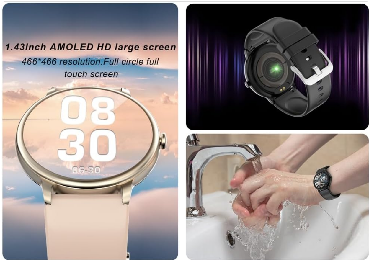
Figure 3.2: Rear view of the Smartwatch. This image highlights the green optical sensors for heart rate and blood oxygen monitoring, along with the metallic charging contacts.