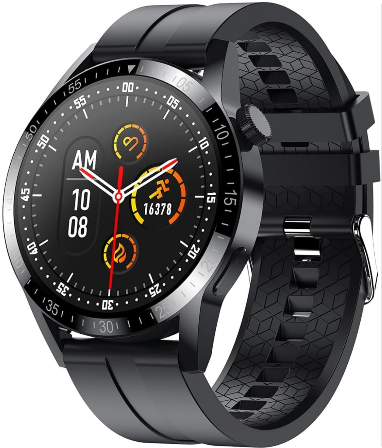
Figure 3.1: Front view of the Smartwatch. This image shows the circular display, the crown button on the right side, and the textured black silicone band.