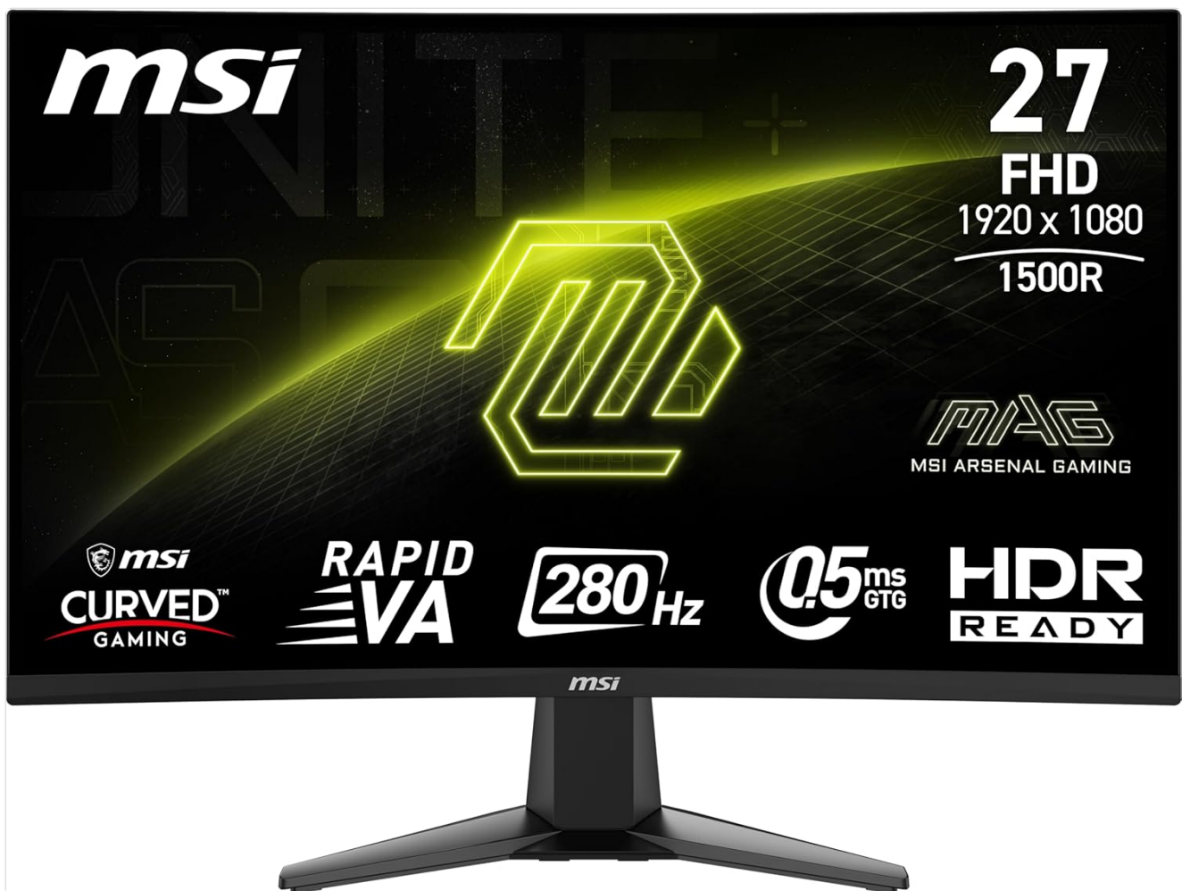
Figure 1.0.1: Front view of the MSI MAG 276CXF Curved Gaming Monitor.