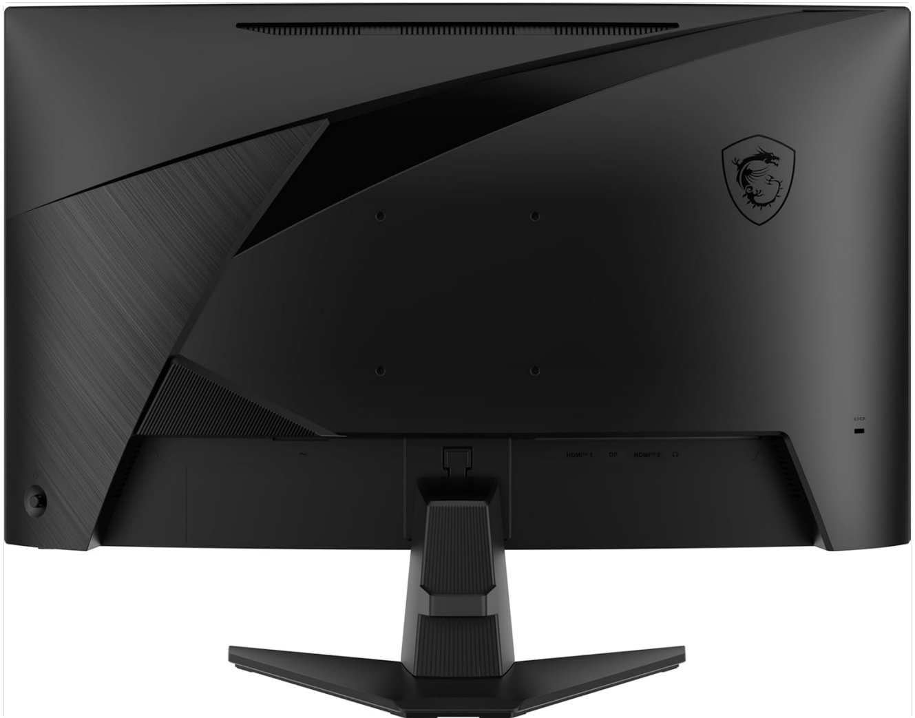
Figure 3.2.1: Rear view of the MSI MAG 276CXF monitor, highlighting the HDMI, DisplayPort, and power input connections.