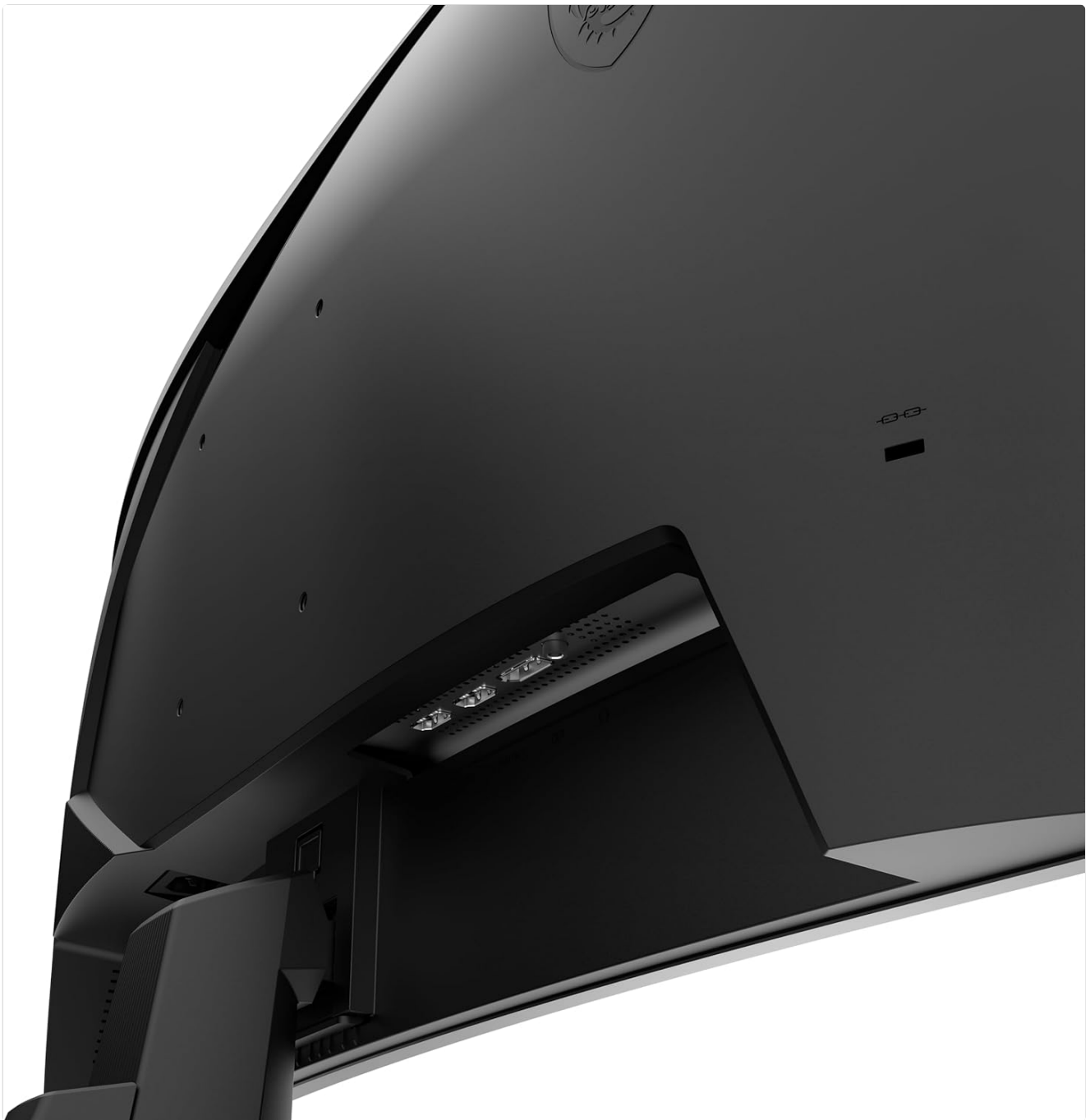
Figure 3.2.2: Bottom view of the MSI MAG 276CXF monitor, showing the downward-facing input ports for cable management.