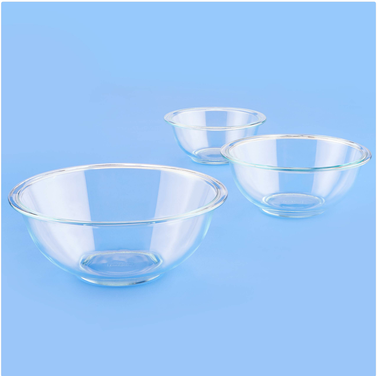
Three empty Pyrex glass mixing bowls arranged on a blue surface, displaying their clear glass and different sizes.