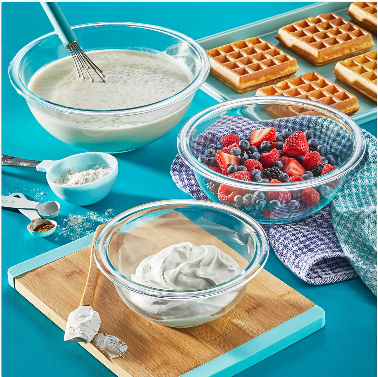
Pyrex mixing bowls filled with fresh berries, whipped cream, and waffle batter, set on a blue background with waffles, showcasing their utility for breakfast preparation.