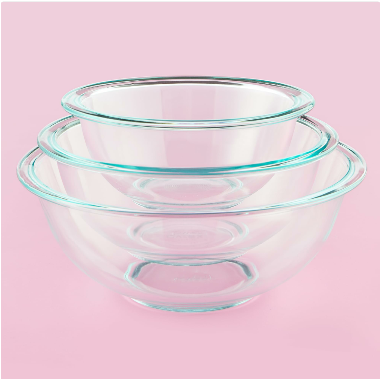
Three Pyrex glass mixing bowls nested together, demonstrating their space-saving storage capability.