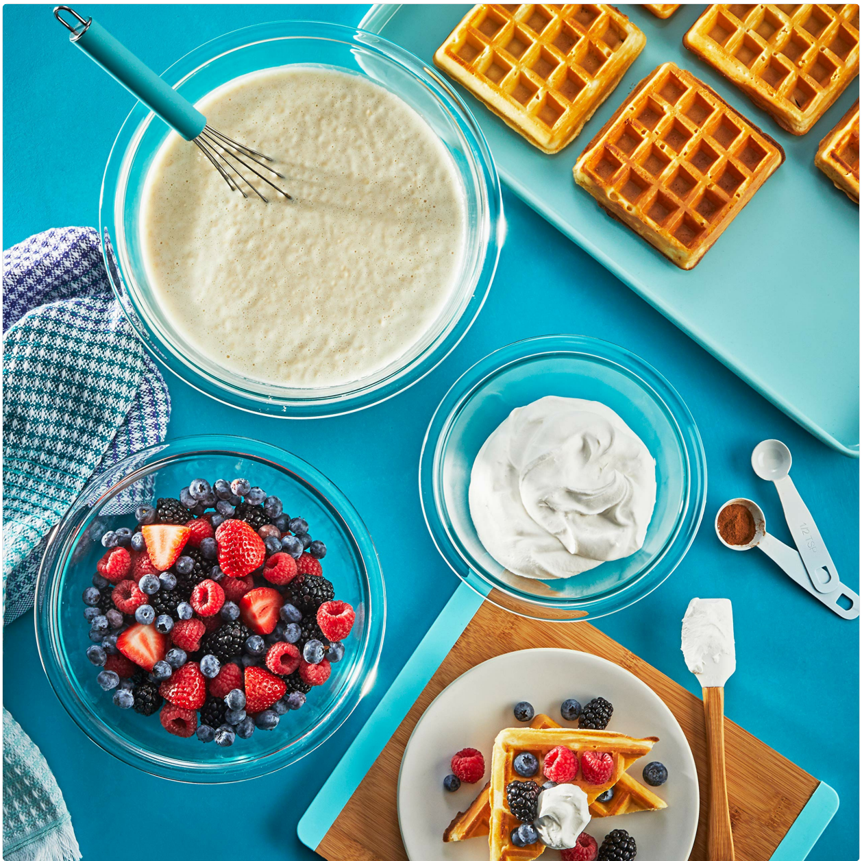
An overhead view of Pyrex mixing bowls containing waffle batter, mixed berries, and whipped cream, with waffles and measuring spoons on a blue surface, emphasizing their role in meal preparation.