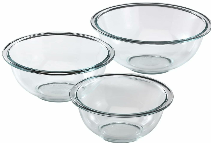
Three Pyrex Essentials glass mixing bowls, showing their clear design and varying sizes.