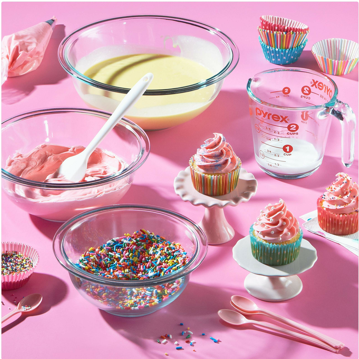
A kitchen scene with Pyrex mixing bowls containing baking ingredients like batter, frosting, and sprinkles, alongside baking tools and cupcakes, highlighting their use in baking.