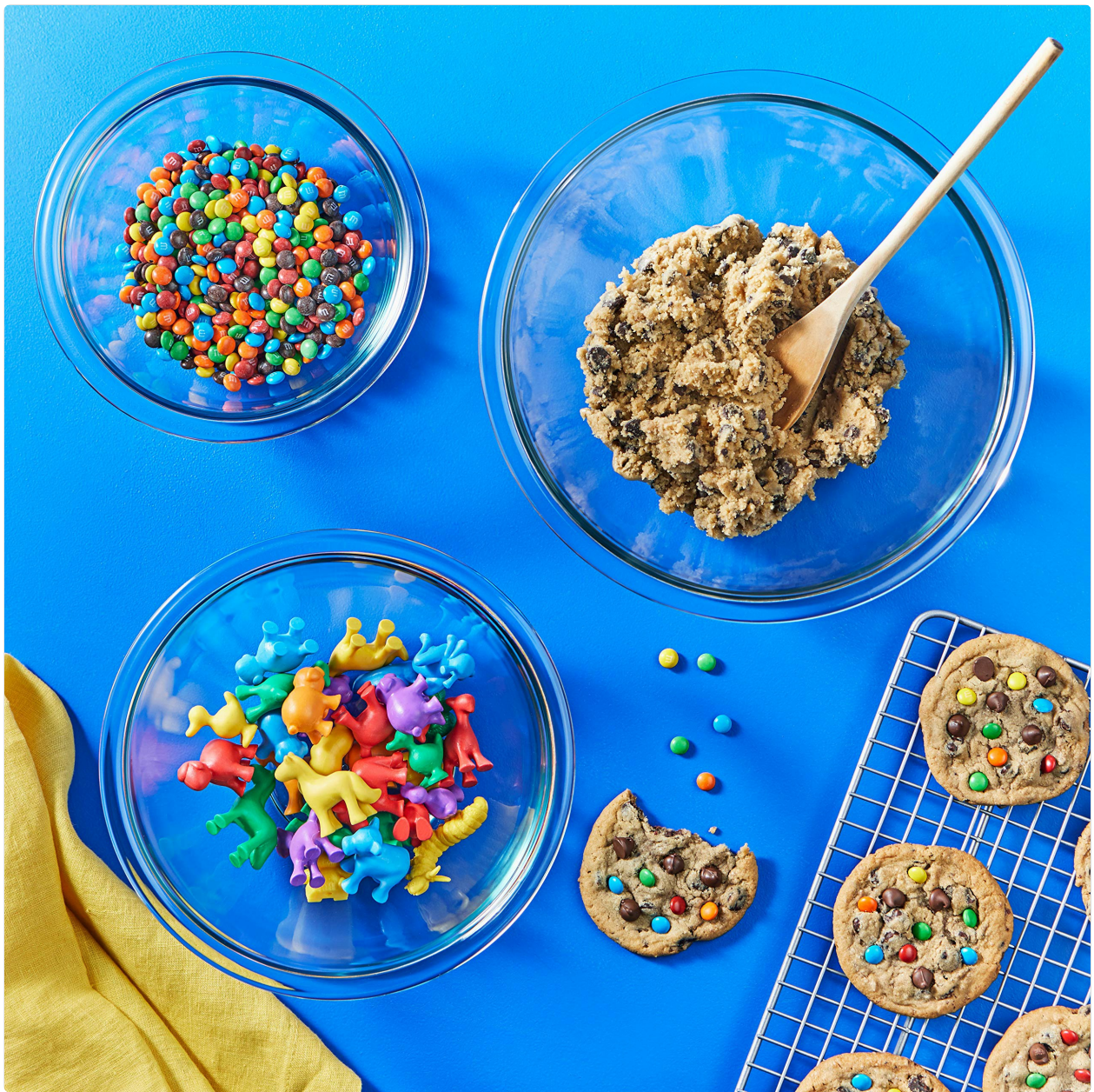
Three Pyrex mixing bowls on a blue surface, one filled with colorful candies, another with cookie dough and a wooden spoon, and a third with small plastic toys, illustrating their versatility for various uses.