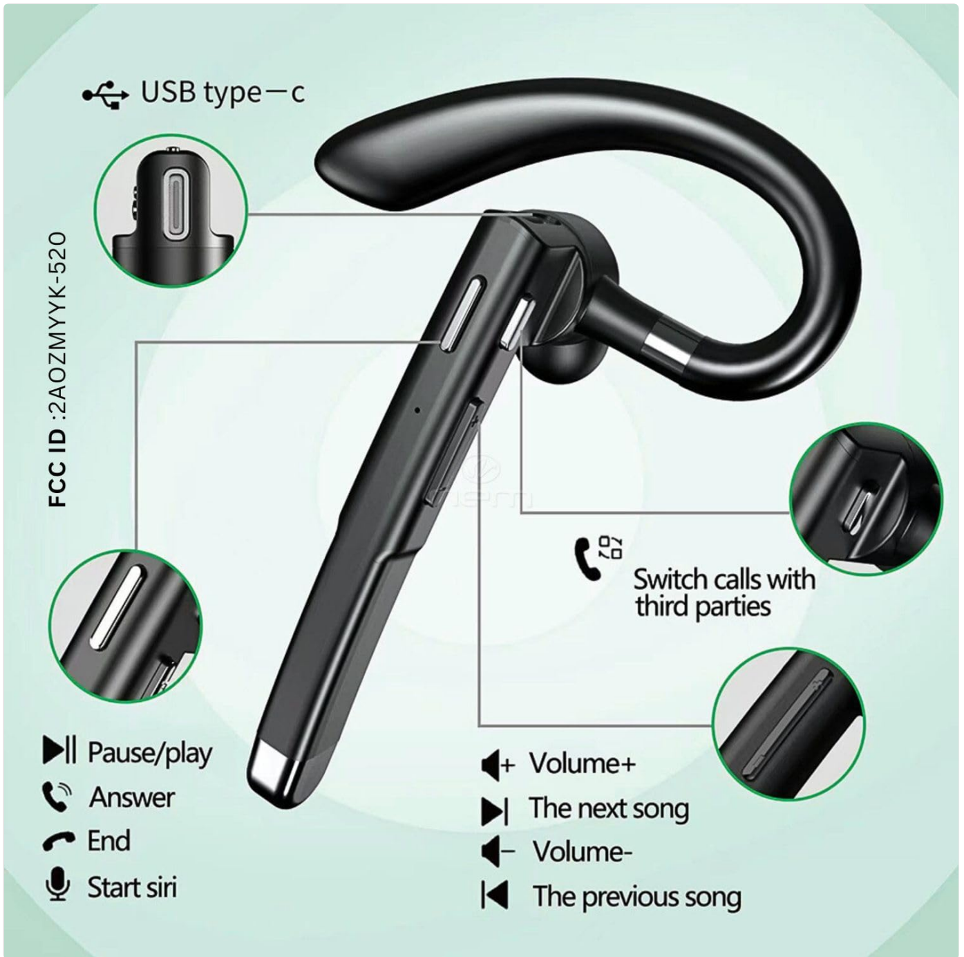
Detailed diagram illustrating the various buttons and features of the YYK-520 headset, including USB-C charging port, multi-function button for calls and playback, and volume/track controls.