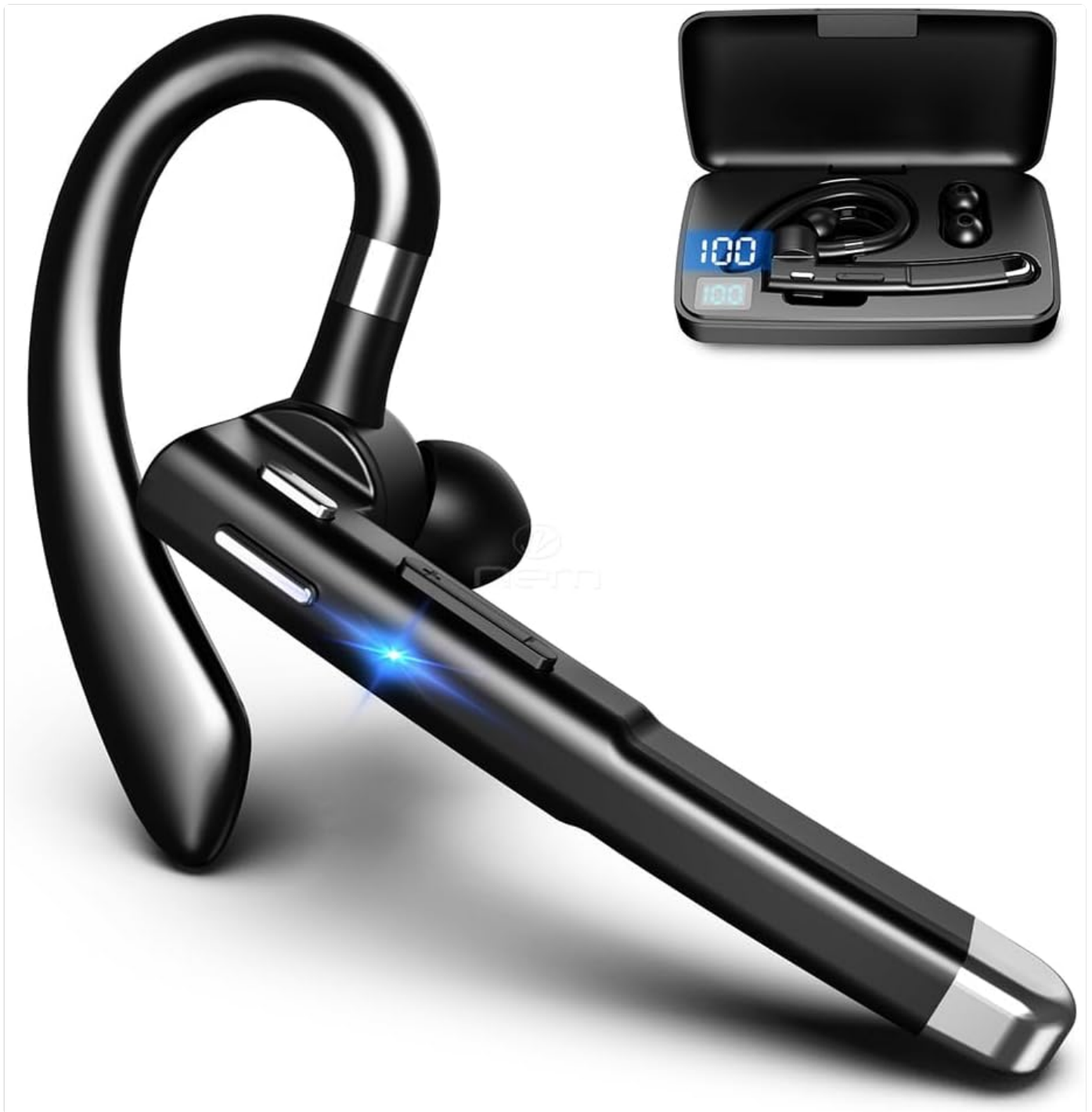
The Wireless City YYK-520 Bluetooth Headset shown with its charging case, featuring a digital battery display.