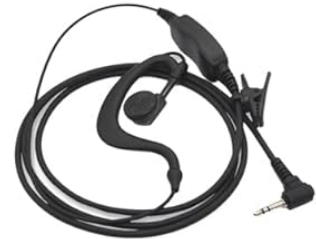
Headphones * 2