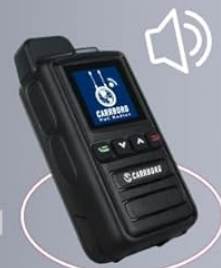
Figure 1: Contents of the Carrborg X13 Pro package, including two radios, SIM cards, chargers, cables, and accessories.

Administrator Priority Call Interruption at Any Time