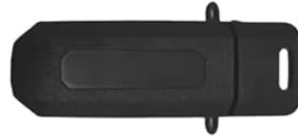
Back Clip * 2