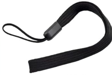
Lanyard * 2