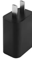
USB Charger * 2