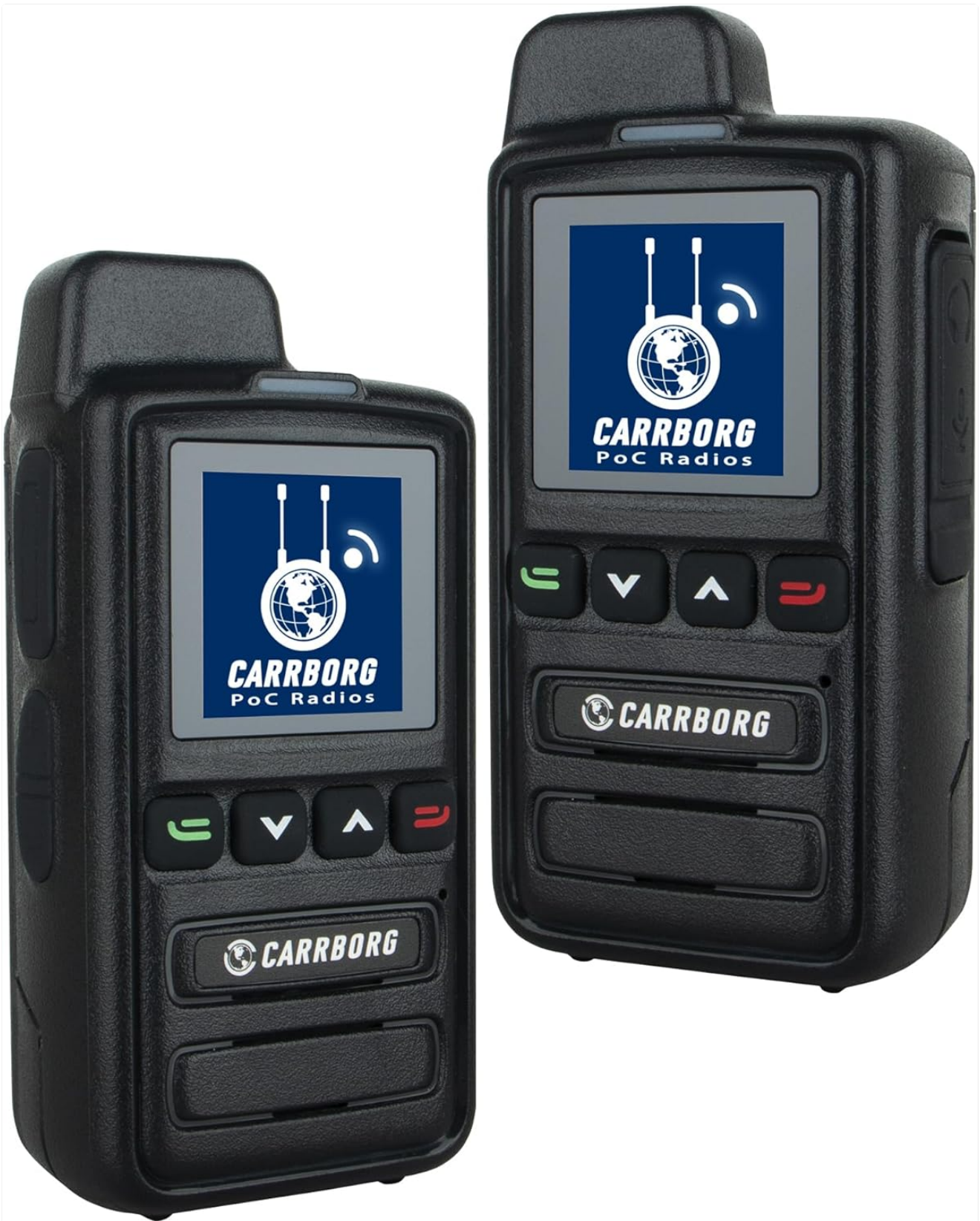
Figure 7: The Carrborg X13 Pro Global 4G Walkie Talkie.