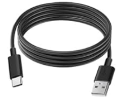
USB Type-C * 2