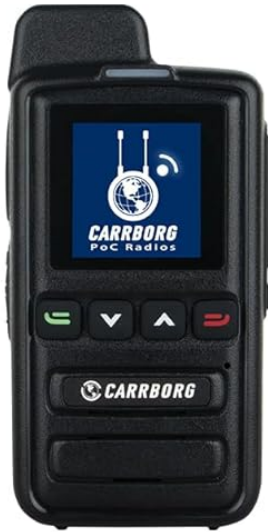
PoC Radios * 2