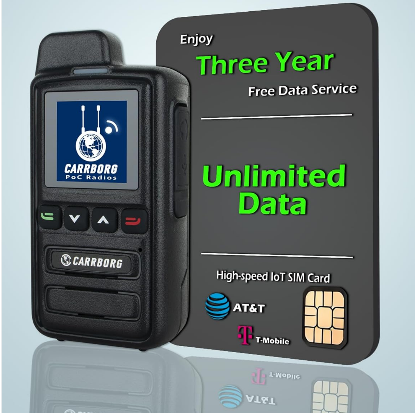
Figure 2: The Carrborg X13 Pro walkie talkie with its included SIM card, highlighting the three-year free data service.