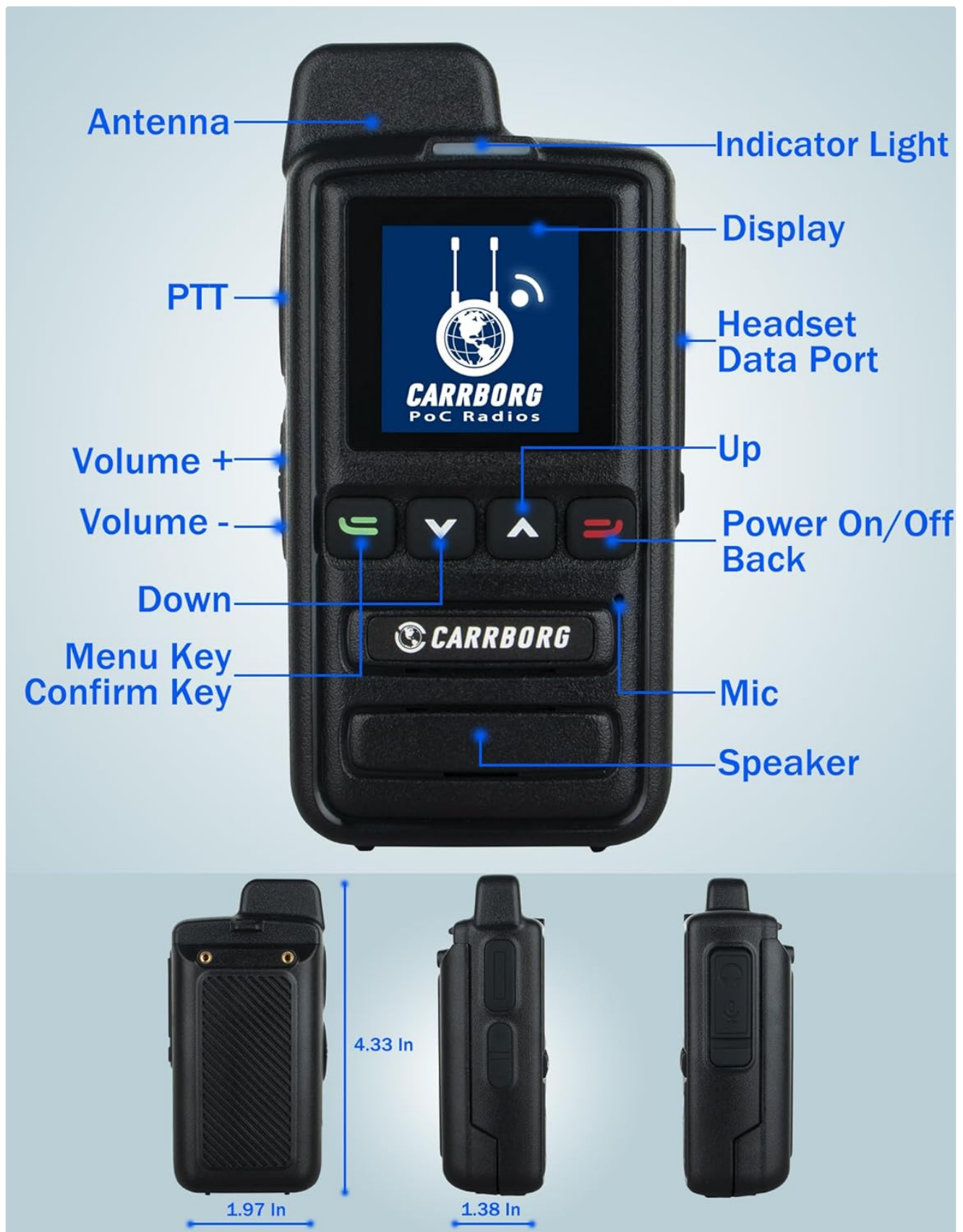
Figure 3: Labeled diagram of the X13 Pro walkie talkie, indicating the location of its various components and controls.