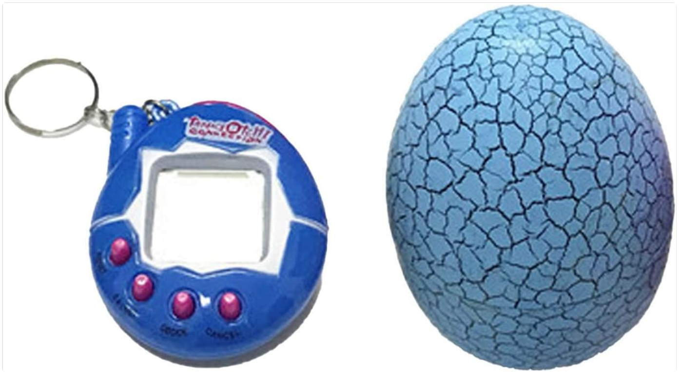
Image: The Yosoo Electronic Pet Game Machine (blue) alongside its matching egg-shaped protective case.

Egg-Shaped Case: Provides protection and portability for the electronic pet.