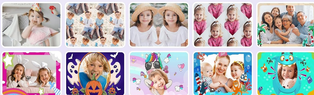
Image: Examples of frames and filters available on the camera.