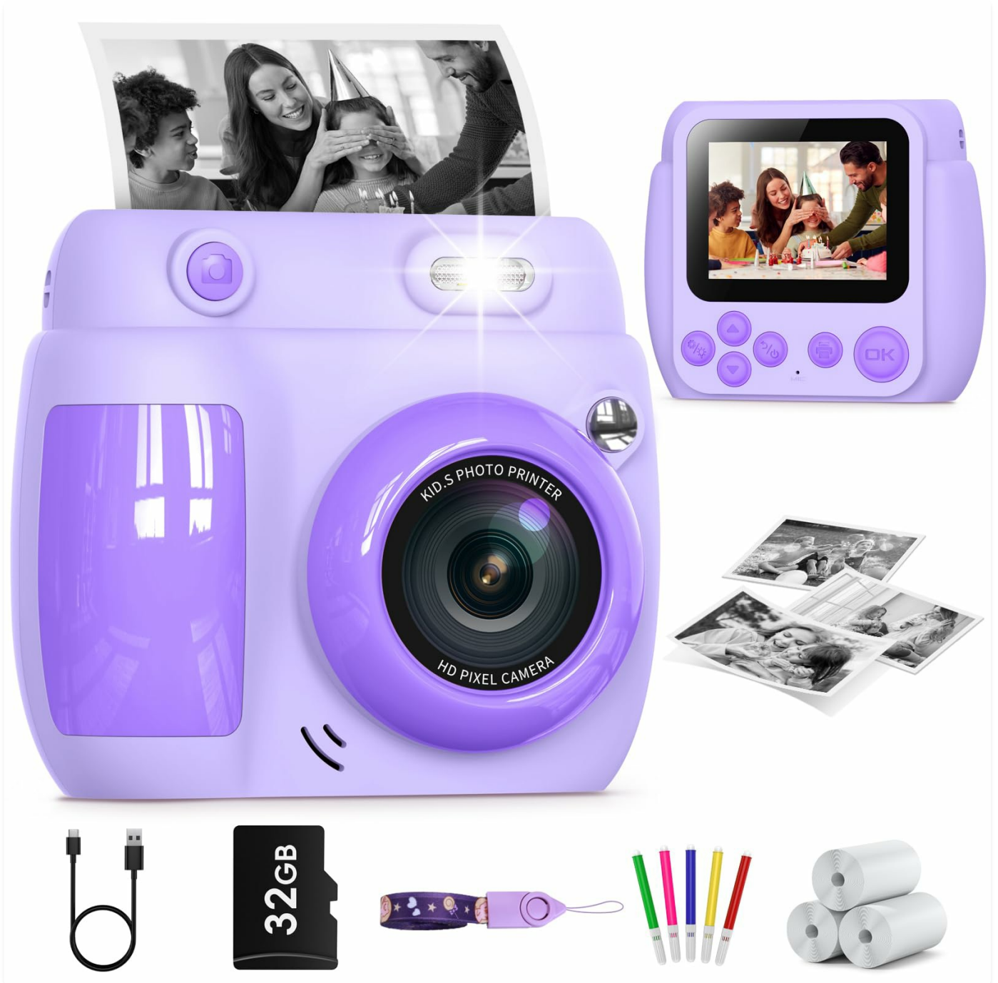
Image: The Gofunly Kids Instant Print Camera H6, purple model.