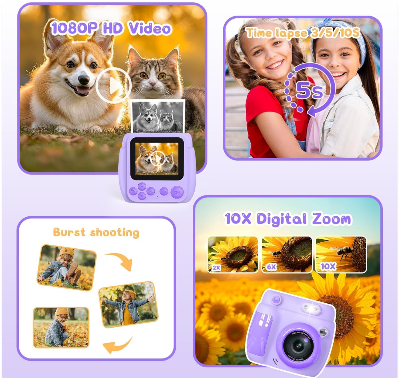
Image: Overview of the camera's multifunctional capabilities.