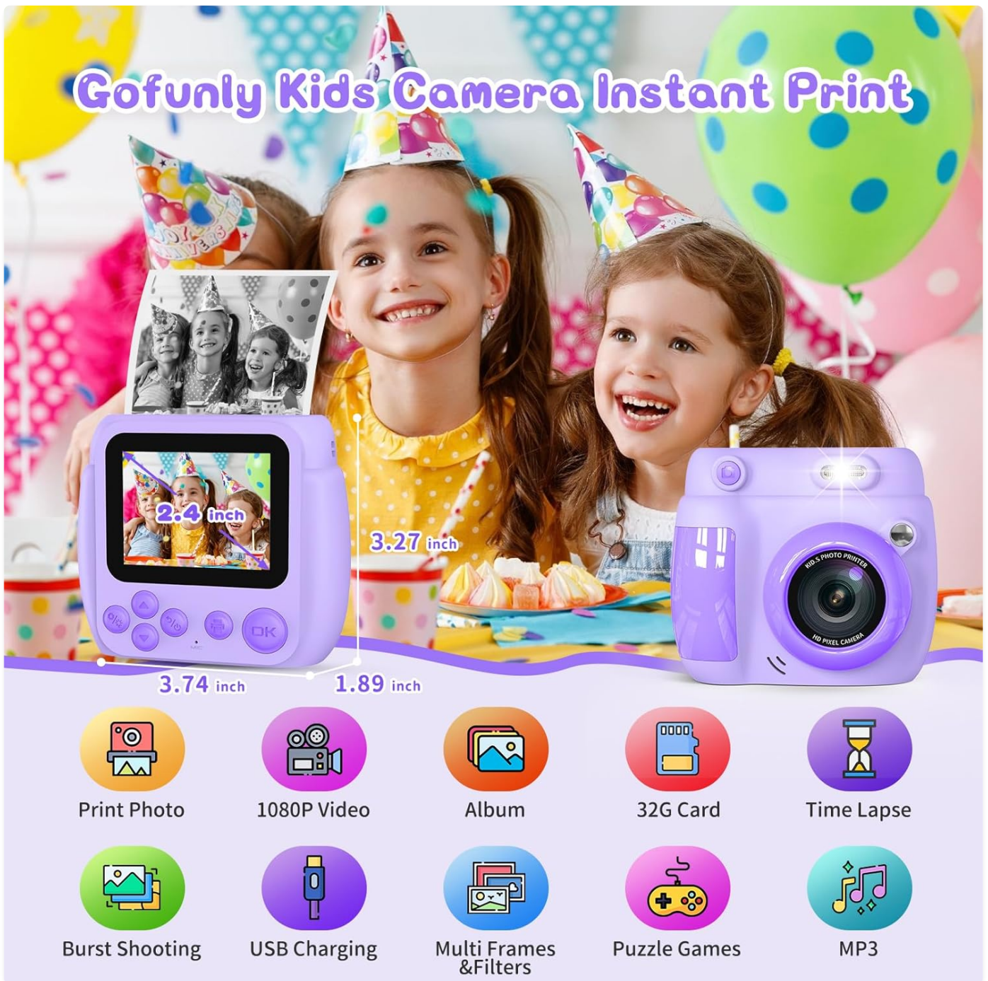
Image: All items included in the Gofunly Kids Instant Print Camera package.