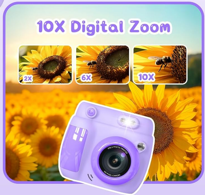
Image: Illustration of the camera's 10x digital zoom feature.