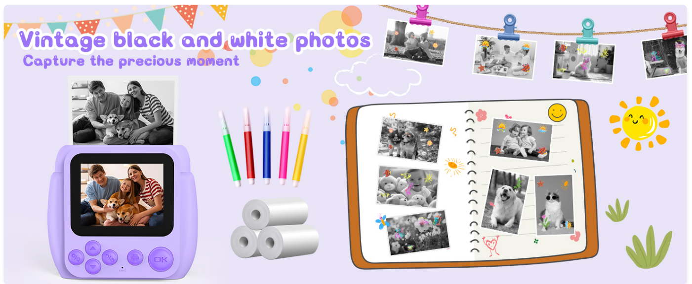
Image: The camera capturing and printing a black and white photo.

Your browser does not support the video tag.