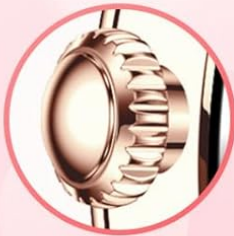
Fine rounded threaded handle