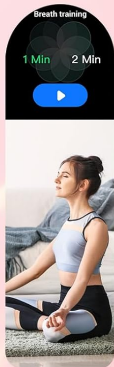
Image: The LIGE Smart Watch displaying various health metrics such as heart rate, blood pressure, blood oxygen, and sleep