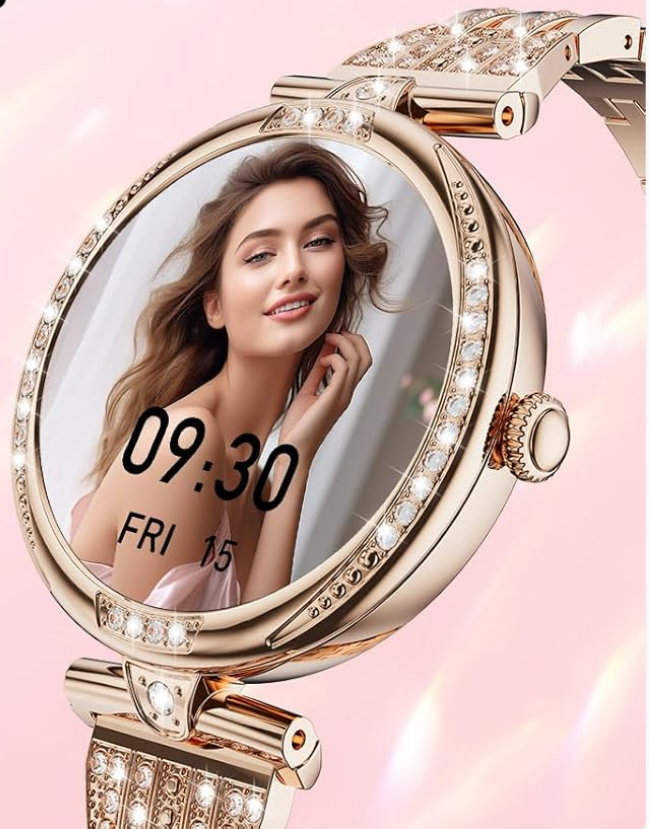
Image: A close-up of the LIGE Smart Watch's delicate 1.19-inch AMOLED screen, highlighting its clear display and customizable wallpaper options.