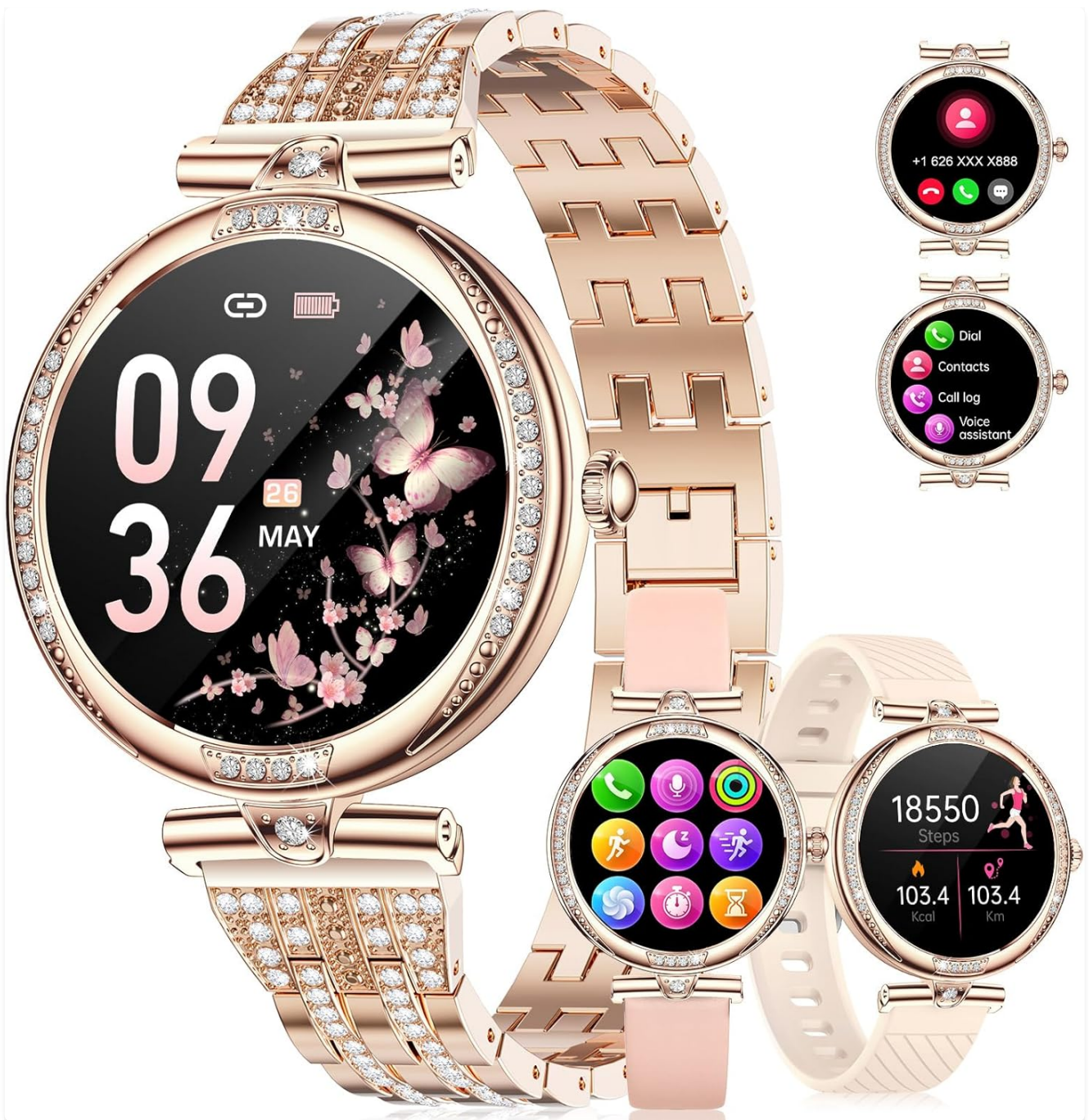
Image: The LIGE Smart Watch featuring a rose gold band and a diamond-studded bezel, showcasing its elegant design and digital display.