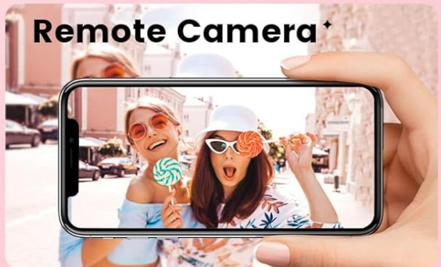
Image: A visual overview of the LIGE Smart Watch's various functions, including music control, alarm, weather, remote camera, and other utility features.