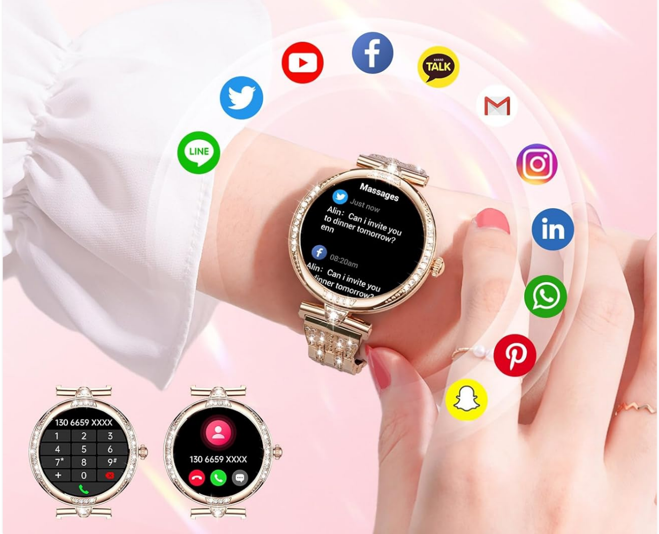
Image: The LIGE Smart Watch displaying call and message notifications, illustrating its Bluetooth connectivity for communication.

Video: Demonstrates the LIGE Smart Watch's ability to answer and make calls directly from the wrist, compatible with Android and iOS devices.