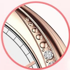
Stamping Embossing Process