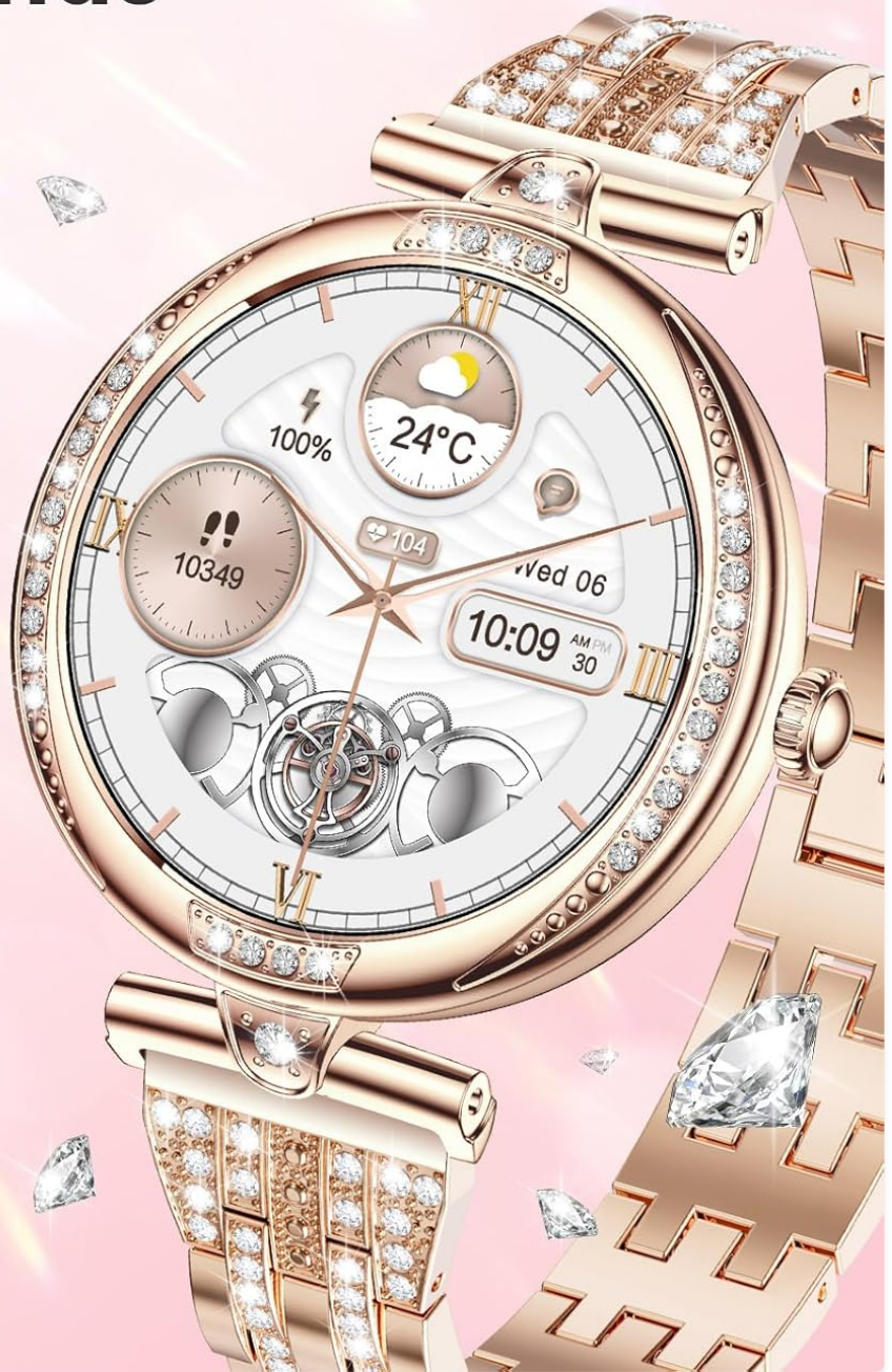
Image: A close-up view of the LIGE Smart Watch, emphasizing its diamond-studded bezel and intricate design details.