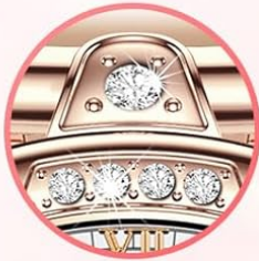
Dial set with 32 zirconia diamonds