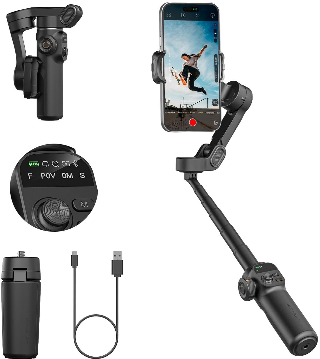
Figure 2.1: Smart X2 Gimbal Stabilizer and included accessories.