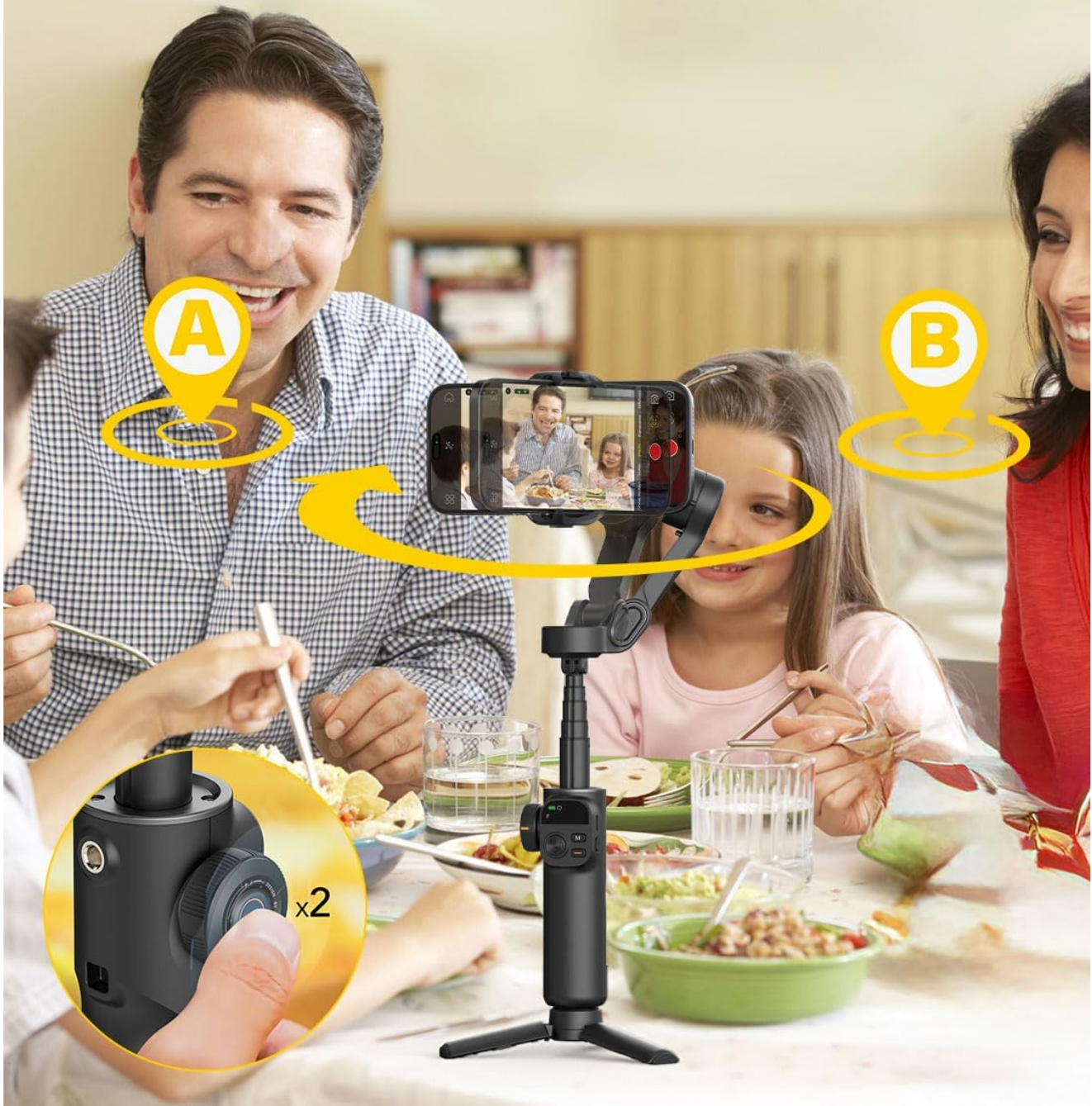
Figure 4.1: Illustrates the double-click function of the combination key for panoramic shots.