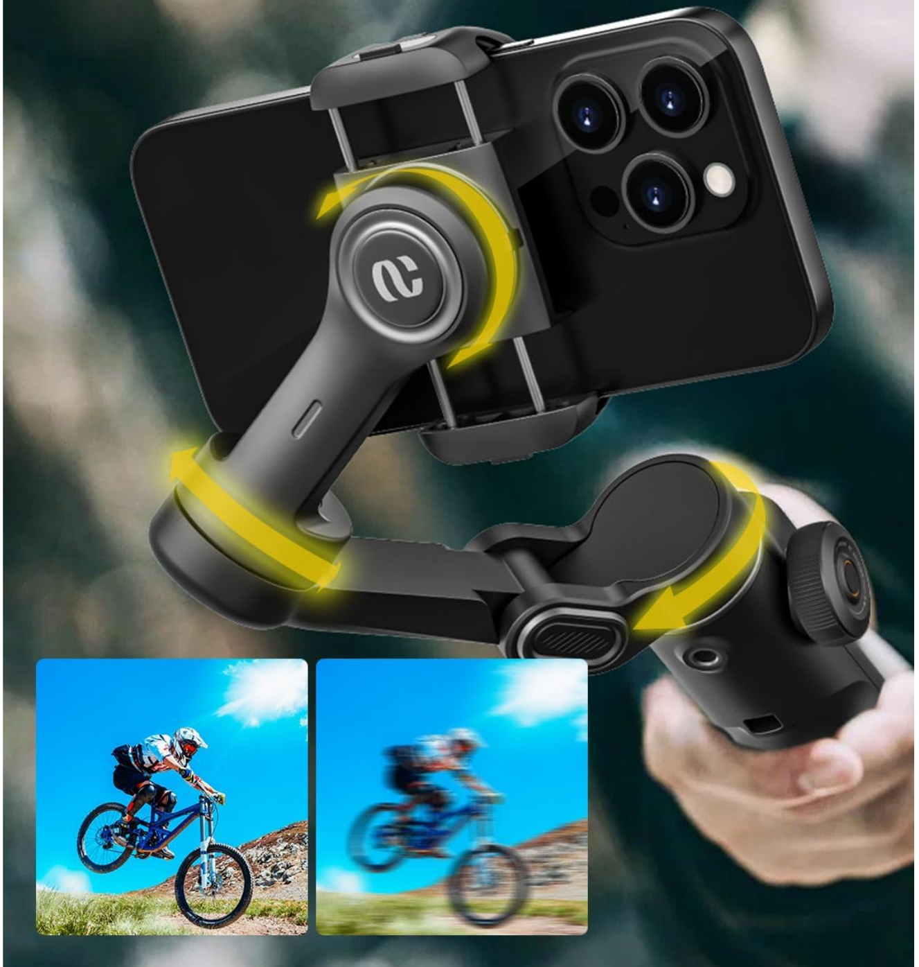
Figure 2.2: Visual representation of Aochuan 8.0 Smart Stabilization.