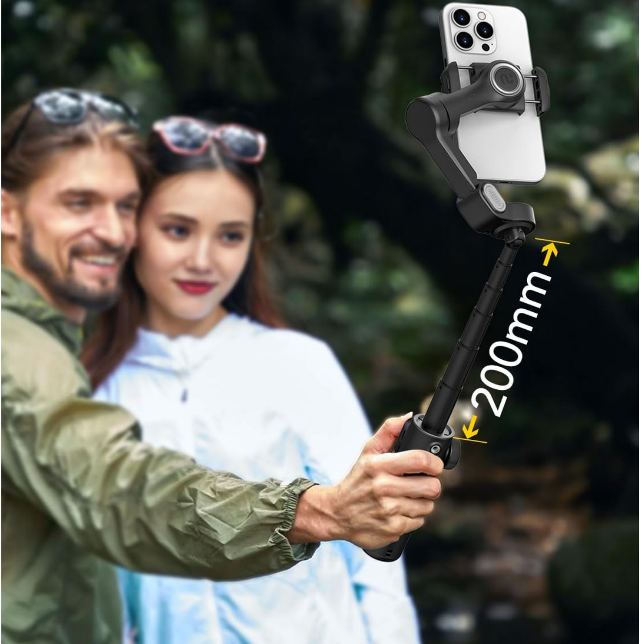
Figure 4.2: The Smart X2 gimbal demonstrating its built-in 20cm extension rod.