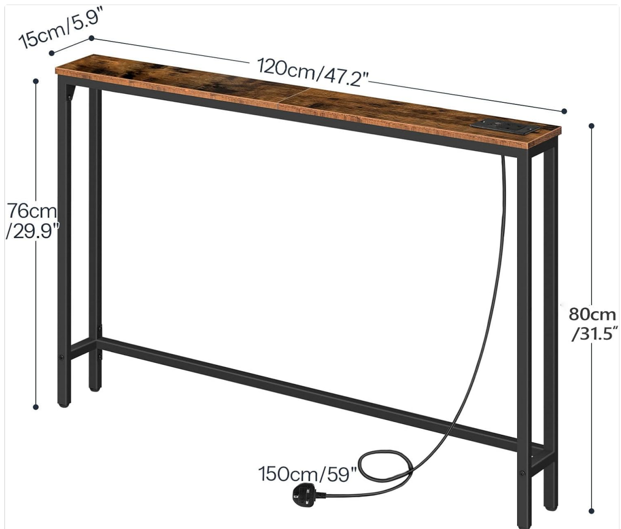
Image: Overall dimensions of the console table.