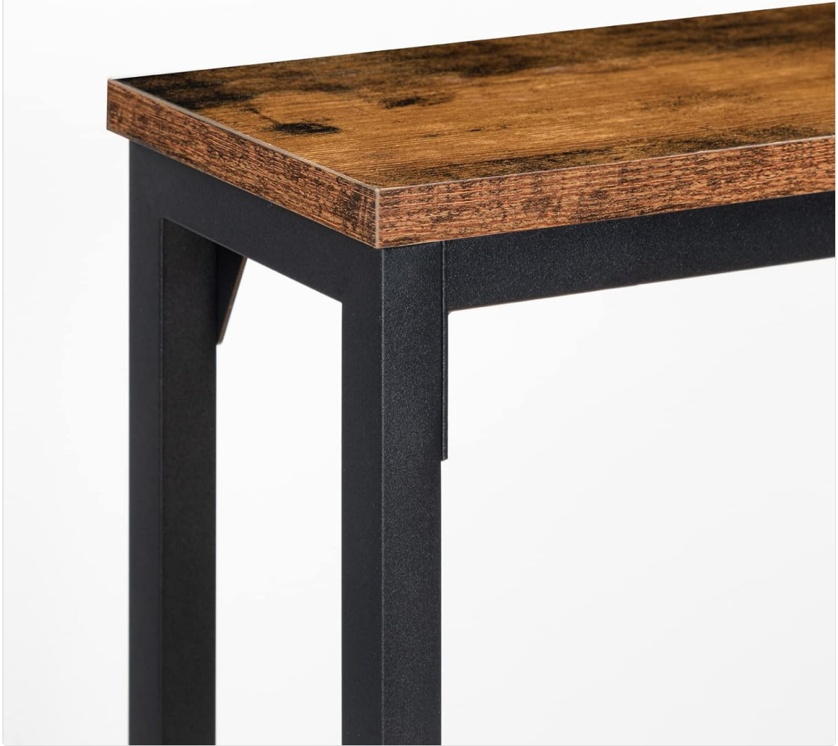
Image: Detail of the robust metal frame construction.

Hardworking materials will bring years of enjoyment.