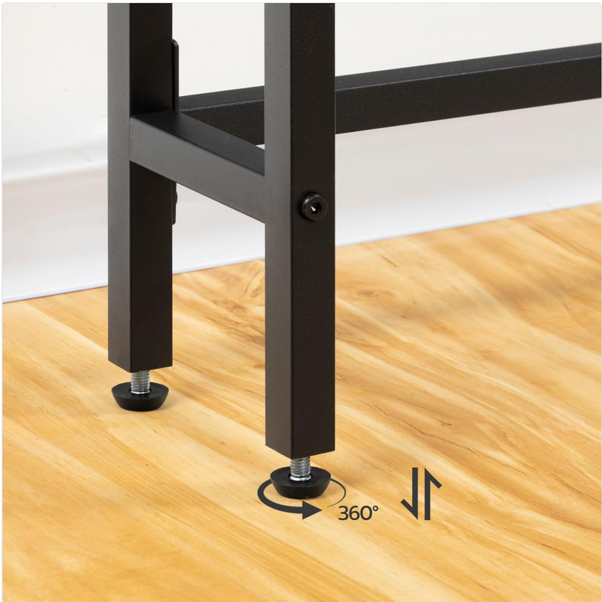
Image: Adjustable feet for stability on various surfaces.