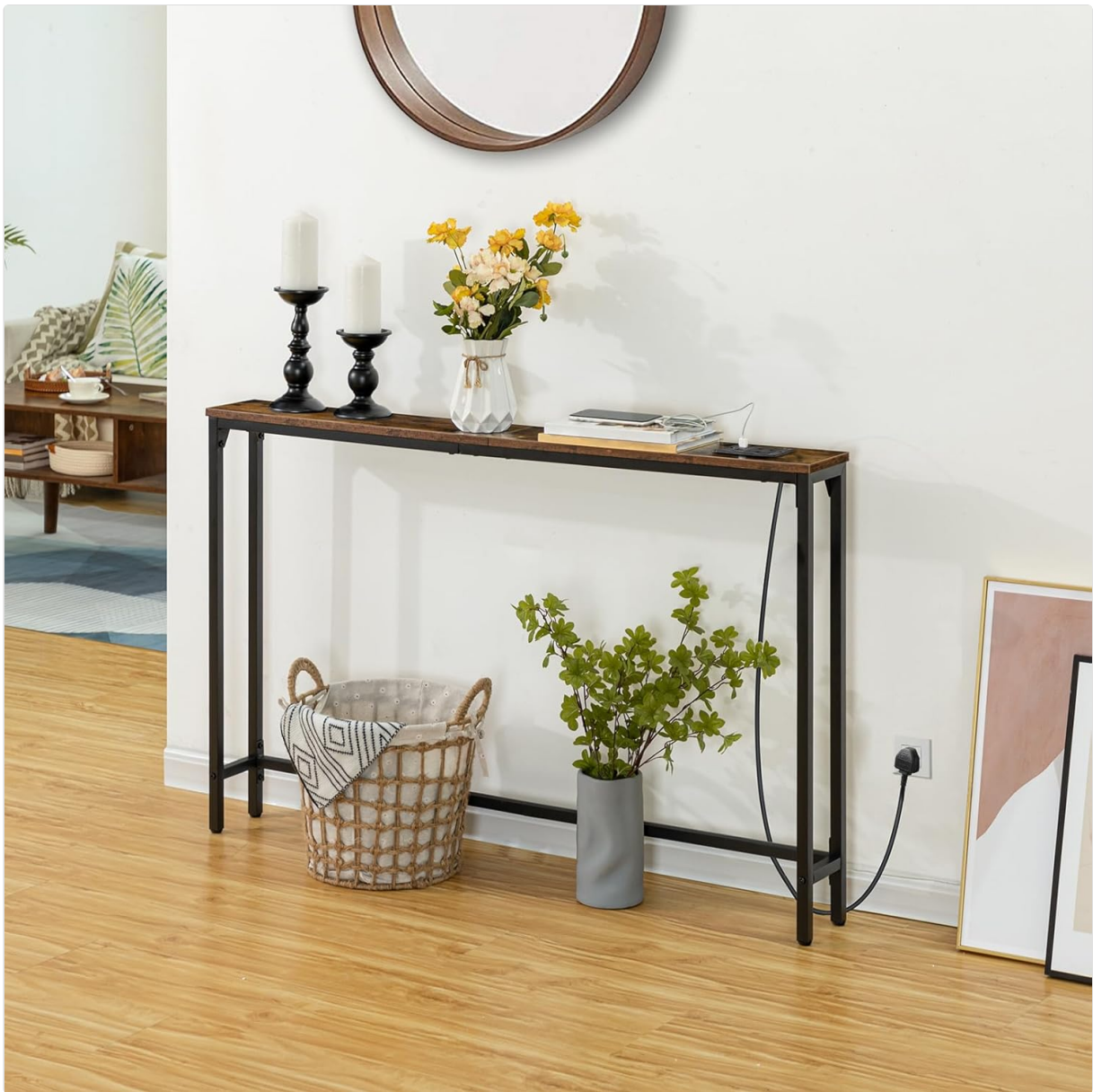
Image: Example of the console table in use, charging devices.