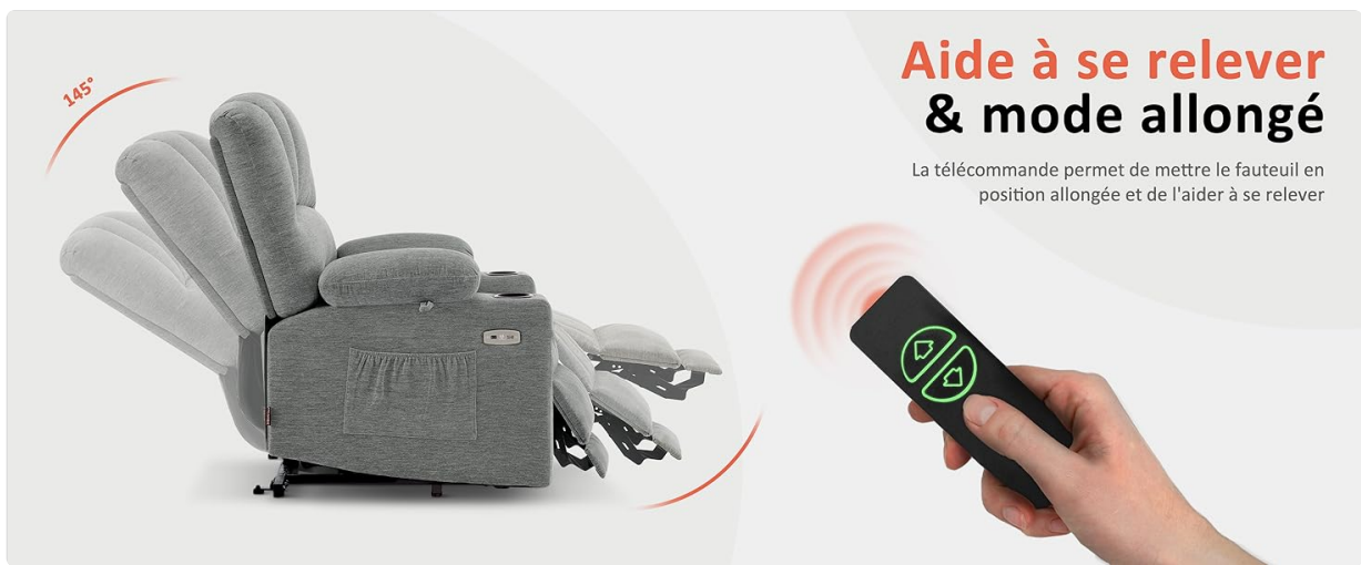
Image 5.1: Remote control for lift and recline functions, illustrating the chair's lifting motion.