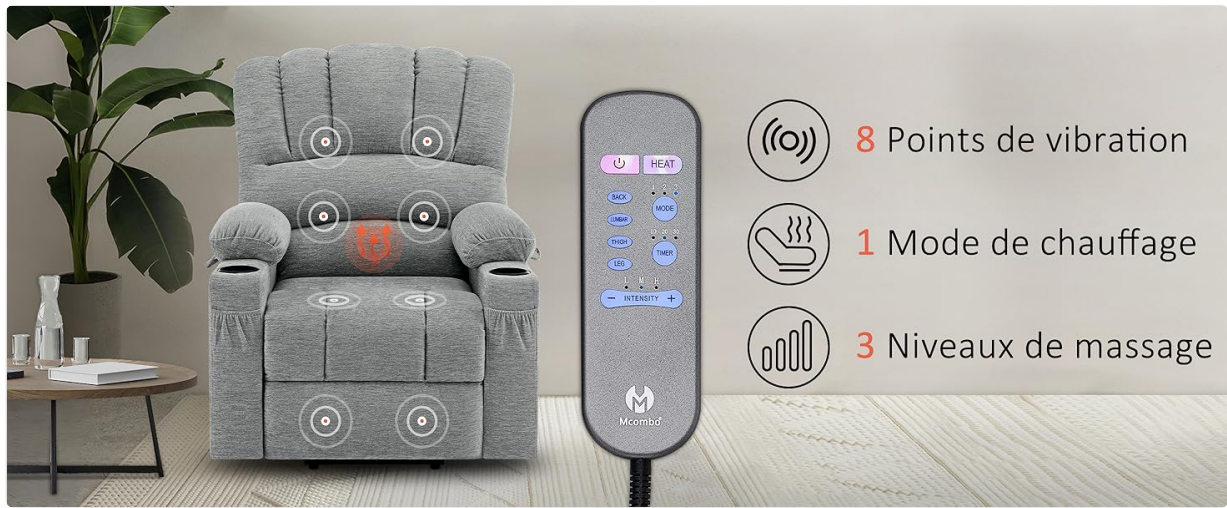
Image 5.3: Massage and heat remote control, highlighting the 8 vibration points and heating area on the chair.