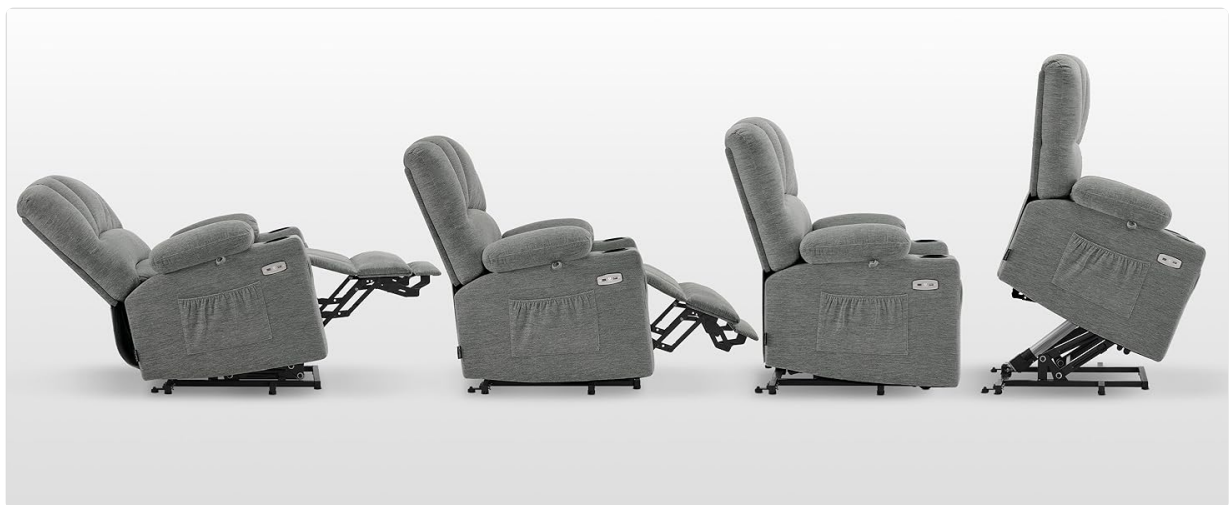
Image 5.2: Visual representation of the chair's recline stages, from upright to fully reclined.