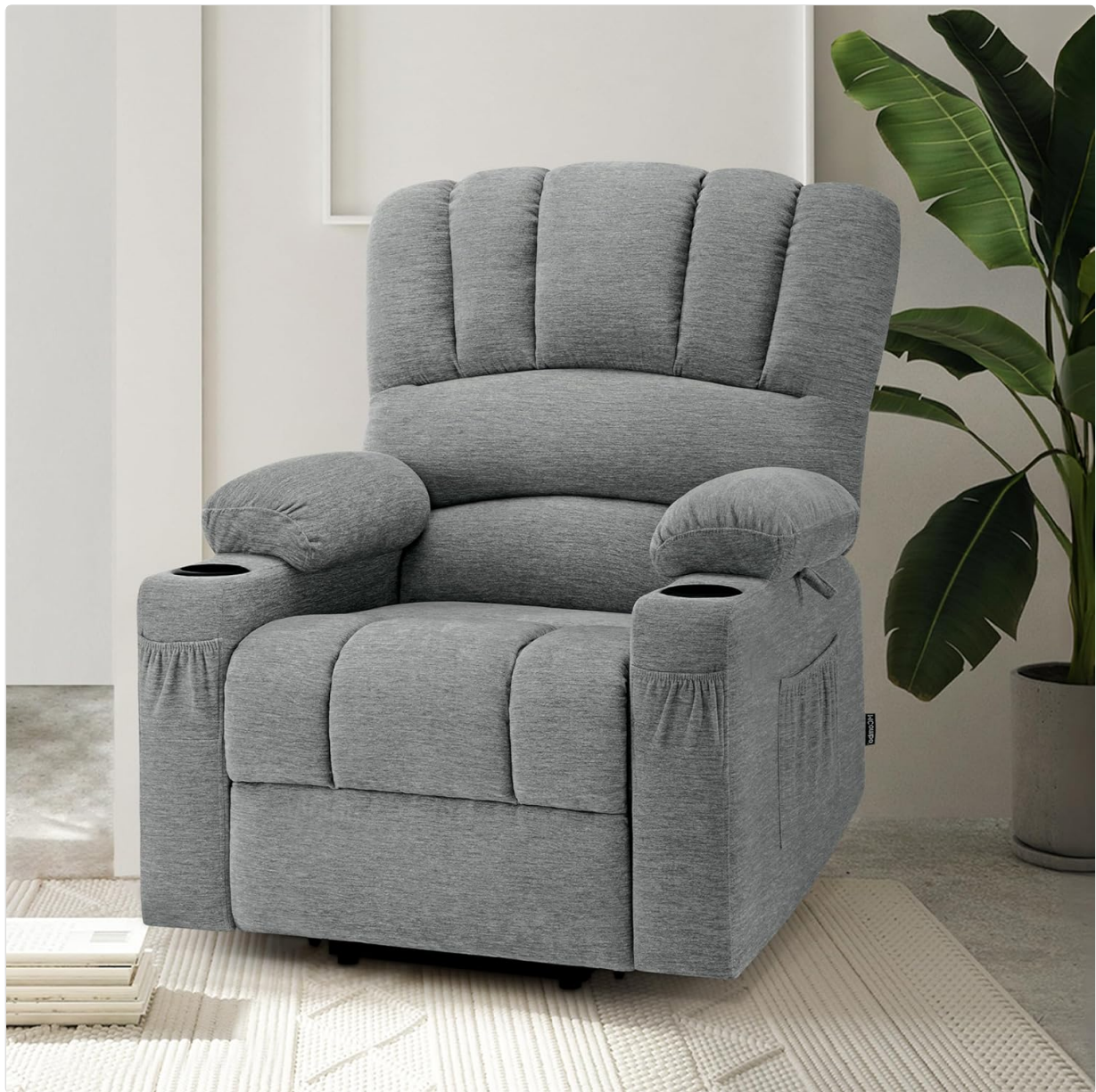
Image 4.1: The recliner chair assembled in a living room environment.