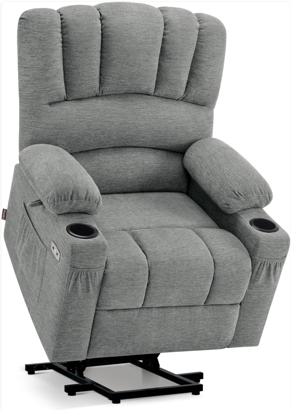
Image 1.1: Front view of the M MCombo Electric Lift Recliner Chair in grey fabric.