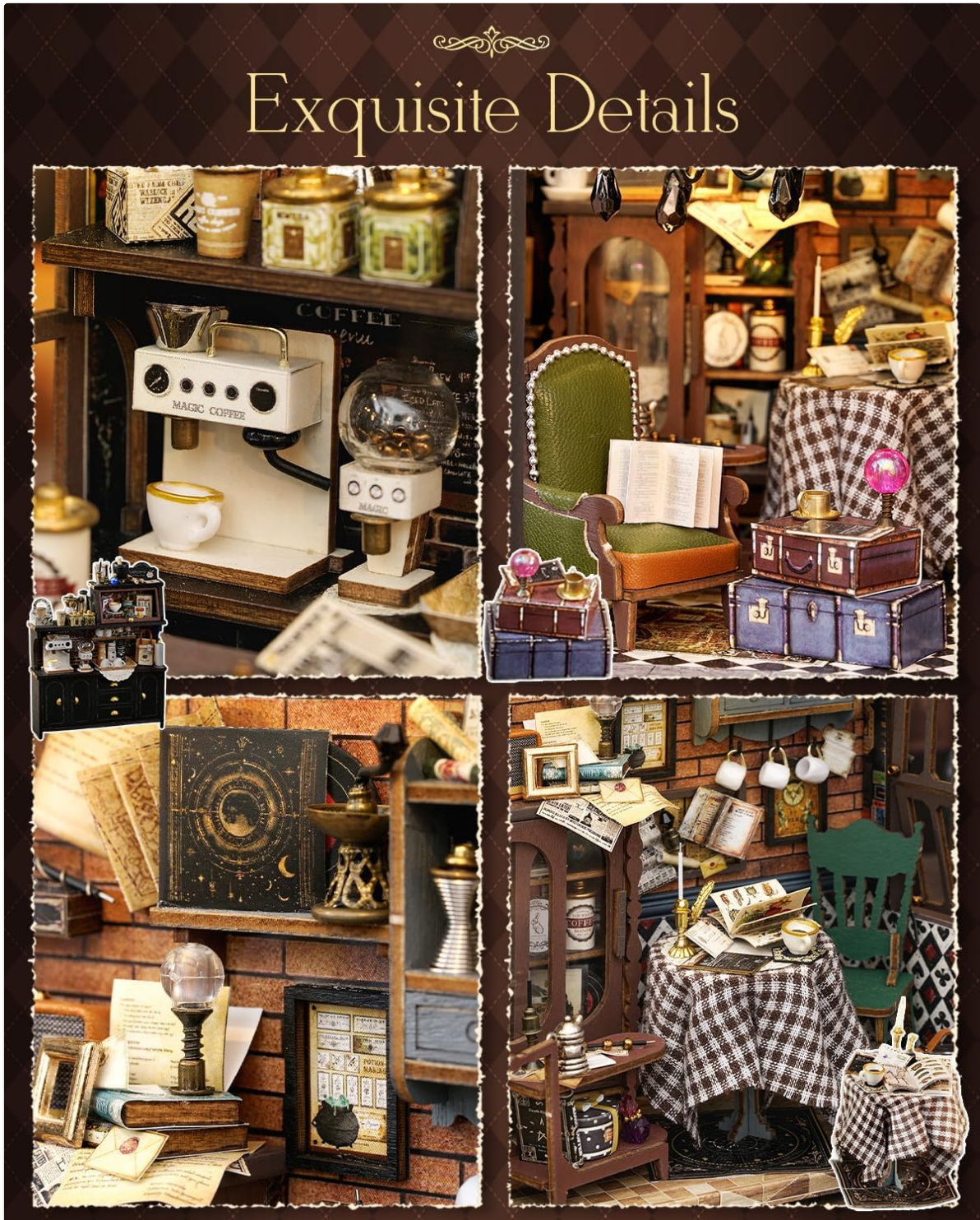
Image: A detailed view of the miniature coffee shop interior, showing the coffee machine, various cups, and tiny books on shelves.