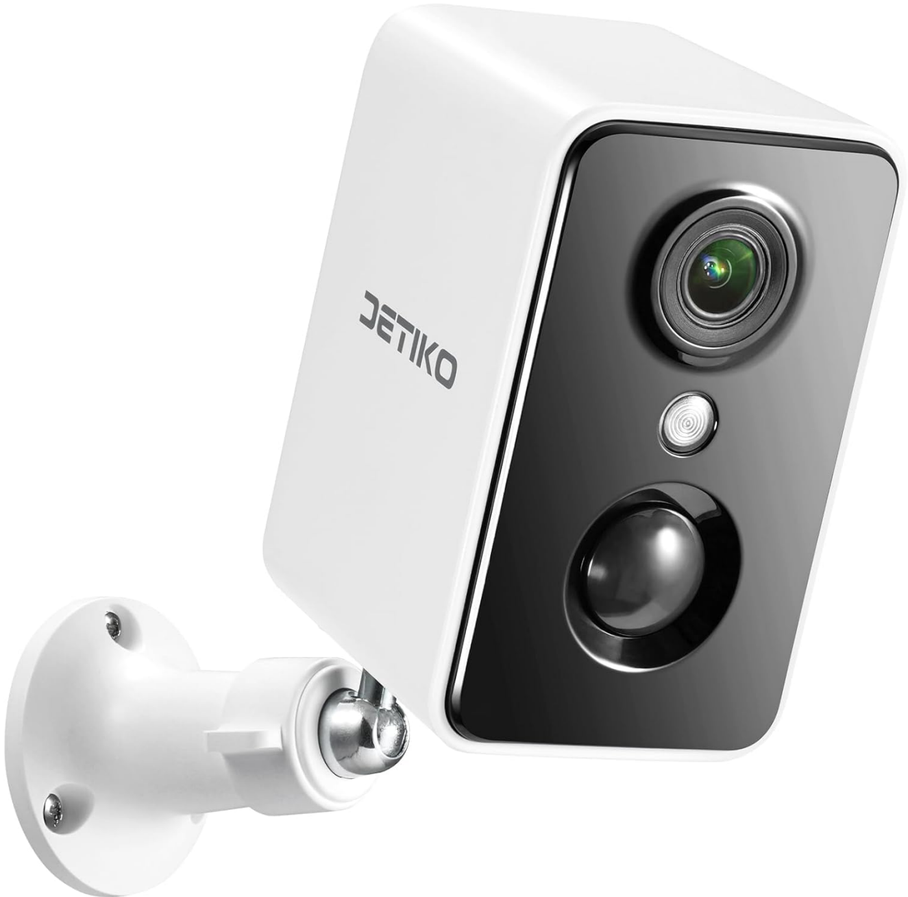
Image: Front view of the DETIKO KB01 Wireless Outdoor Security Camera.

The DETIKO KB01 is a versatile wireless security camera designed for both indoor and outdoor surveillance. It boasts a 2K resolution for clear imaging, color night vision, and a long-lasting 180-day battery. Its IP66 waterproof rating ensures durability in various weather conditions, while AI motion detection and two-way audio enhance its security capabilities.