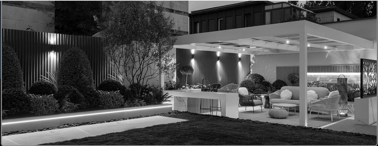
Image: Side-by-side comparison illustrating the clarity and detail of color night vision versus traditional black and white night vision.