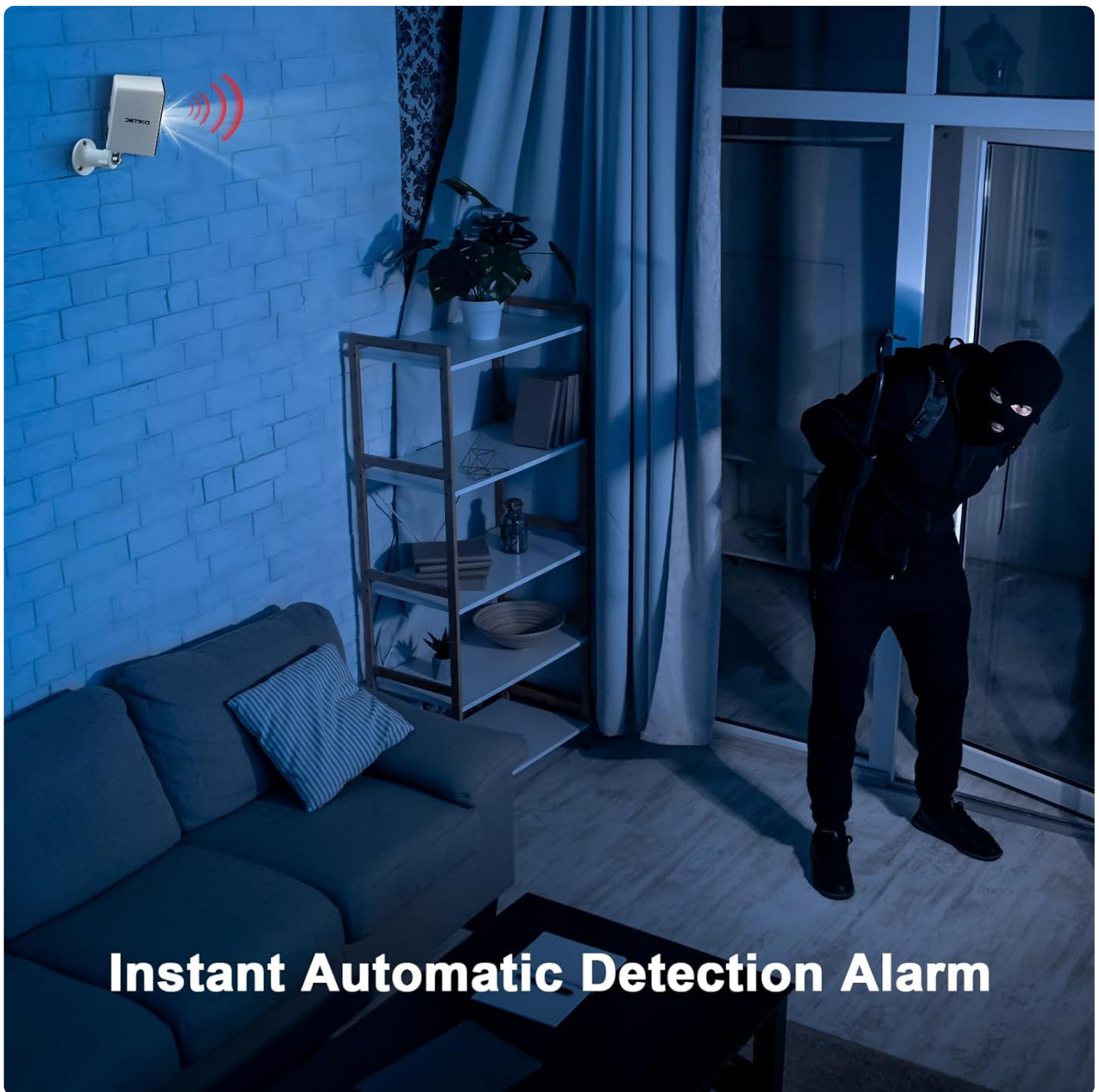
Image: The camera's automatic detection alarm feature is depicted, showing it can deter potential intruders.