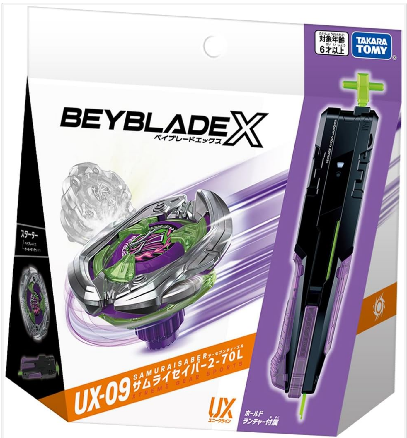
Figure 2.1: Packaging for the Beyblade X UX-09 Starter Samurai Saver 2-70L, showing the Beyblade, launcher, and accessories.