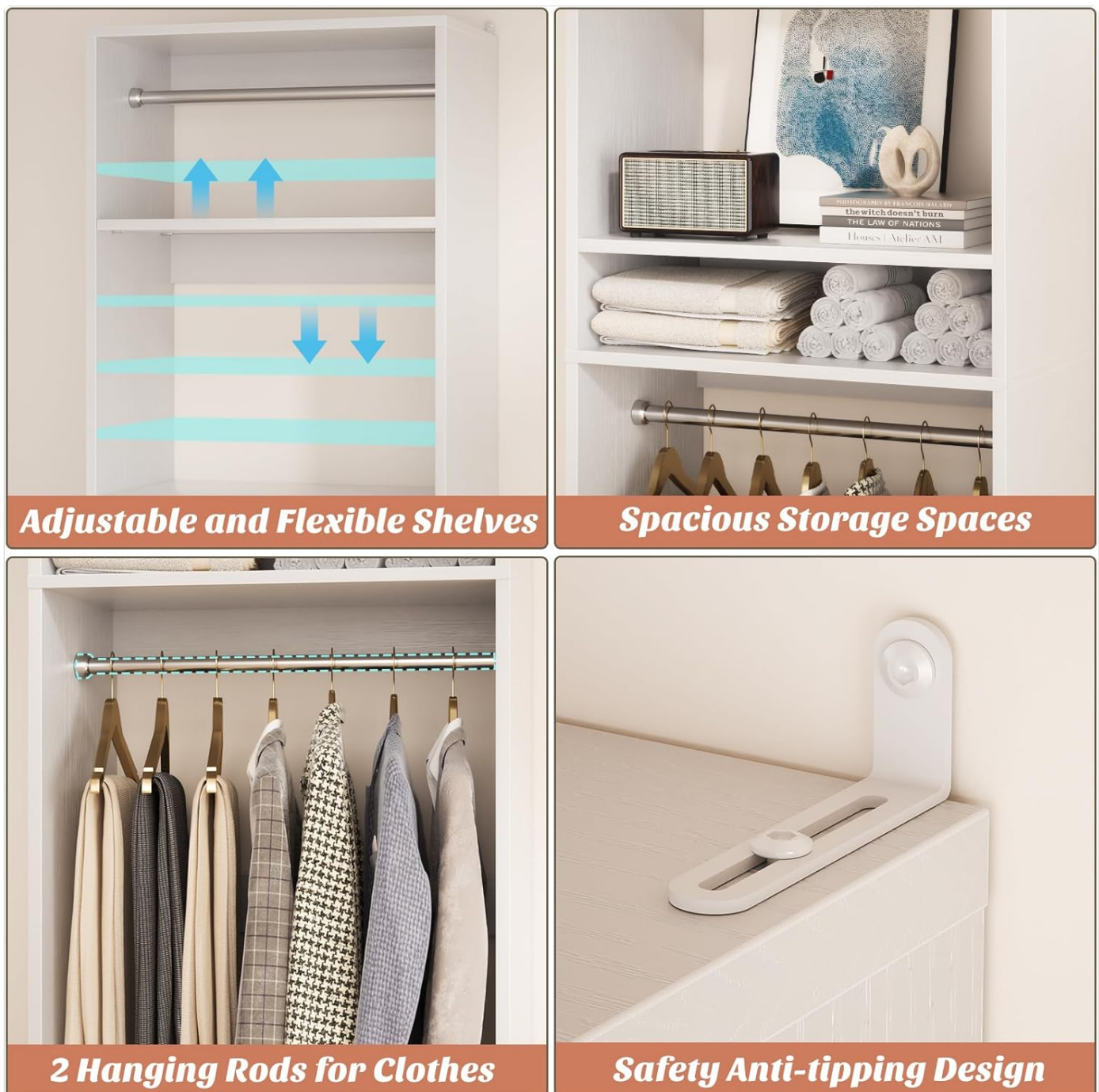
Adjustable and Flexible Shelves