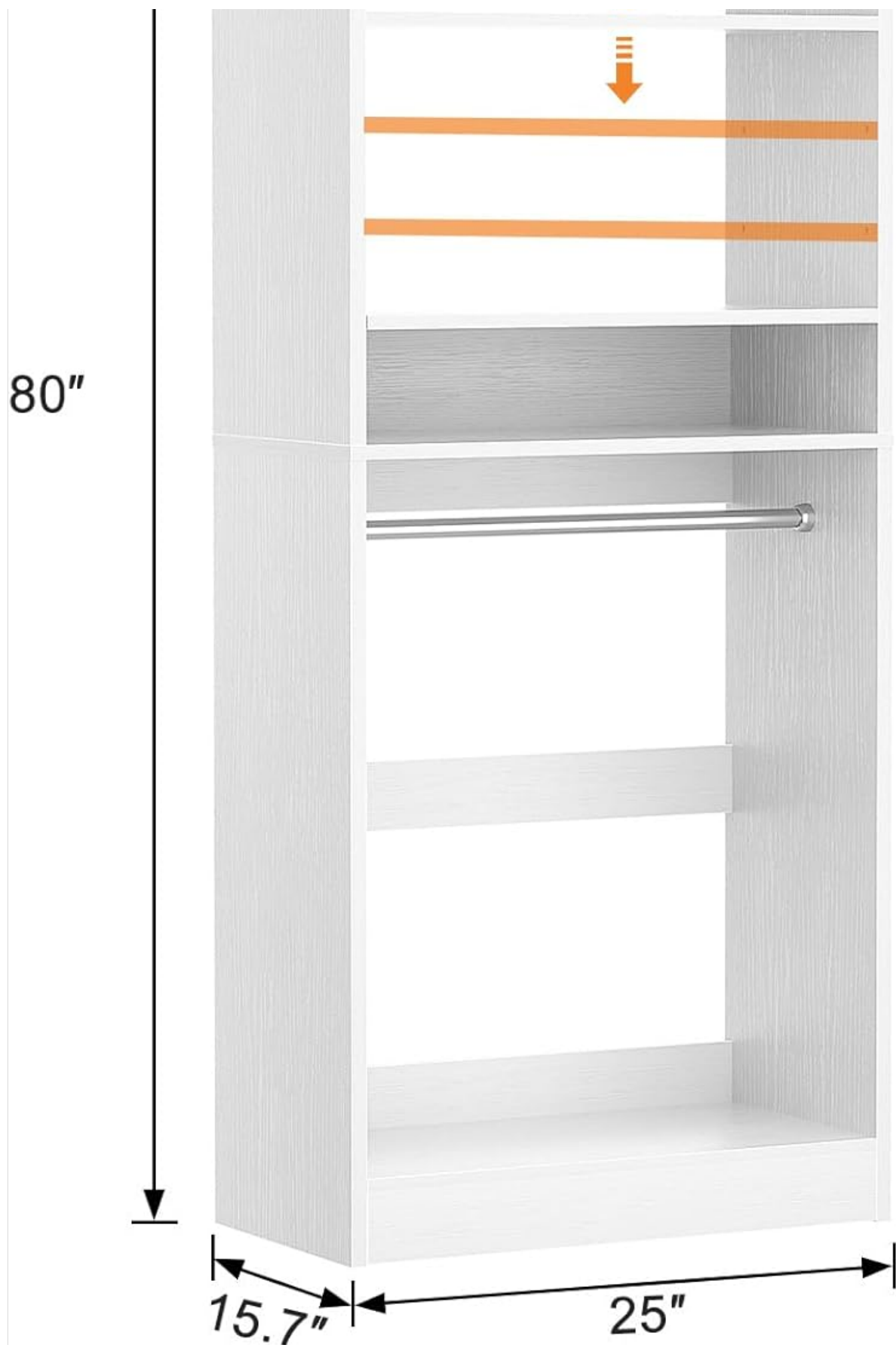
Figure 5: Key features including adjustable shelves, ample storage space, dual hanging rods, and the crucial anti-tipping safety design.