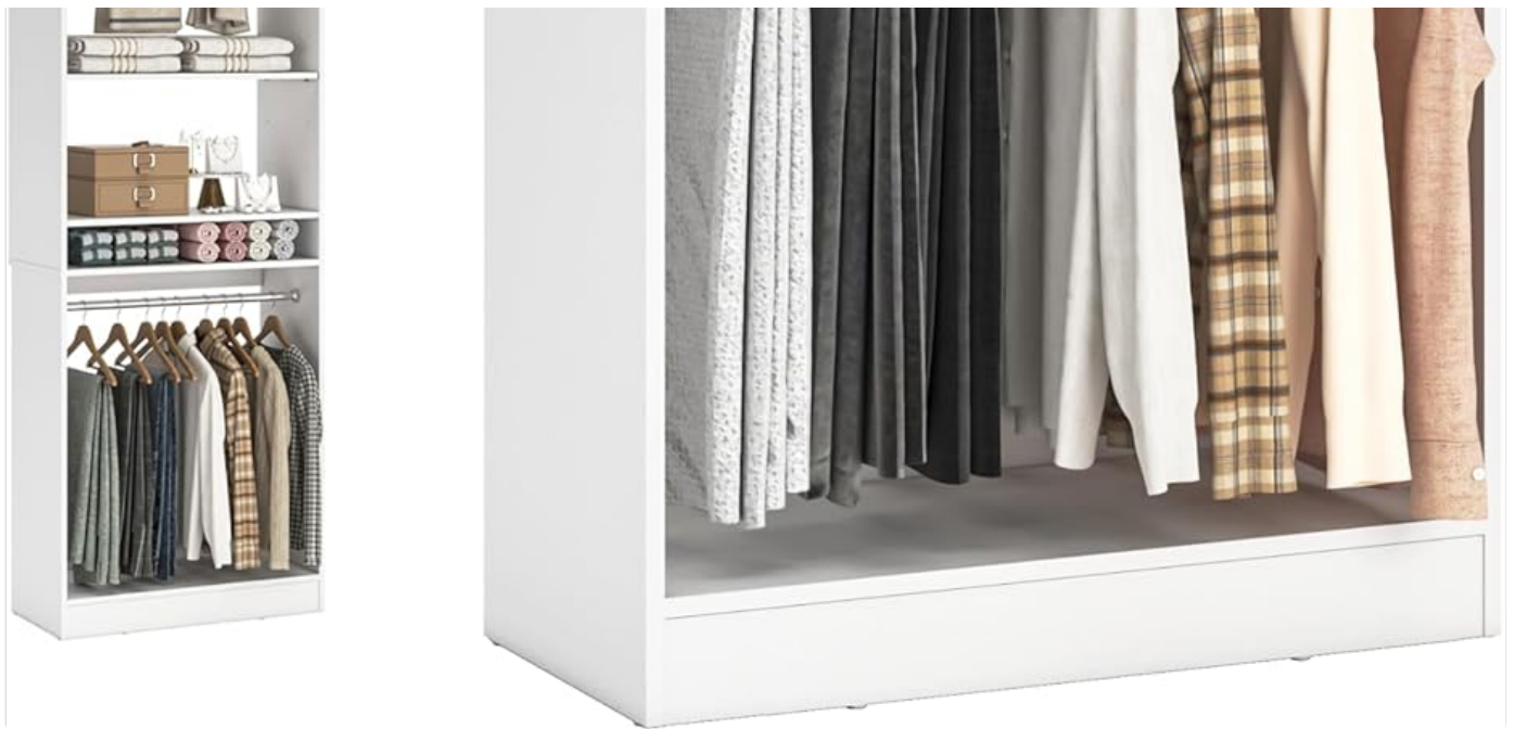
Figure 1: Fully assembled Unikito Freestanding Closet System, showcasing its storage capabilities.