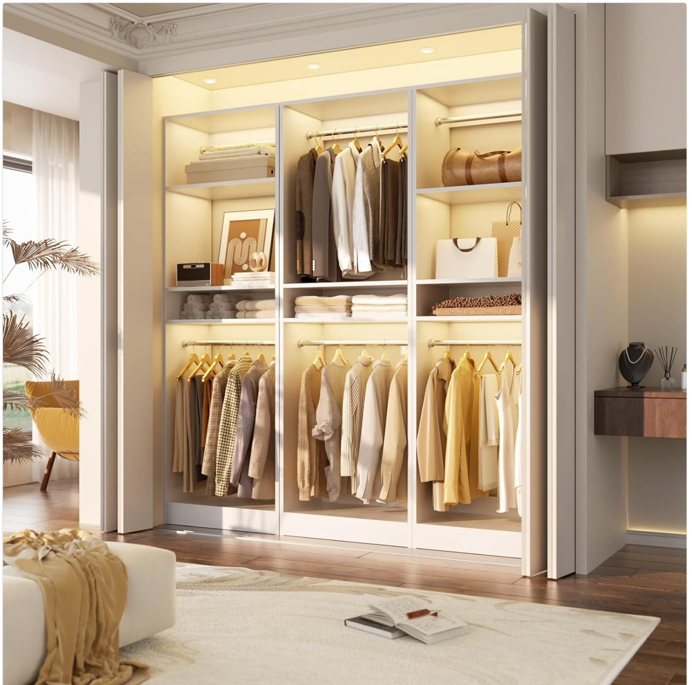
Figure 2: The closet system integrated into a room, demonstrating its freestanding design and storage for various items.