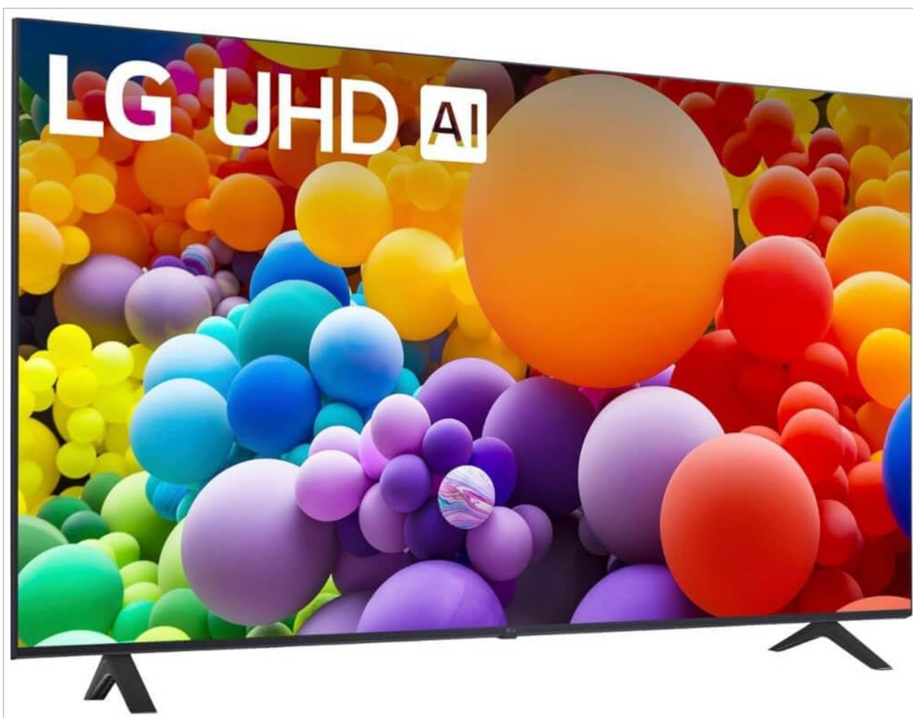
Angled front view of the LG UT70 Series 55-inch 4K UHD Smart TV, highlighting its slim profile.