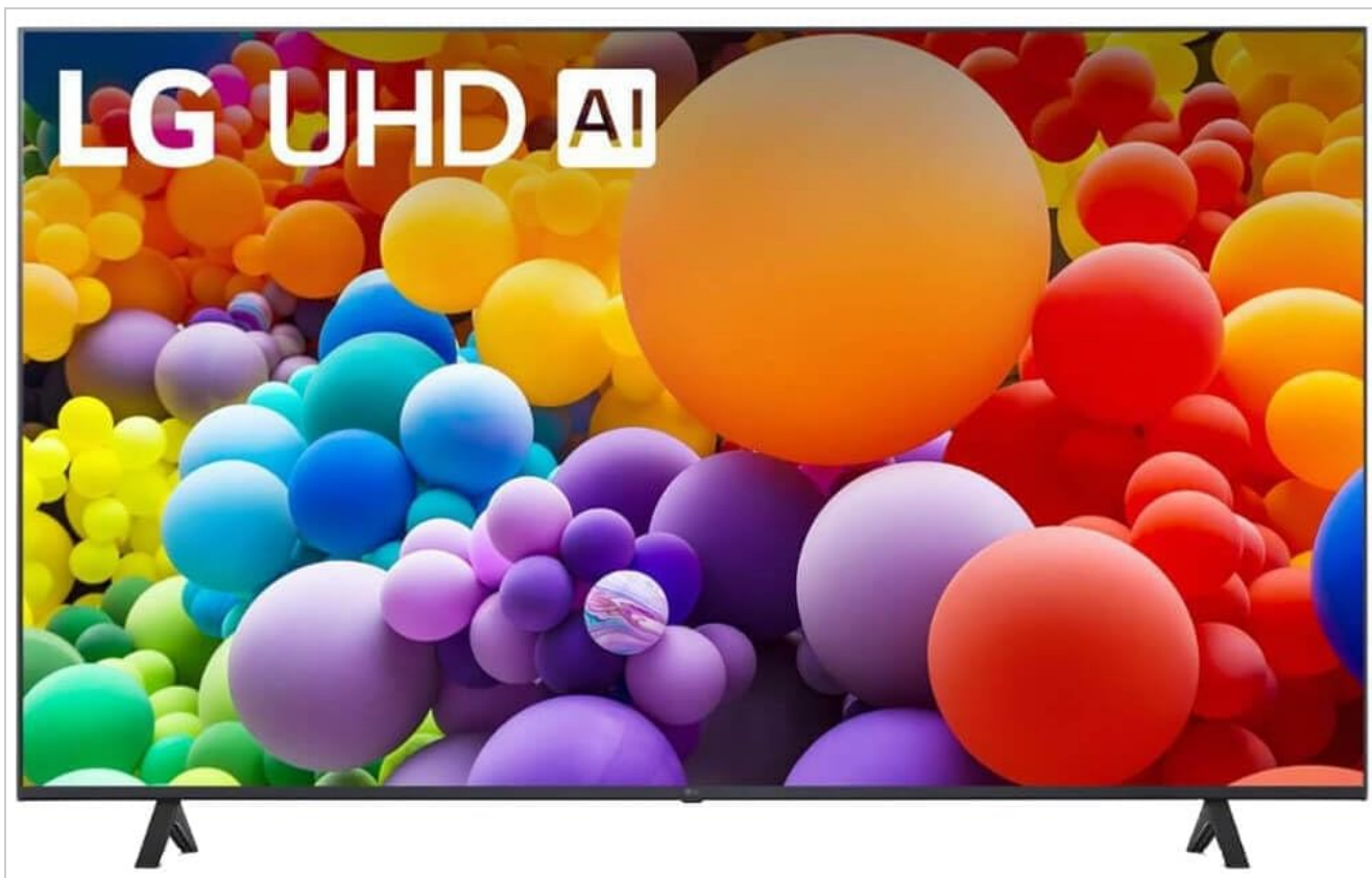
Front view of the LG UT70 Series 55-inch 4K UHD Smart TV, showcasing its display and bezel.