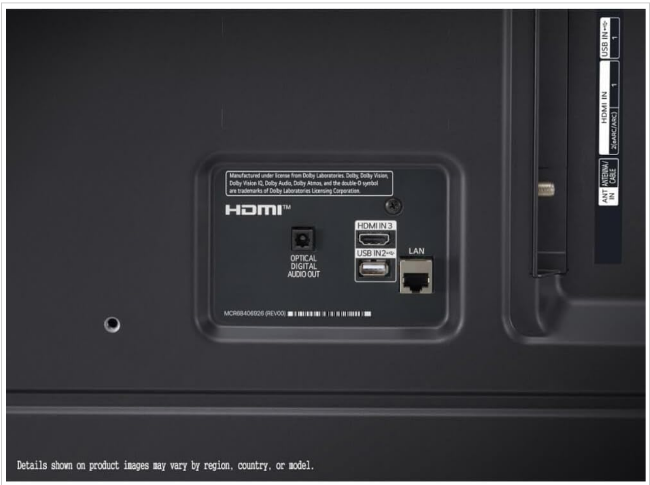
Close-up of the side input ports on the LG UT70 Series 55-inch 4K UHD Smart TV, including additional HDMI and USB connections.