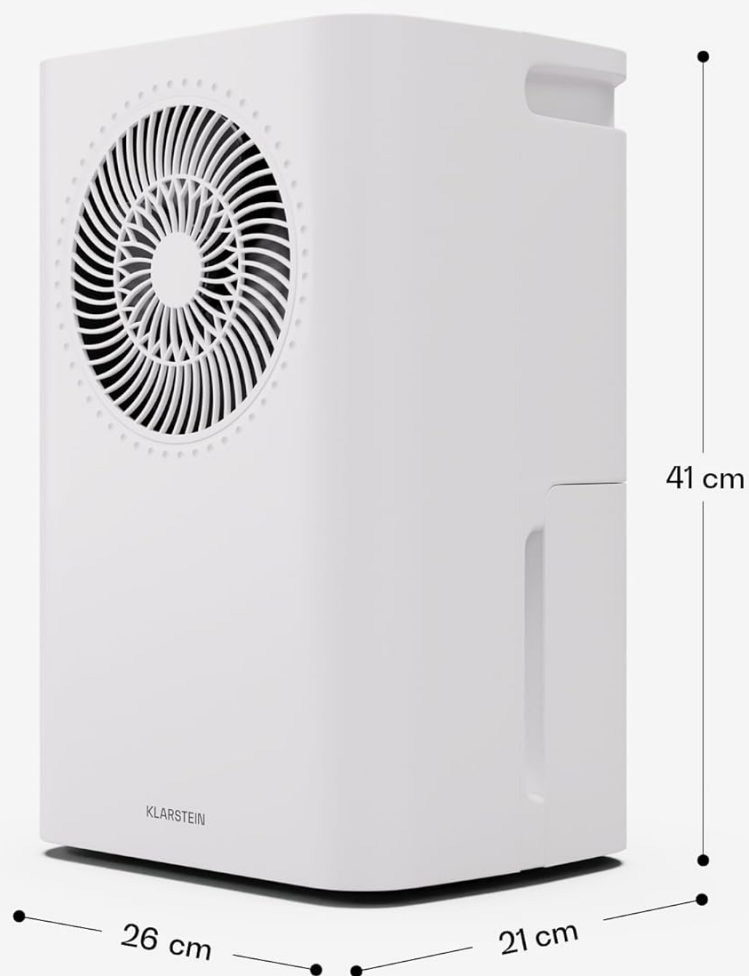
Figure 6: Dimensions of the Klarstein CircleDry 16L Smart Dehumidifier.