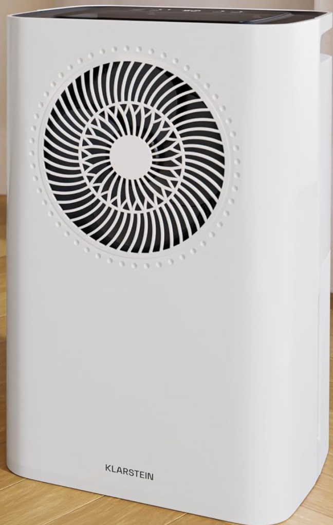
Figure 2: The dehumidifier showing its integrated handle, emphasizing its portability.

Grâce à la poignée intégrée et à son faible poids, le déshumidificateur est particulièrement flexible et facile à transporter