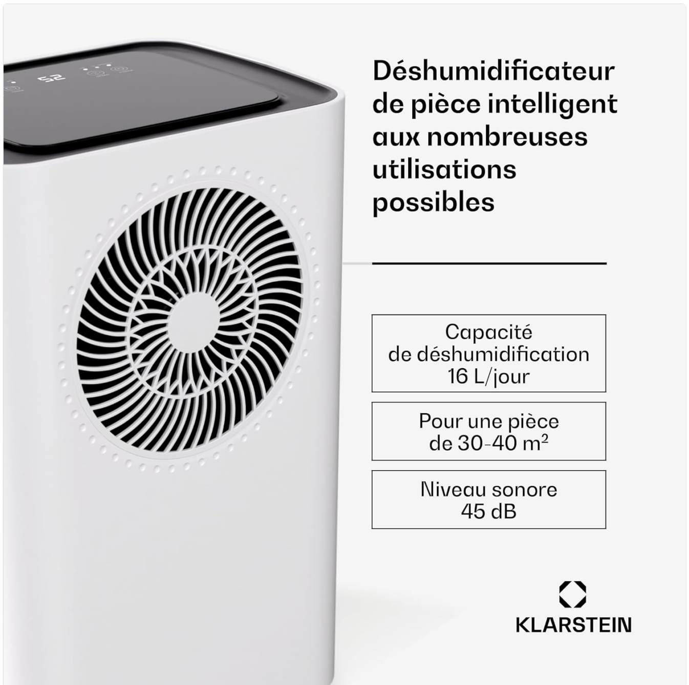
Figure 1: Front view of the Klarstein CircleDry 16L Smart Dehumidifier, highlighting its compact design.