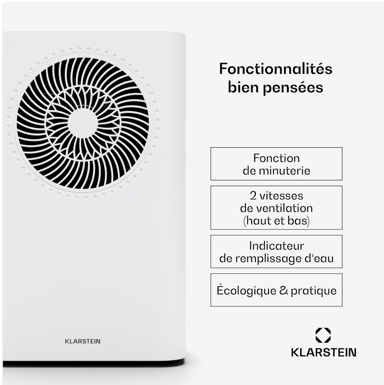
Figure 4: Close-up of the control panel, showing timer function, fan speed settings, and water full indicator.

The dehumidifier features an intuitive LED display and control buttons on the top panel.