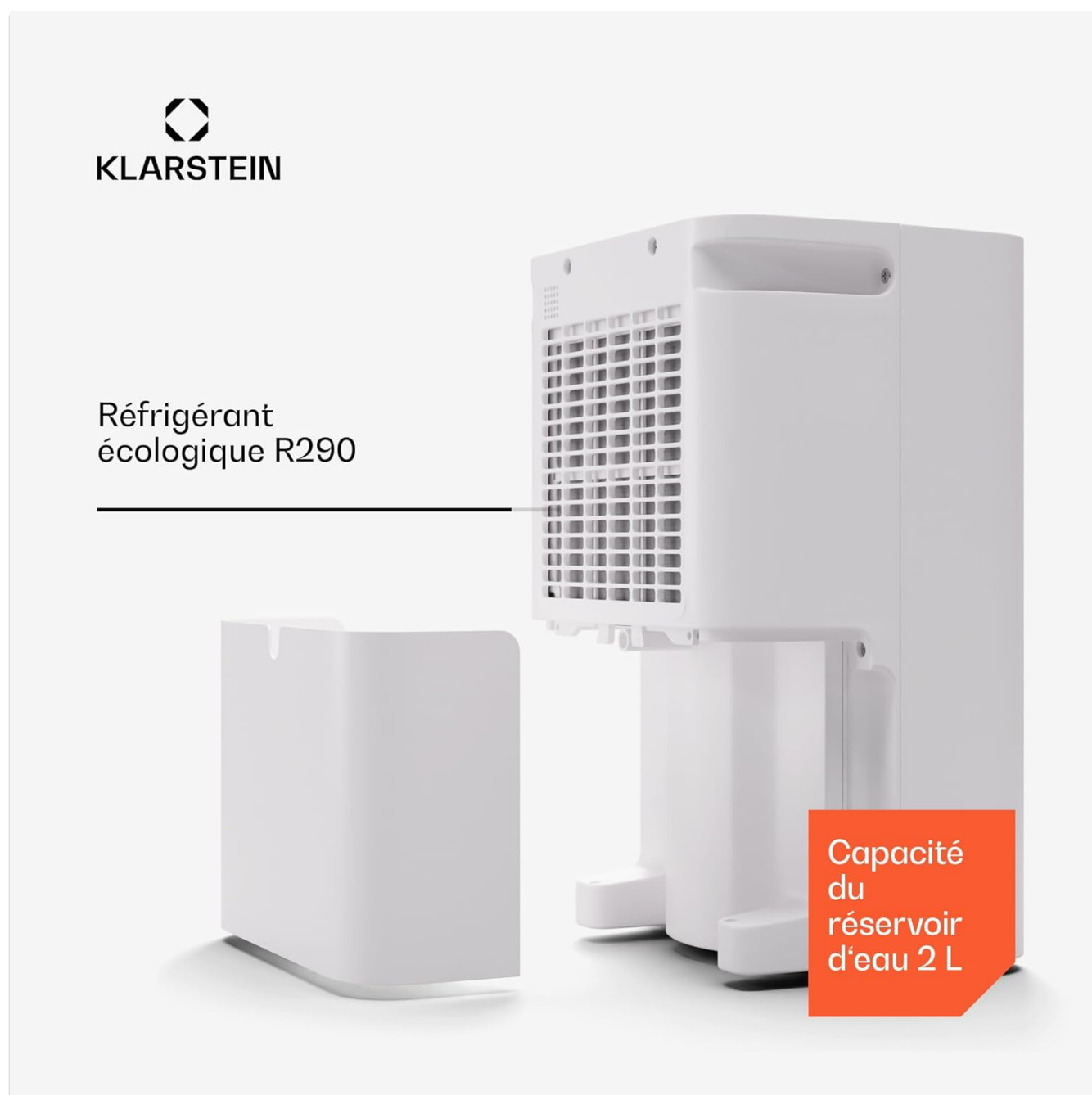
Figure 3: The dehumidifier with its 2-liter water tank removed, illustrating the drainage system.