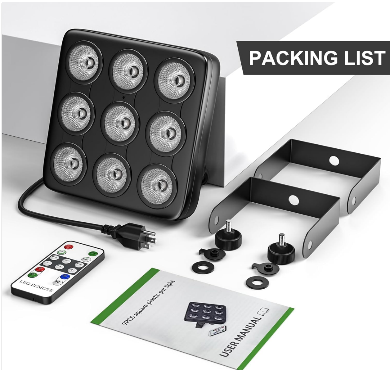
Image: Contents of the product package, including the stage light, remote control, power cord, mounting brackets, screws, and user manual.