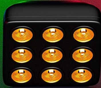
Image: Visual representation of the five available control modes for the stage light.