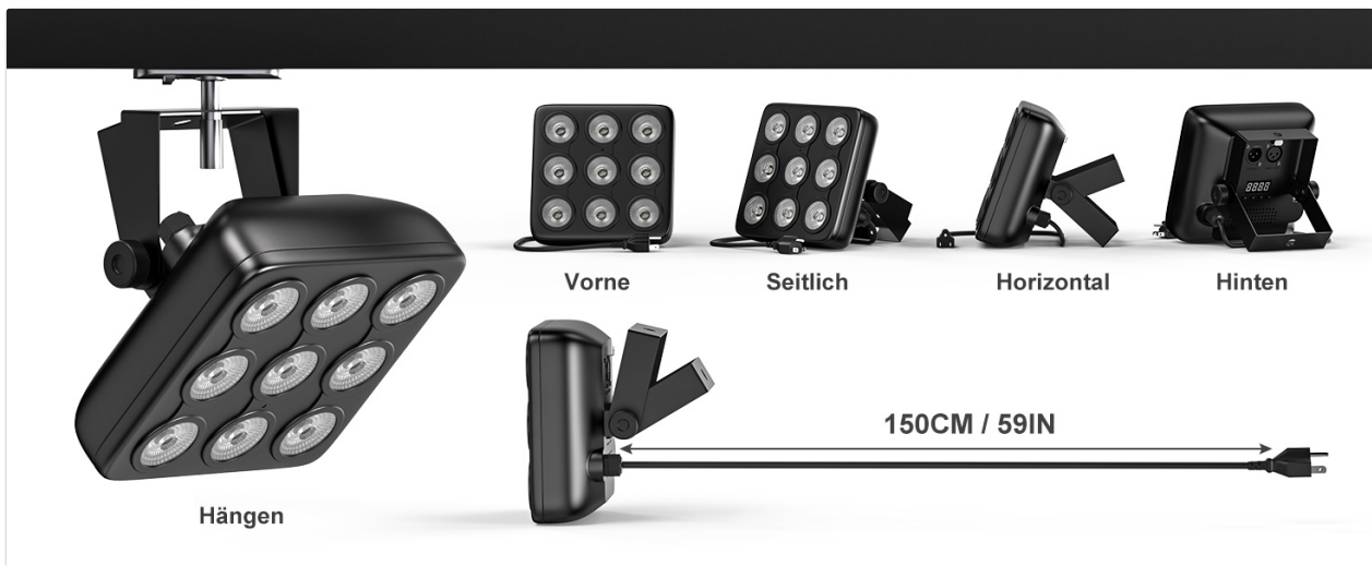
Image: Examples of mounting the stage light, including hanging from a truss, placing on a surface, and wall mounting.