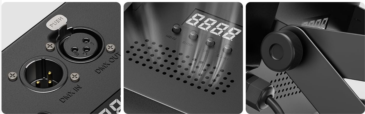
Image: Close-up of the rear panel, highlighting the DMX IN and DMX OUT ports, the digital display, and ventilation.