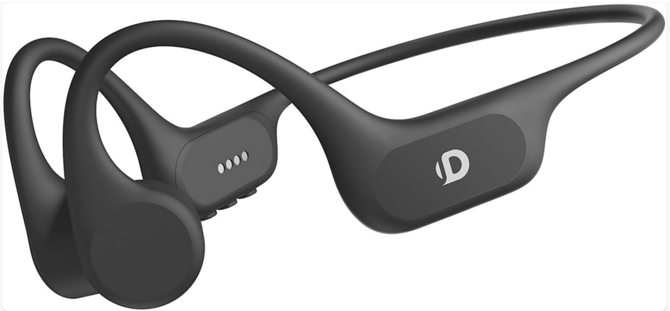
Image 3.1: Front view of the DEMICEA LibreRun Pro X13 Open Ear Sport Headphones, showcasing the black, flexible frame and ear hooks.