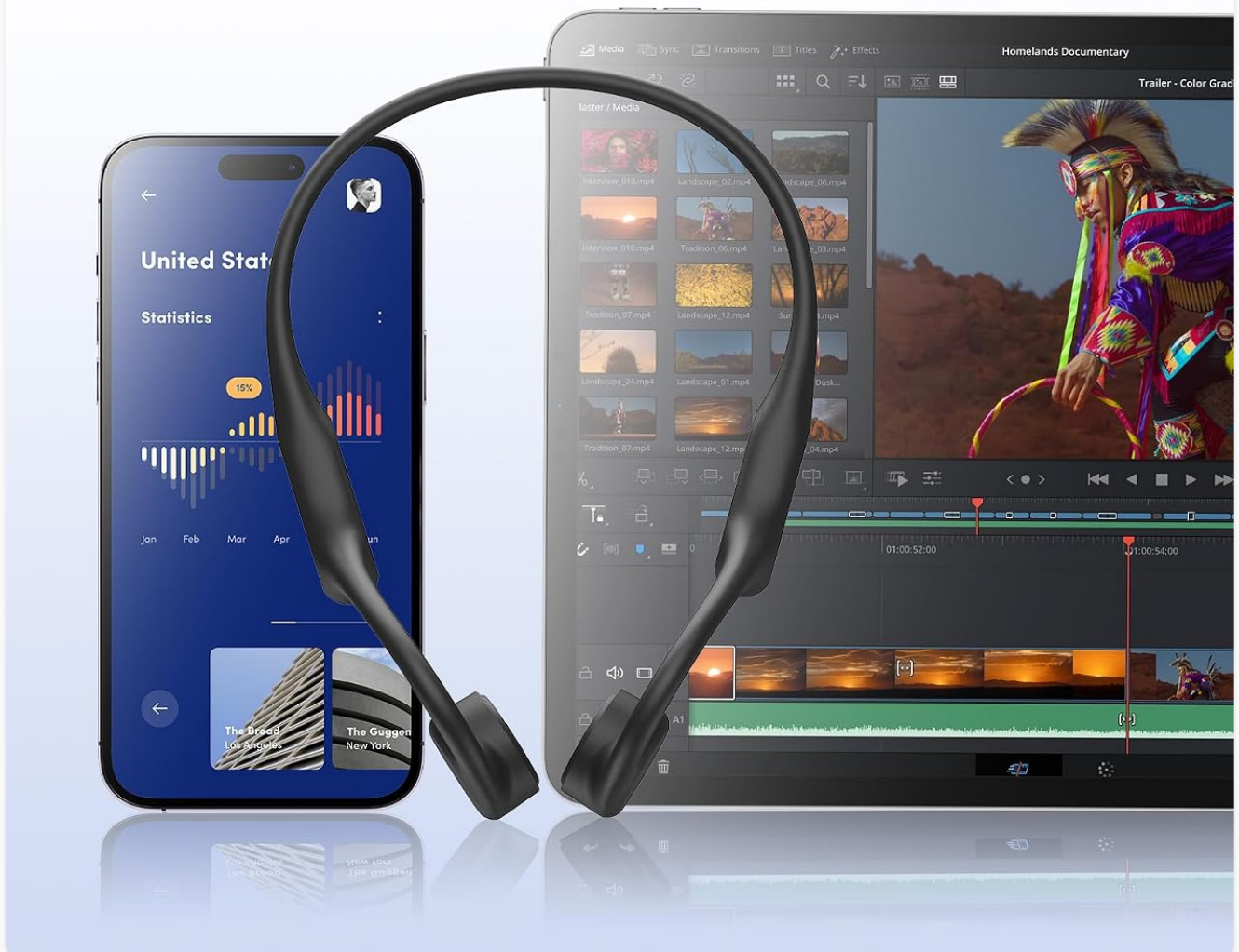
Image 5.1: Visual representation of the multipoint connection feature, showing the headphones seamlessly connected to both a smartphone and a tablet.

Automatic Switching. If you're playing music on your PC and take a call on your phone, X13 will automatically switch over.