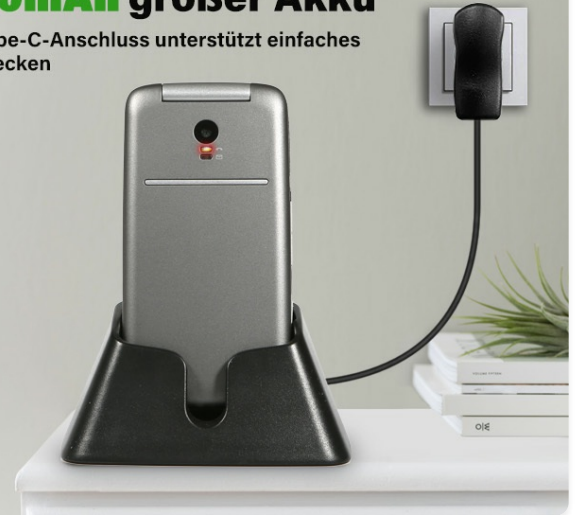
Image: The artfone G3 can be charged directly via a USB-C cable or by placing it in the included charging station.

USB Type-C-Anschluss unterstützt einfaches Blindstecken