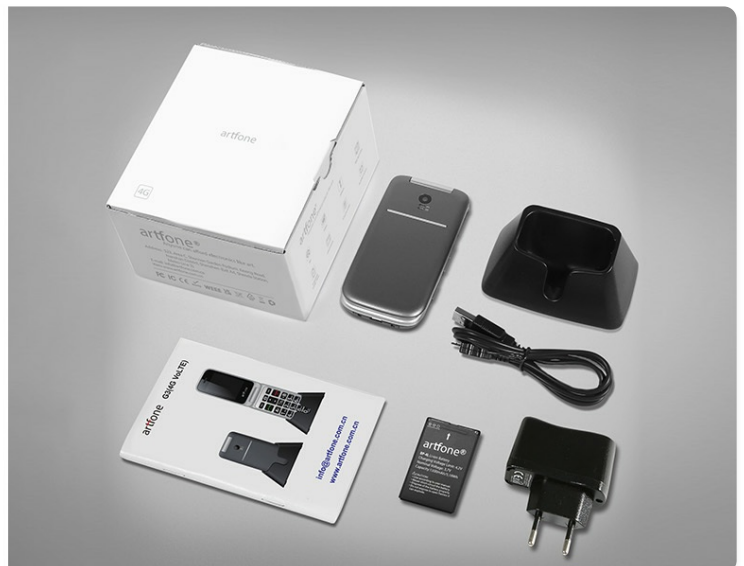
Image: The artfone G3 retail box alongside the phone, charging dock, and accessories.