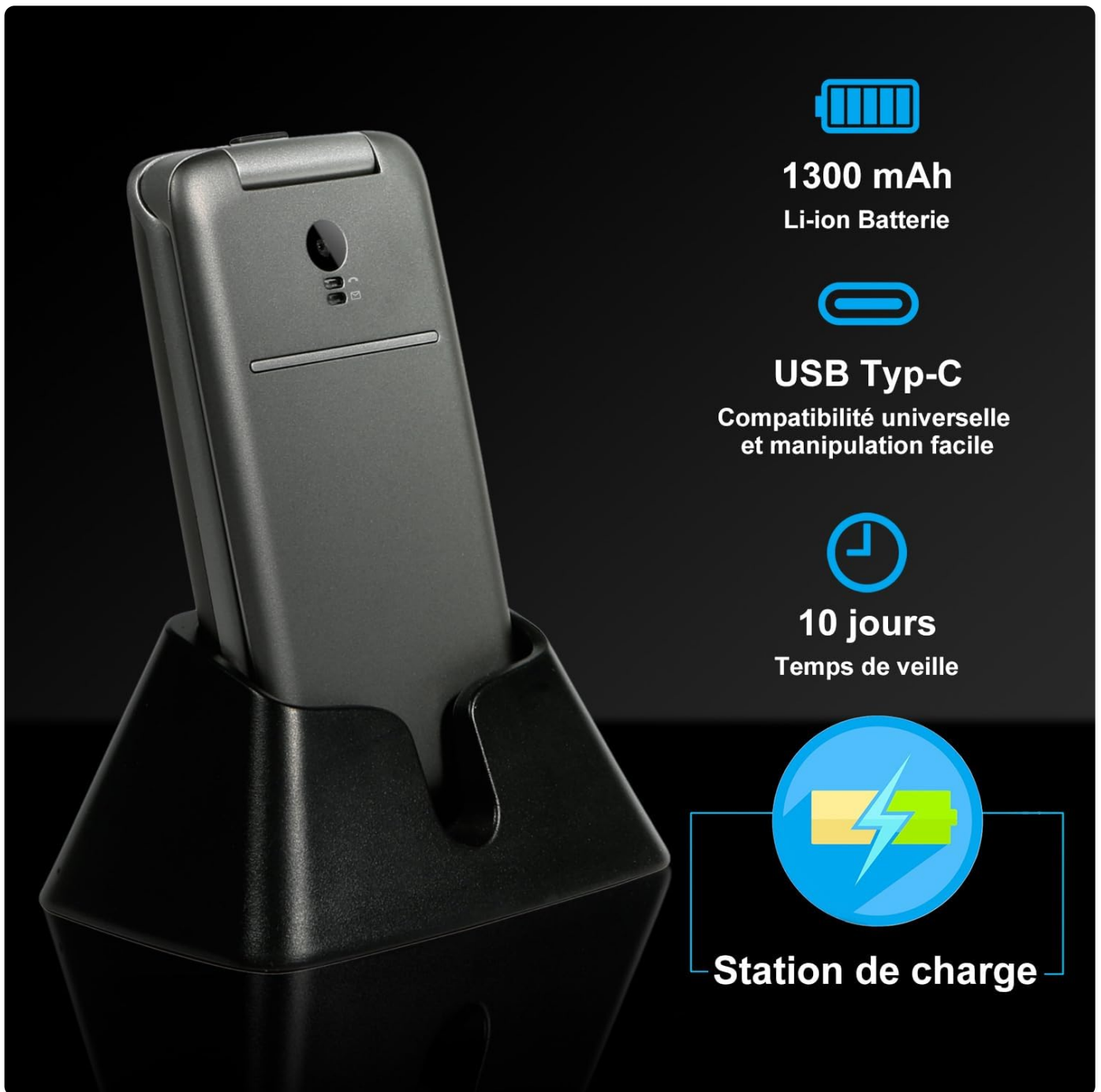
Image: The artfone G3 phone resting in its charging dock, illustrating the 1300mAh battery capacity and convenient USB-C charging.