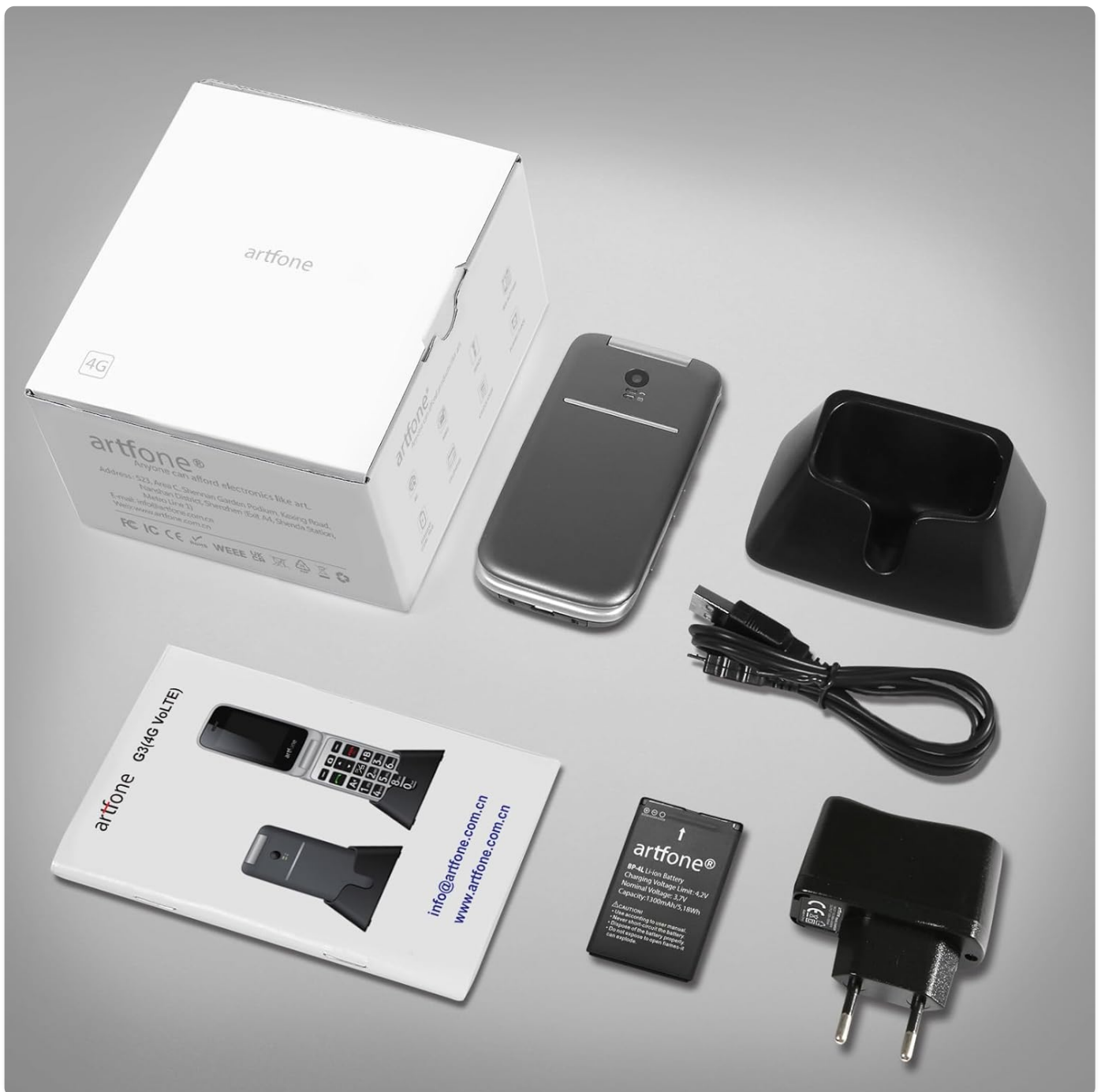
Image: All items included in the artfone G3 package, neatly arranged on a surface.