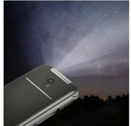
Image: A visual representation of the artfone G3's additional features, including Calendar, Bluetooth, MP3/FM radio, Calculator, Alarm, Bright Screen, Loud Ringtone, and Flashlight.