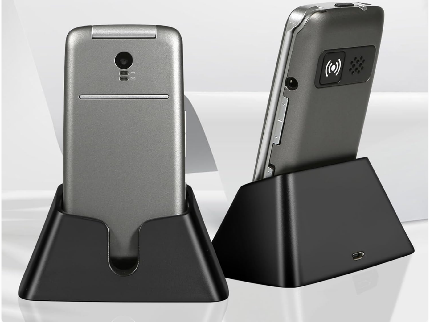
Image: The artfone G3 in its charging dock, accompanied by technical specifications for its dimensions (102 x 50 x 18 mm) and weight (88g).