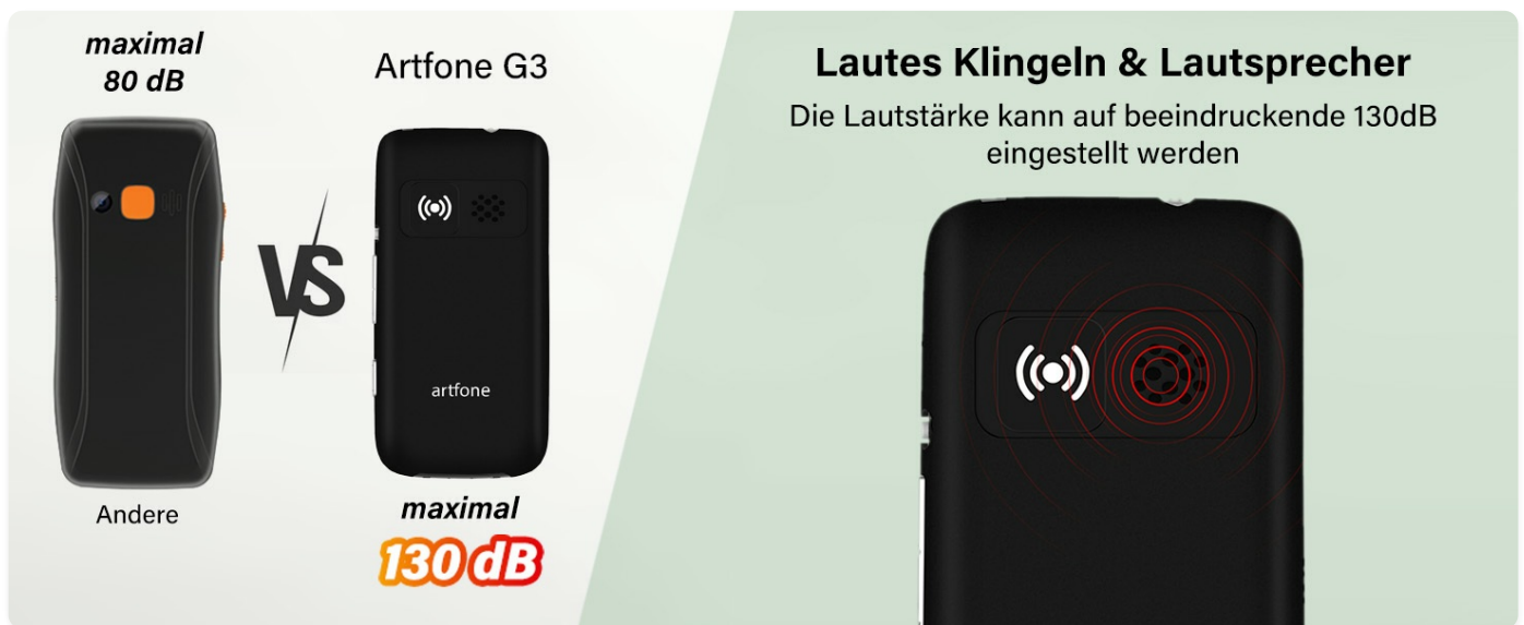
Image: A visual comparison highlighting the artfone G3's maximum volume of 130dB against another phone's 80dB, emphasizing its loud audio output.