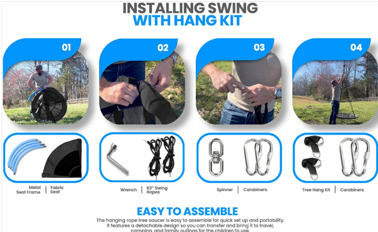
Figure 3: Visual representation of the installation process, highlighting the components of the hang kit and how they connect to the swing and anchor point.

Video 1: A comprehensive video demonstrating the assembly process of the 40-inch Saucer Tree Swing, including connecting the frame pieces, attaching the ropes, and securing the swing to a tree branch.