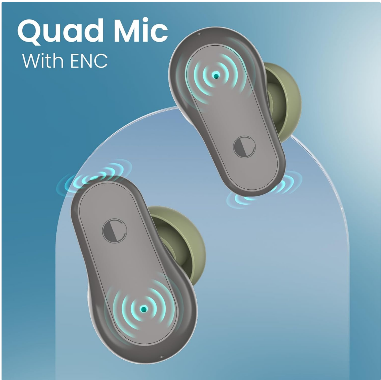
Figure 5: Quad Mic setup with ENC for enhanced call clarity.