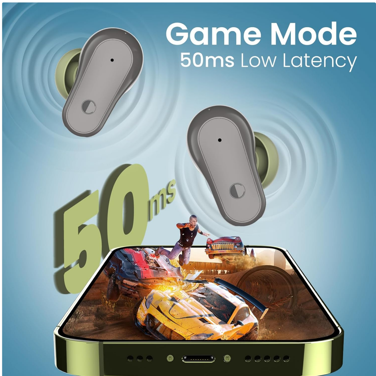
Figure 6: Game Mode with 50ms low latency for an optimized gaming experience.