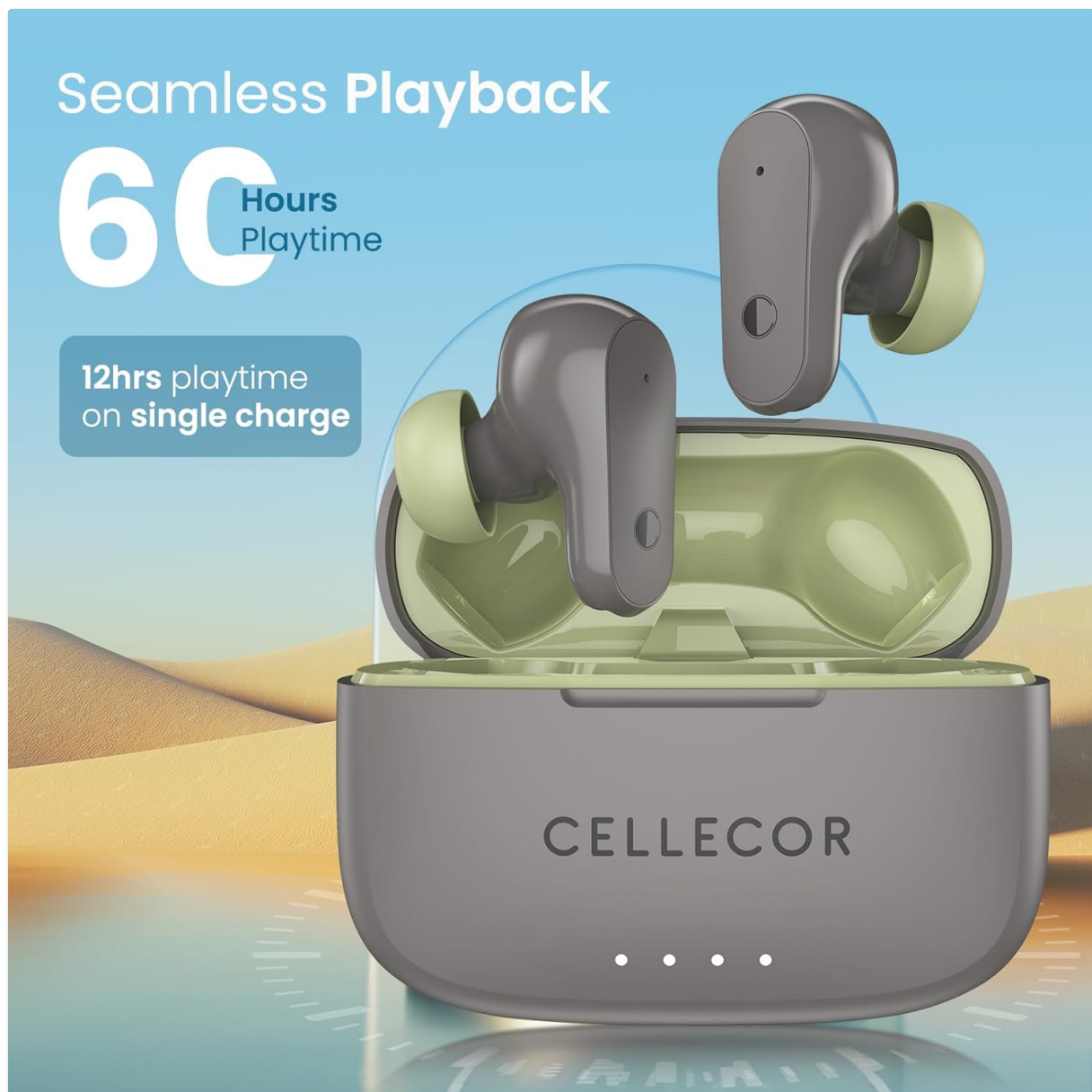
Figure 8: Seamless playback with 60 hours total playtime, including 12 hours on a single charge.