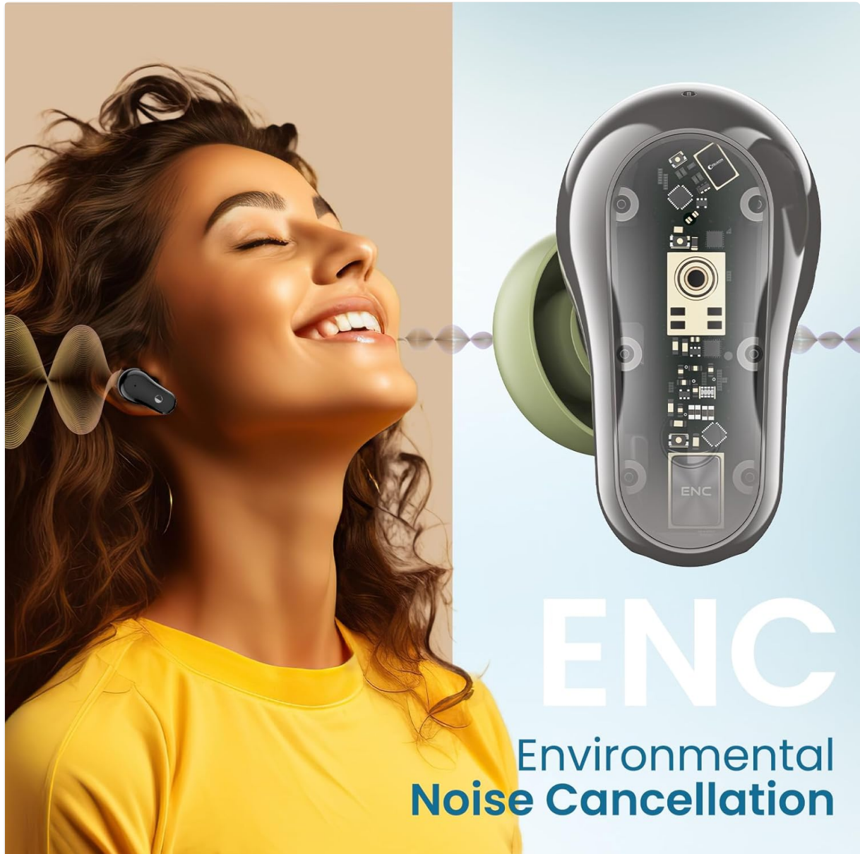
Figure 4: Environmental Noise Cancellation (ENC) for clear calls.