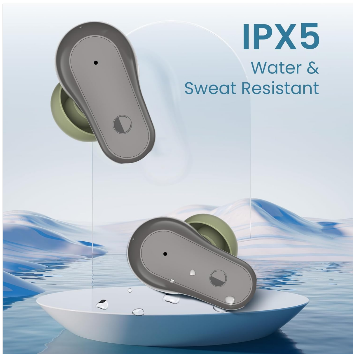
Figure 9: IPX5 rating indicates resistance to water splashes and sweat.