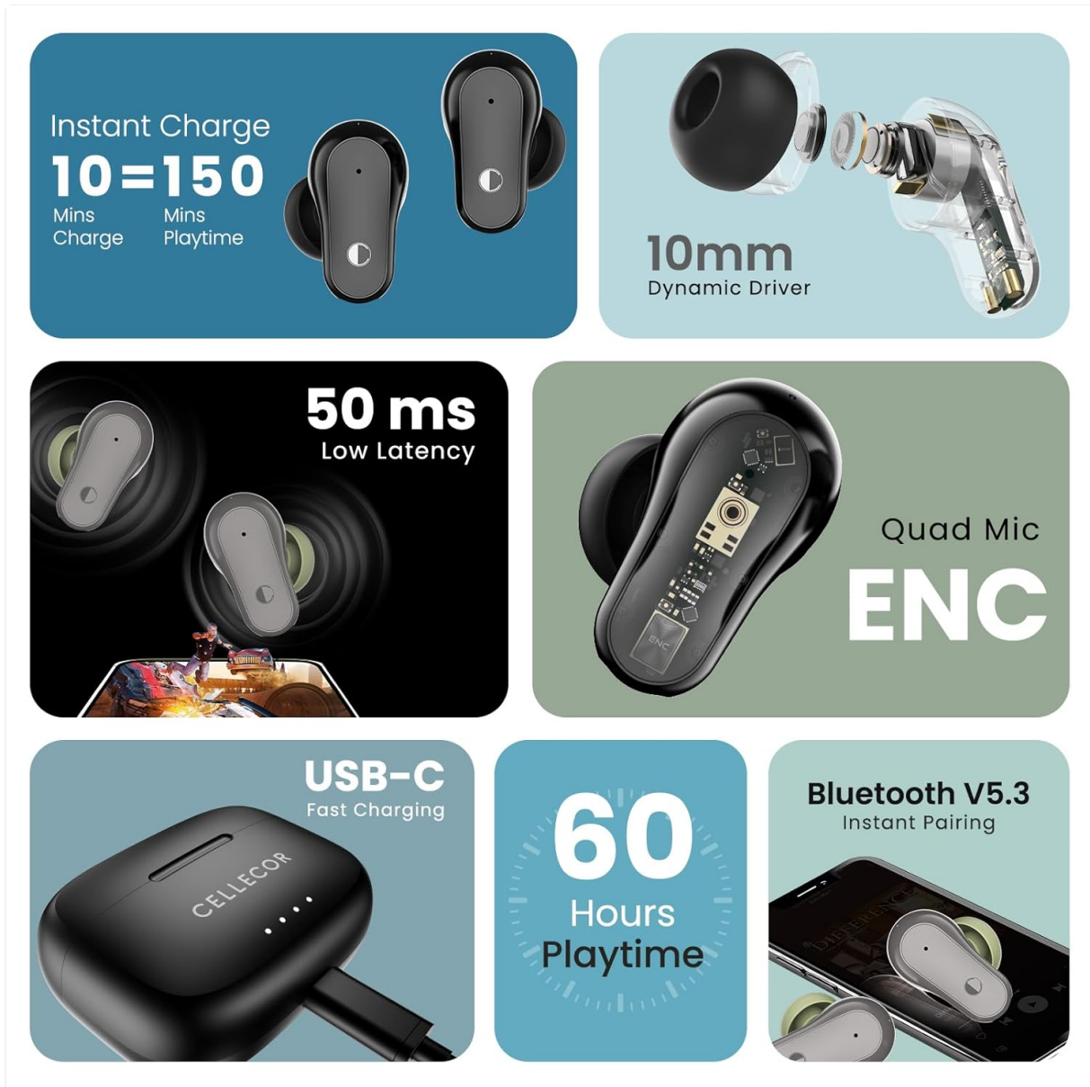
Figure 2: Charging the CELLECOR BROPODS C109 case via Type-C.