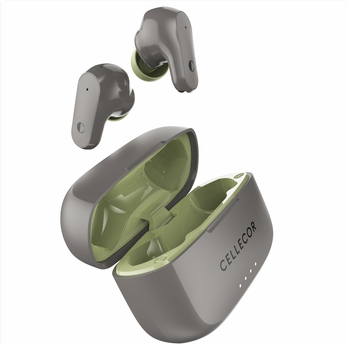
Figure 1: CELLECOR BROPODS C109 TWS Earbuds and Charging Case.