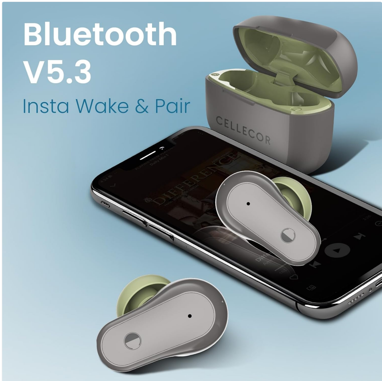
Figure 3: Bluetooth V5.3 Insta Wake & Pair functionality.