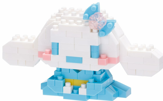
Image: The completed nanoblock Cinnamoroll (Kimono) figure, approximately 1.97 inches tall.

This manual provides detailed instructions for assembling your nanoblock Sanrio Cinnamoroll (Kimono) Character Collection Series Building Kit. Please read through all sections carefully before beginning assembly to ensure a smooth and enjoyable building experience. This kit allows you to construct a miniature Cinnamoroll character in a kimono design using micro-sized building blocks.