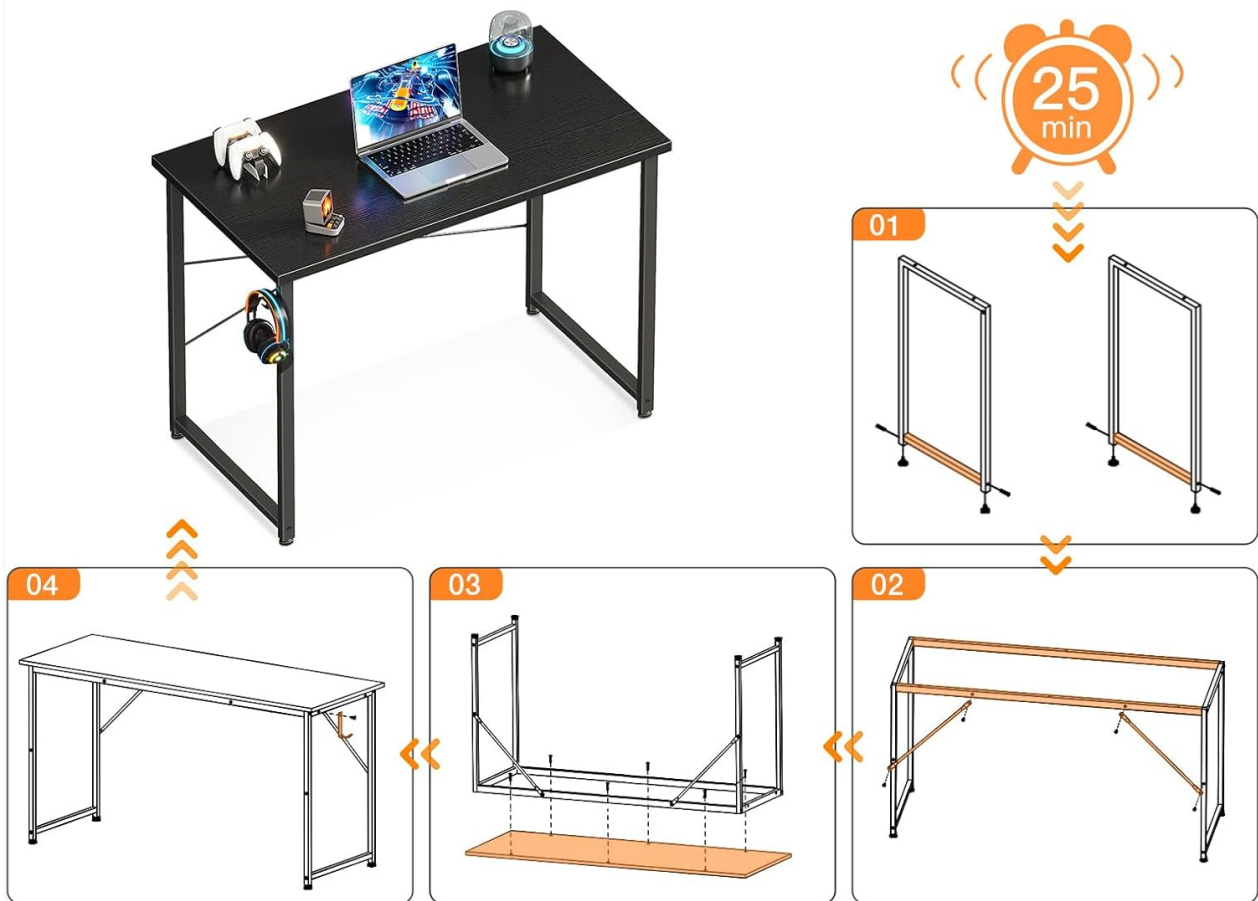
Image: Visual guide for quick and easy assembly of the desk.