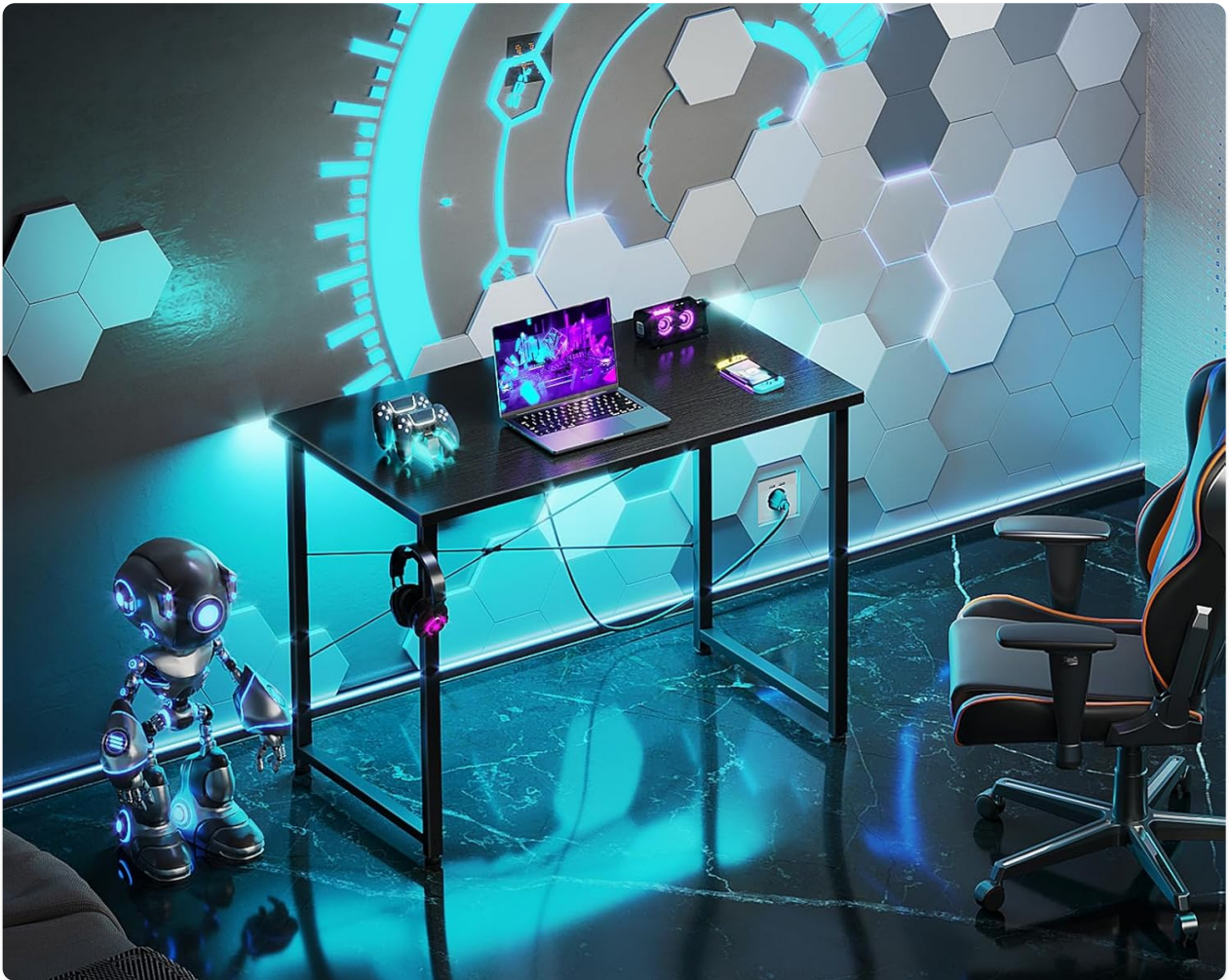
Image: The desk integrated into a modern gaming or work setup.