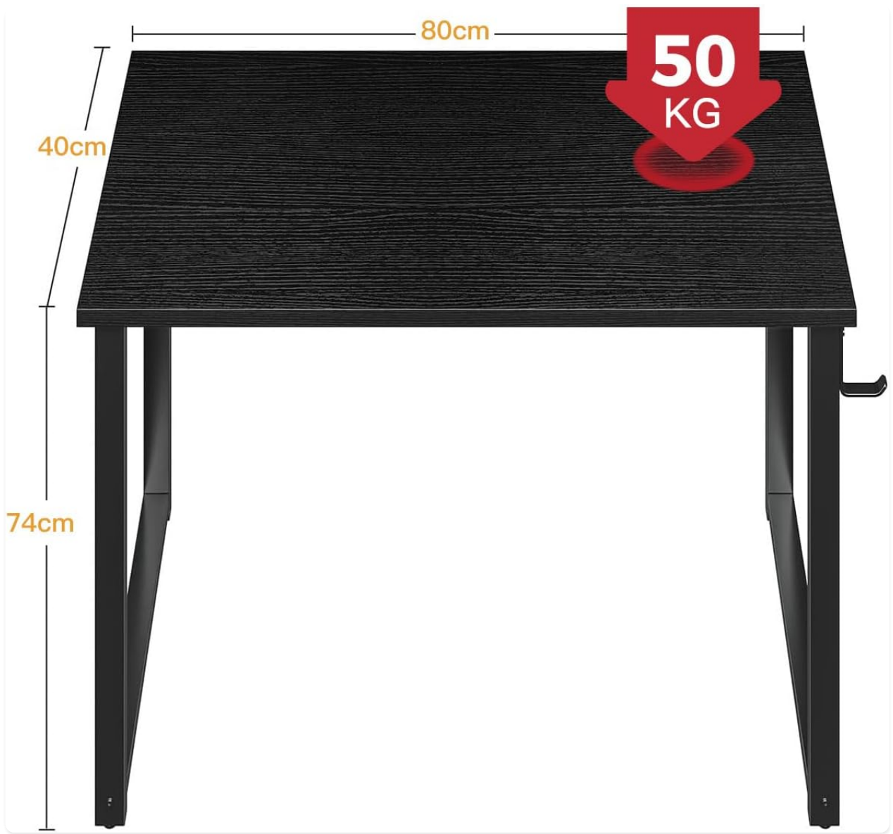
Image: Desk dimensions and maximum weight capacity of 50 KG.