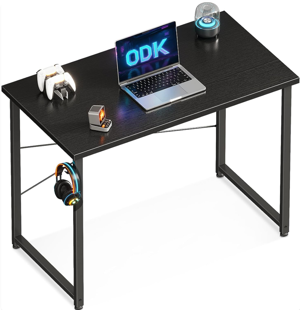
Image: The ODK 80x40cm Small Computer Desk, showcasing its compact design and integrated headphone hook.