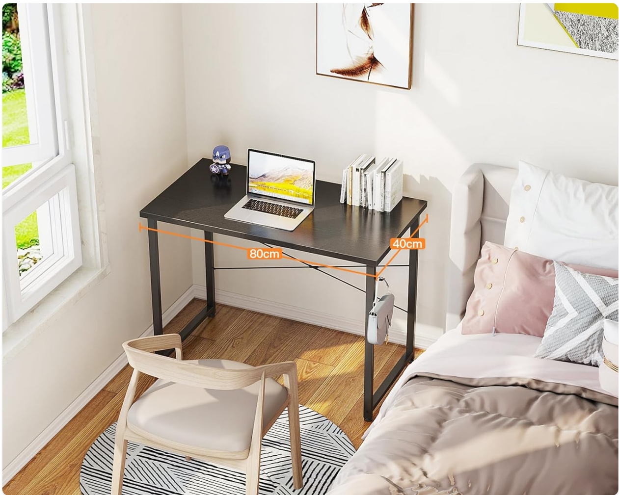
Image: The desk fitting perfectly in a bedroom, highlighting its suitability for small spaces.