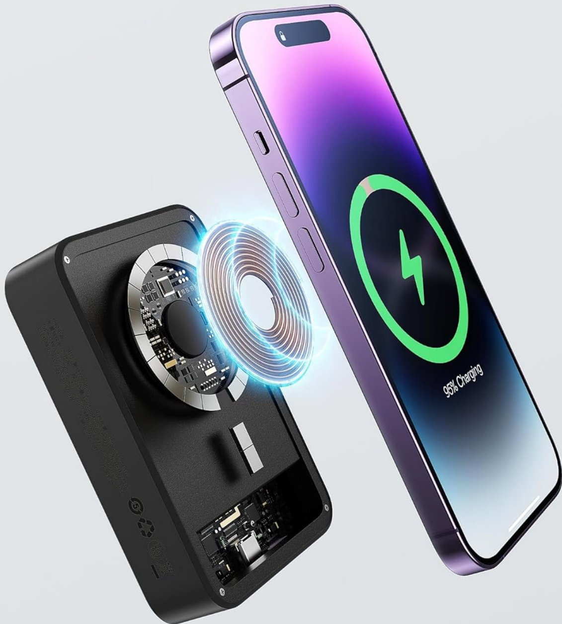
Figure 2: Strong Magnetic Connection. An exploded view illustrating the internal magnetic components of the power bank and how it securely attaches to an iPhone for wireless charging.

Secure and tight attachment to your phone.