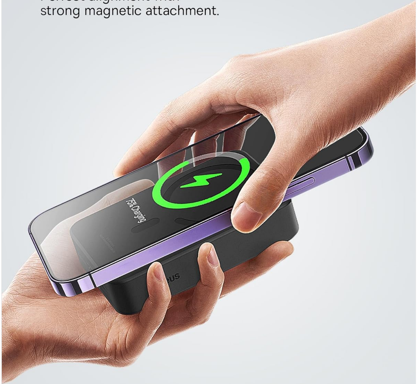
Figure 3: Just Snap on and Get Charged! A hand holding an iPhone with the power bank magnetically attached to its back, demonstrating the ease of use for wireless charging.

Perfect alignment with strong magnetic attachment.