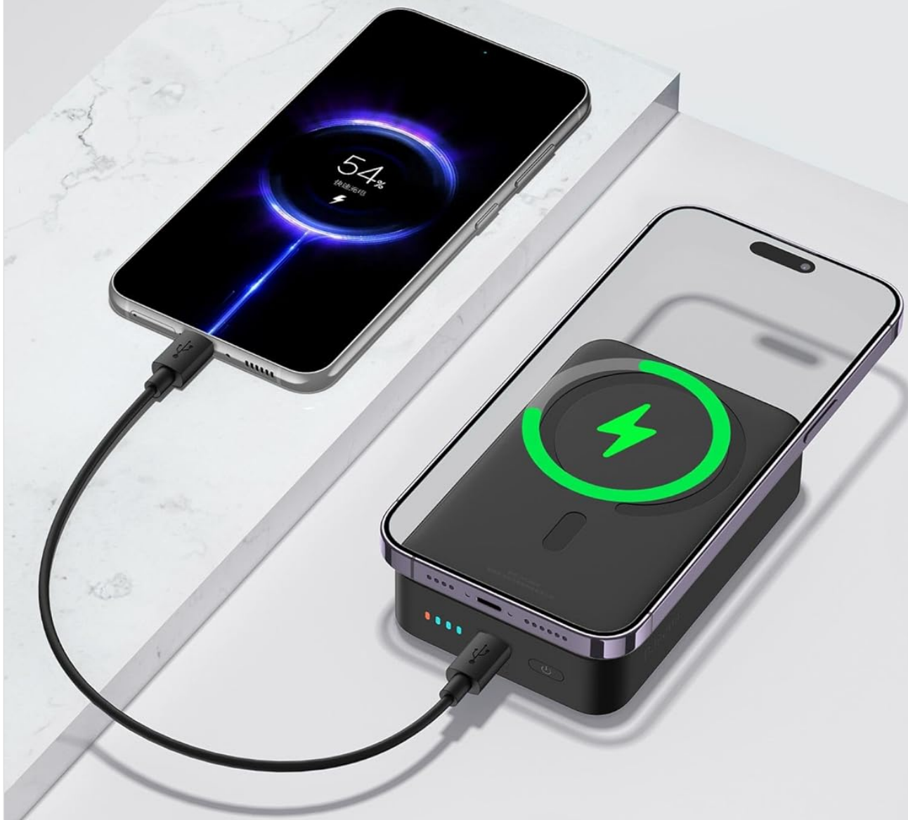
Figure 5: Charge 2 at a Time. This image shows two iPhones being charged simultaneously: one wirelessly attached to the power bank, and another connected via a USB-C cable, illustrating the dual charging capability.