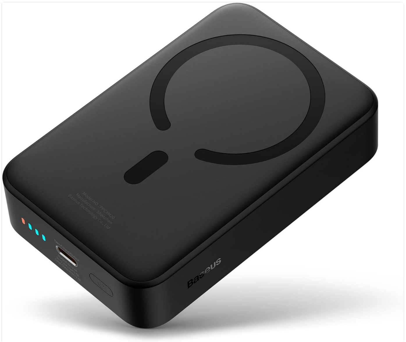
Figure 1: Baseus 20,000mAh 20W Magnetic Power Bank. This image shows the top-down view of the black power bank with its magnetic charging ring and LED indicator lights.