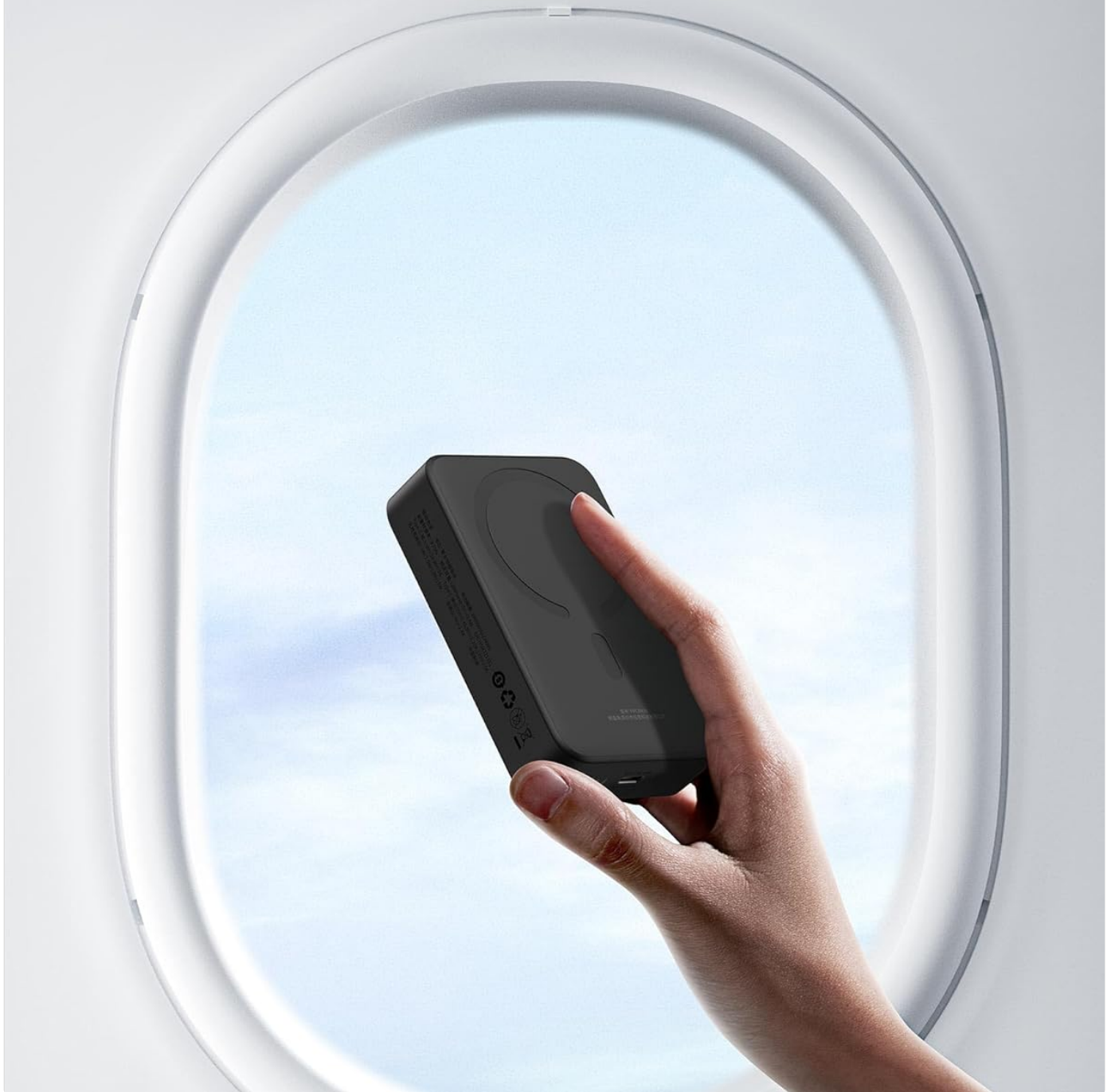
Figure 6: Safe for Air Transport. A hand holding the power bank against the backdrop of an airplane window, indicating its safety for air travel.

Allowed and safe to board with on any plane.