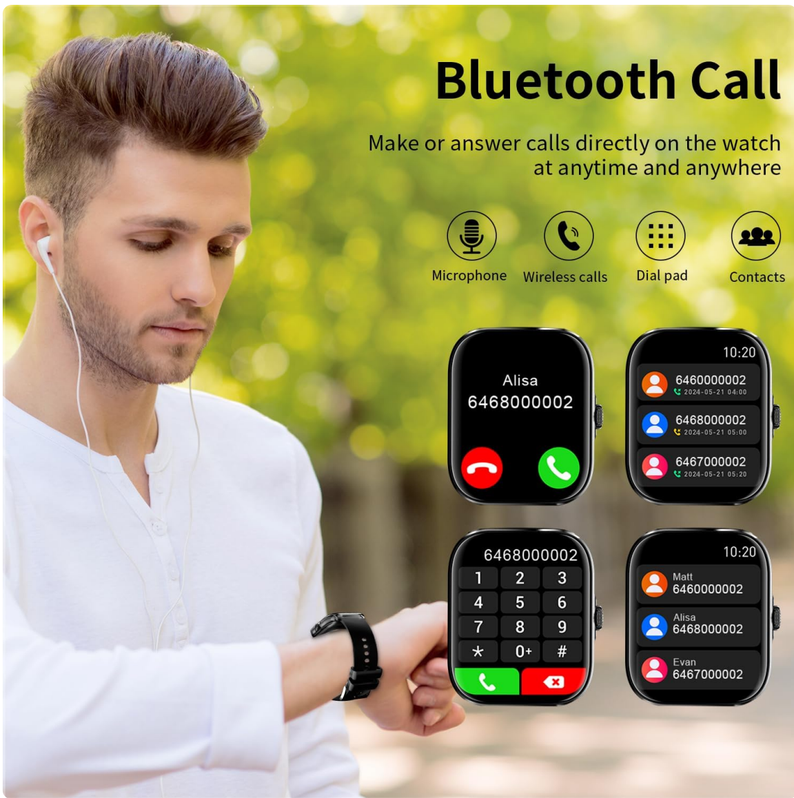
Image: The Bluetooth Call feature in action, demonstrating how to make and answer calls directly from the smartwatch.