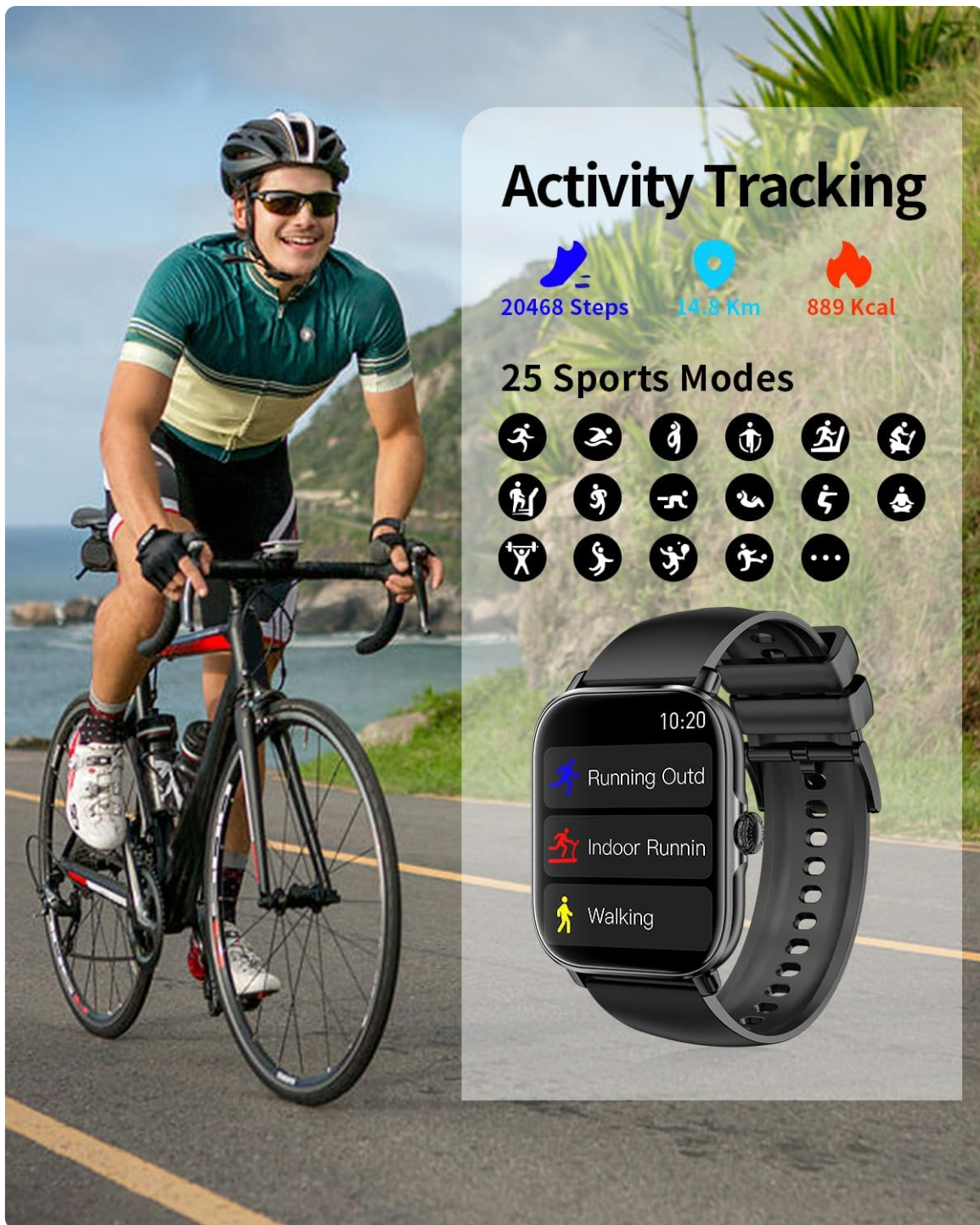
Image: Activity tracking with the Wapik X3 Smartwatch, highlighting its 25+ sports modes and data display.