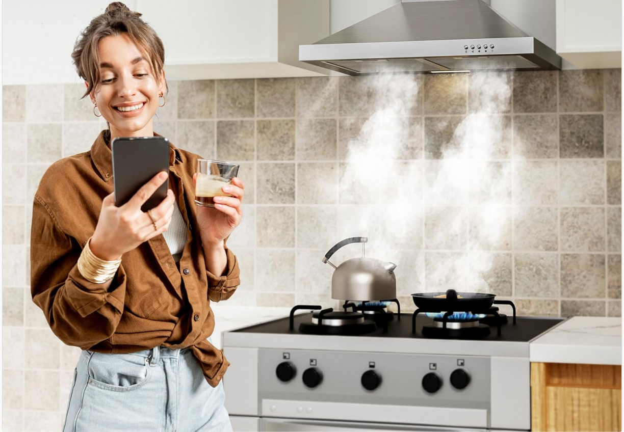
Image: User-friendly push button controls.

Enjoy a serene kitchen with noise levels as low as 45 dB