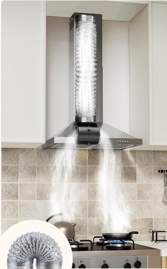
Ducted for powerful ventilation

Fit your kitchen with ducted or ductless solutions