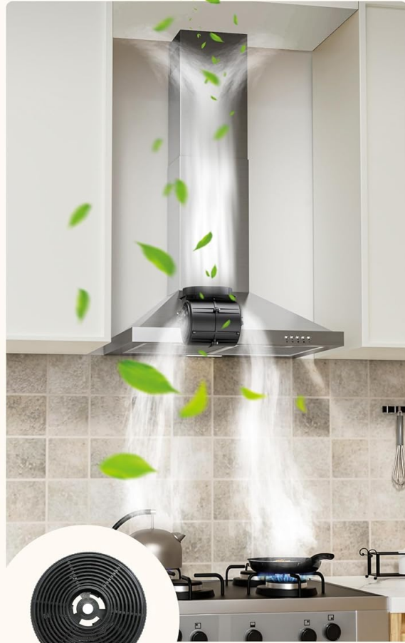
Ductless for easy installation & convenience

Image: Integrated LED lighting for enhanced visibility.