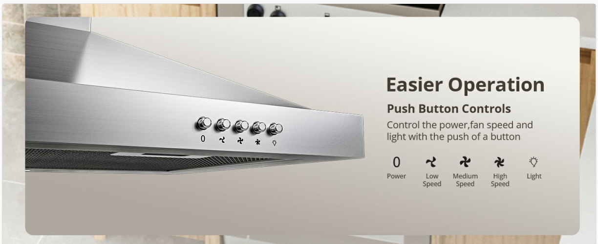
Image: Fan speed settings for various cooking needs.

Press the fan speed buttons to select from three different settings: Low, Medium, and High. The Low speed is suitable for light cooking, Medium for moderate cooking, and High for heavy cooking or frying to effectively remove smoke and odors.