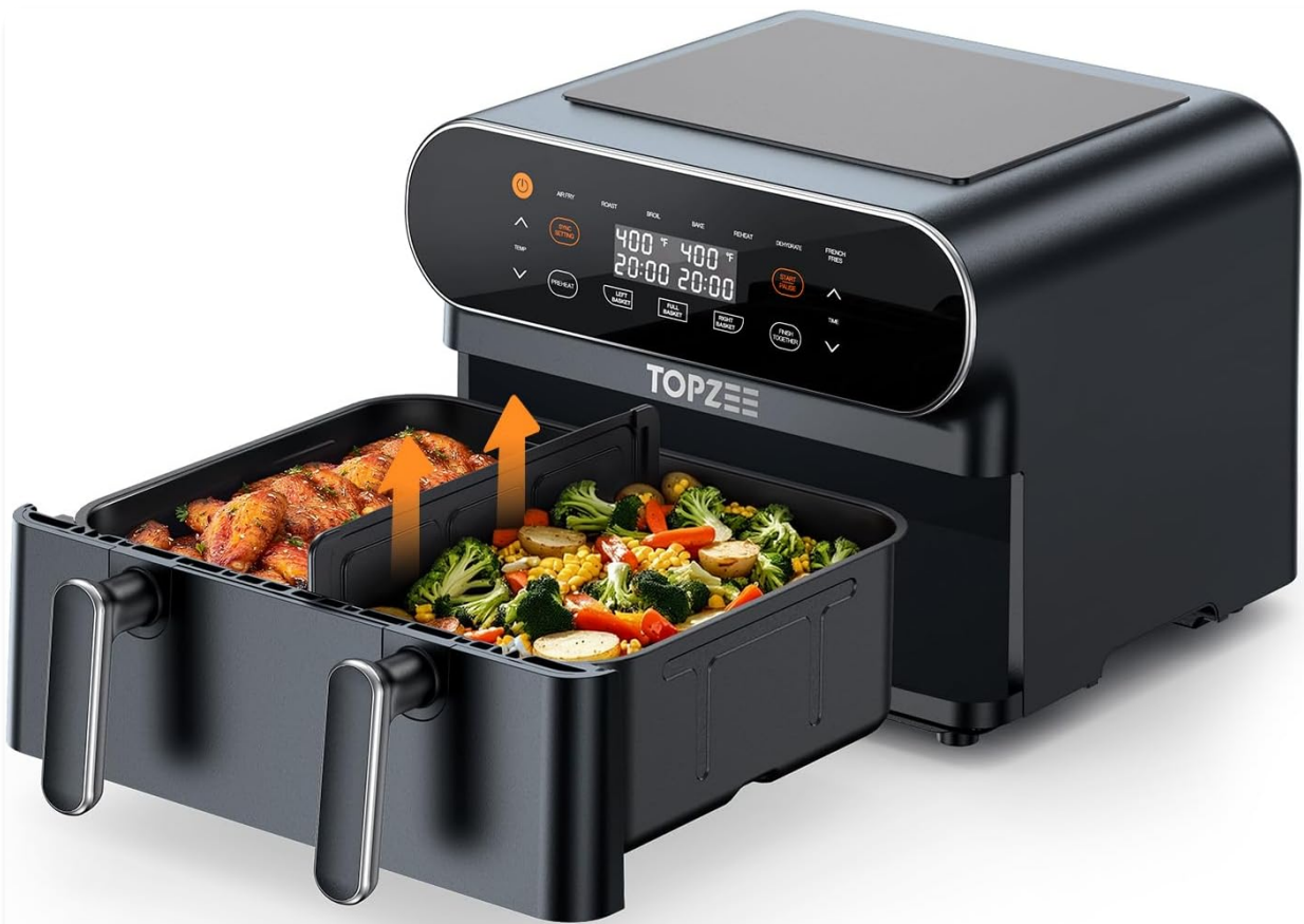
Image: The TOPZEE 11-Qt Large Air Fryer, showcasing its sleek design and the dual basket configuration with a divider.