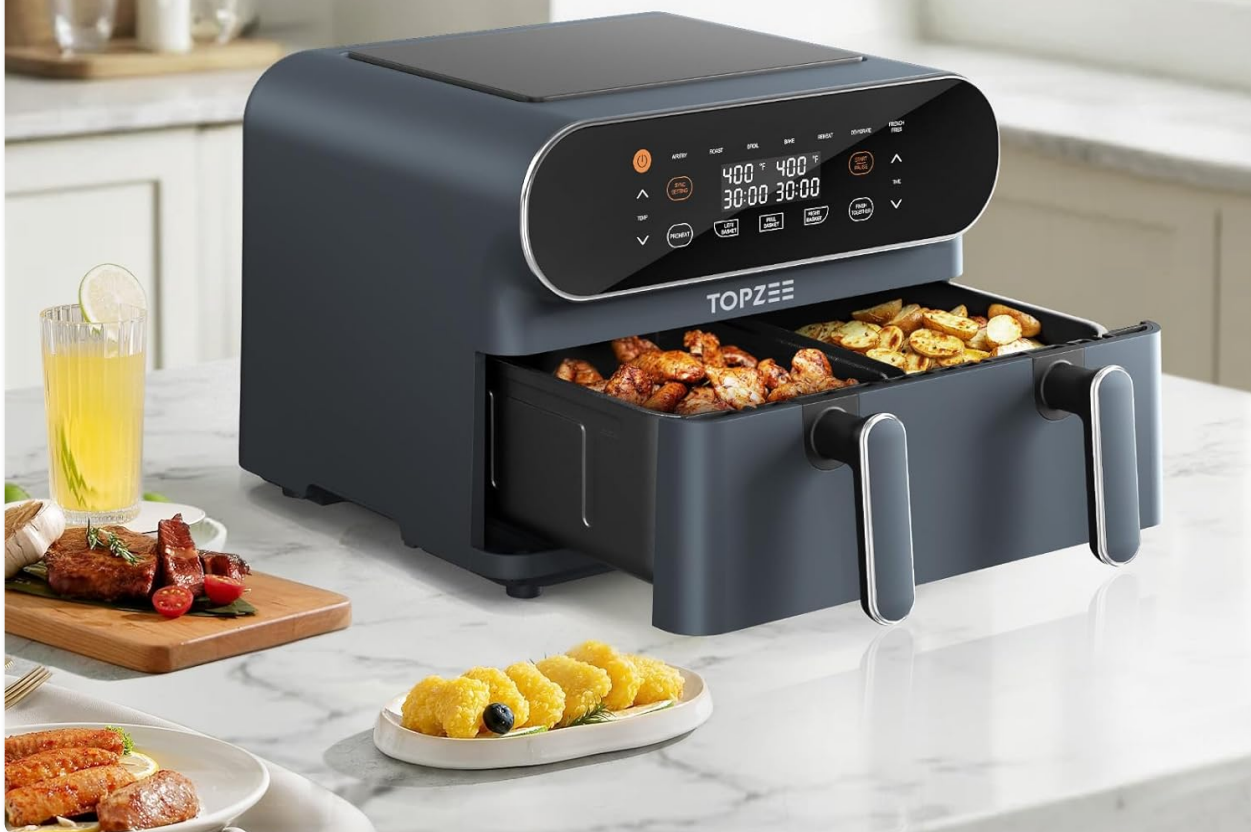
Image: The air fryer with two baskets, illustrating how different foods can be cooked to finish at the same time.

The SYNC Setting enables you to cook two baskets with identical cooking settings quickly