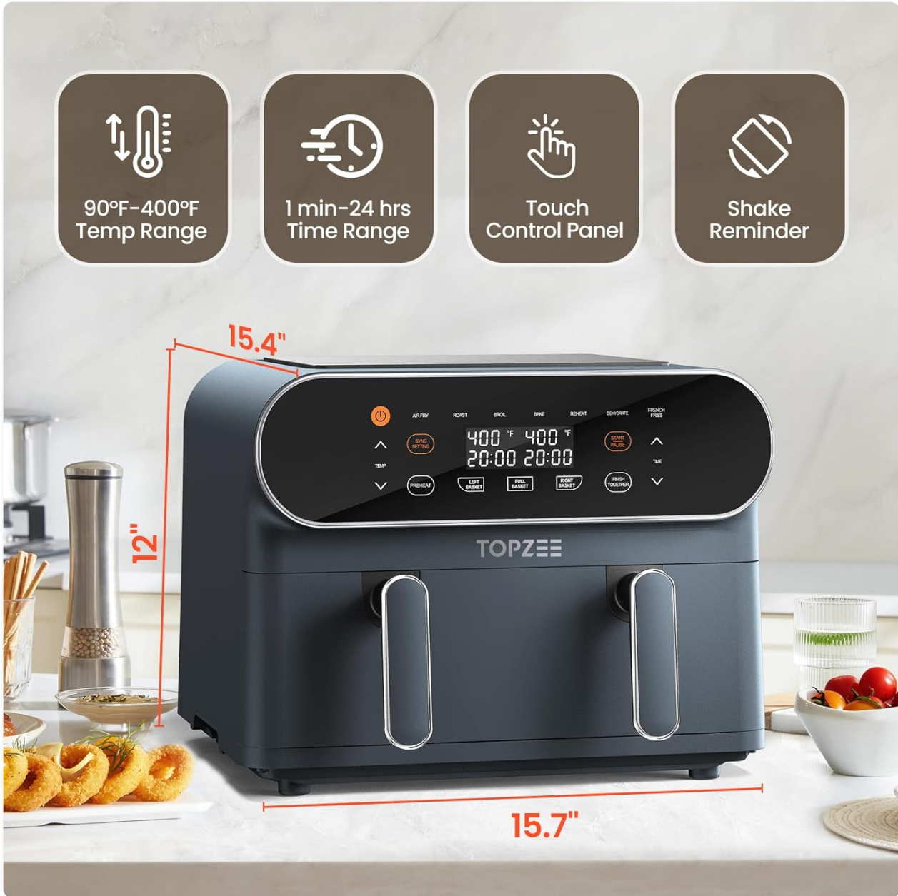
Image: Diagram illustrating the physical dimensions of the TOPZEE 11-Qt Large Air Fryer.