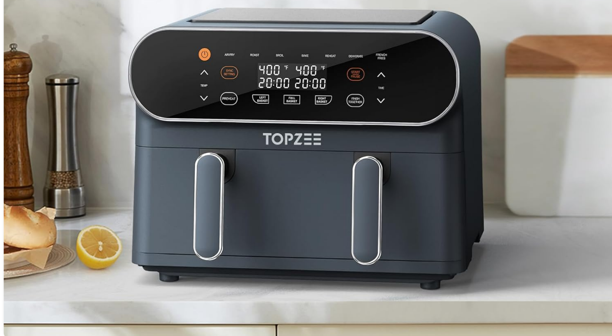
Image: The air fryer showing the 'SYNC' function on its display, indicating both baskets are set to identical cooking parameters.