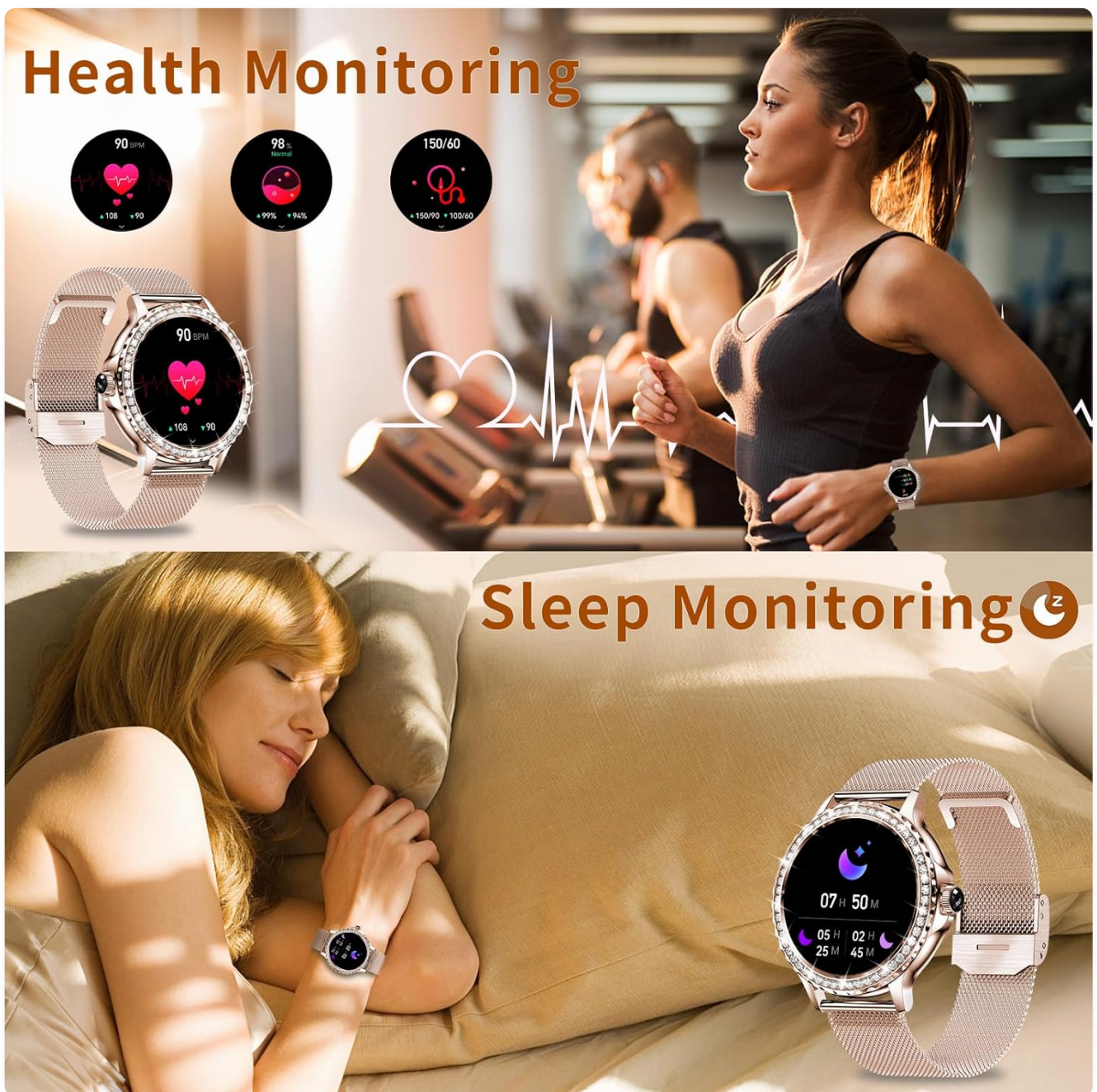
Figure 4.1: Two scenes depicting health monitoring: a couple running with the watch showing heart rate, and a woman sleeping with the watch displaying sleep tracking data.