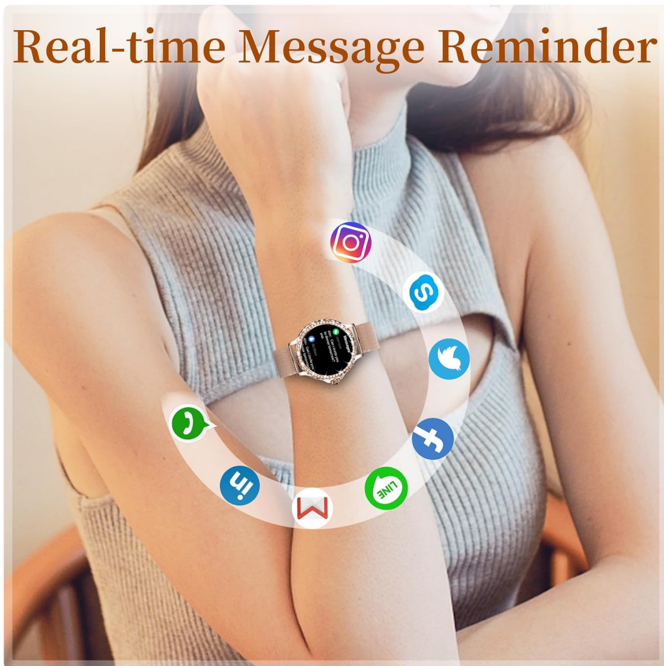
Figure 3.3: The smartwatch on a wrist, surrounded by icons of various social media and messaging apps, indicating real-time message reminders.

The smartwatch can display real-time notifications from SMS, Facebook, Twitter, WhatsApp, Instagram, and other applications. Notifications are displayed on your wrist and alerted by vibration. Note: This function does not support sending or replying to messages.