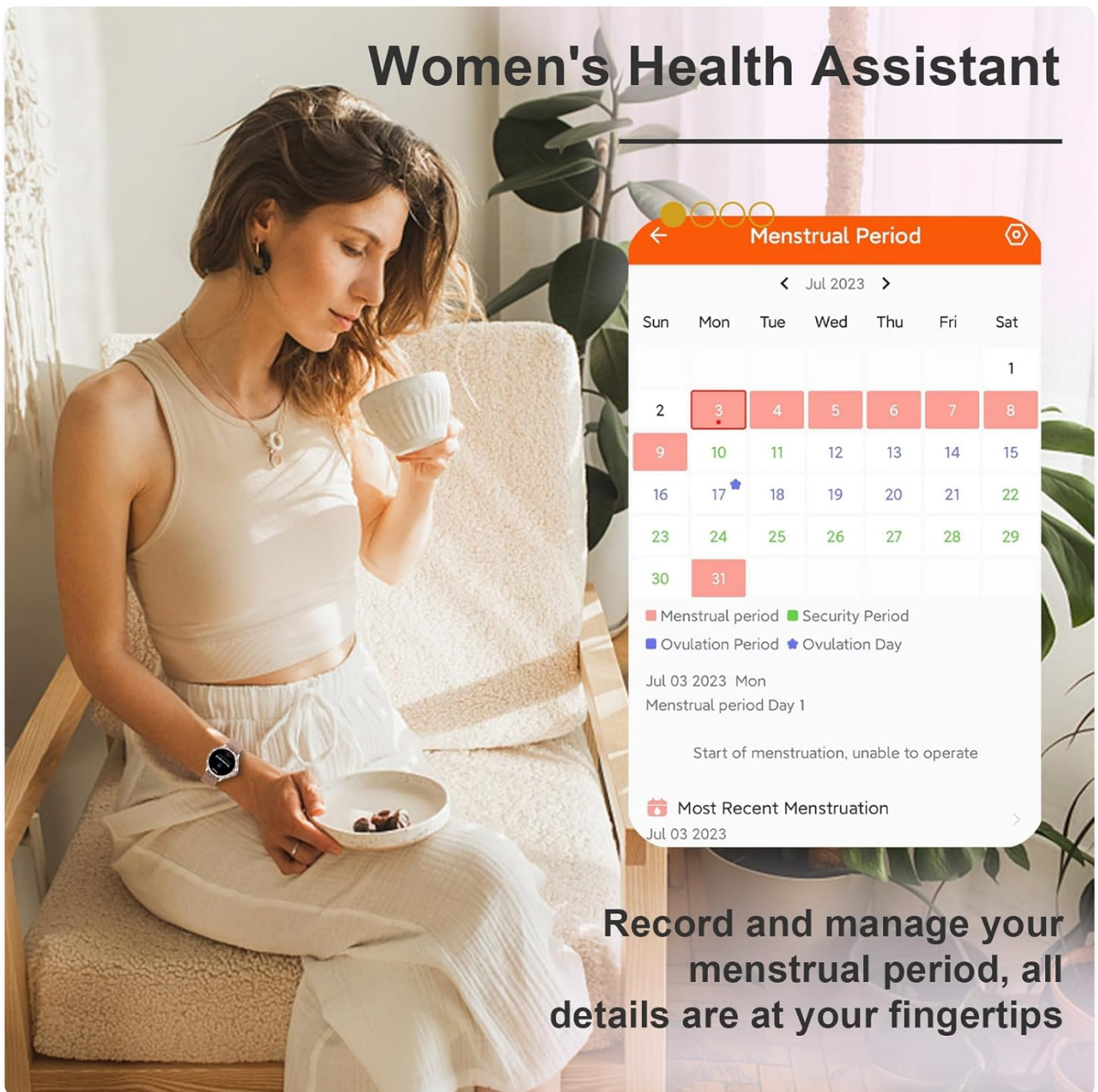
Figure 4.2: A woman relaxing while her phone displays a menstrual period tracking calendar, indicating the smartwatch's female health assistant feature.