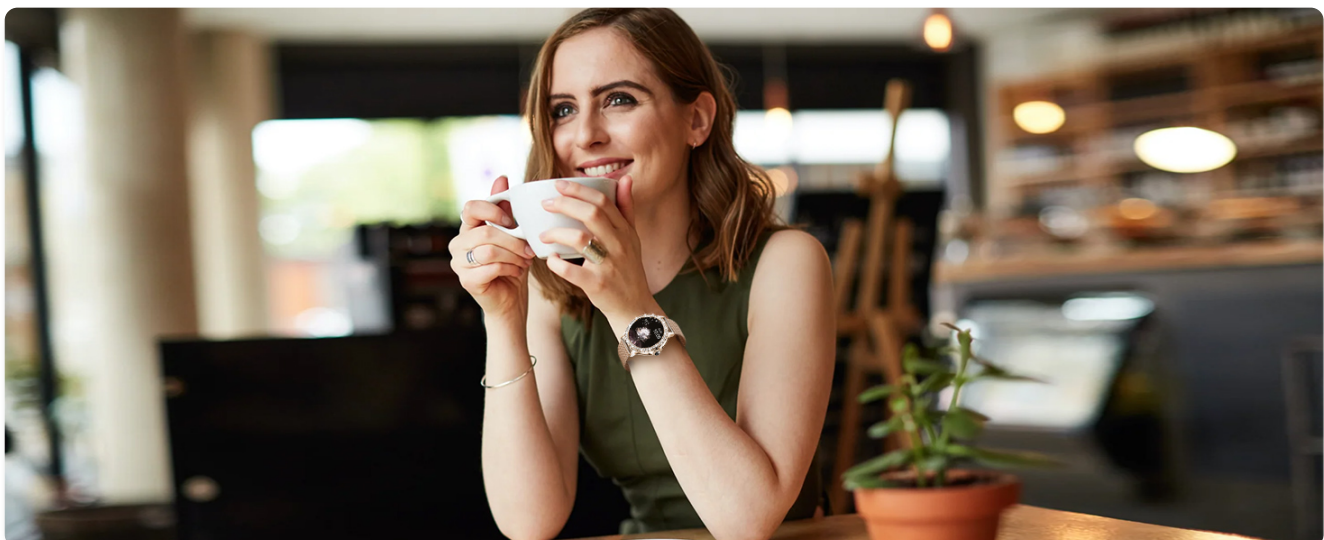
Figure 3.2: An image illustrating the Bluetooth 5.2 call functionality, highlighting clear dialogue and connection.