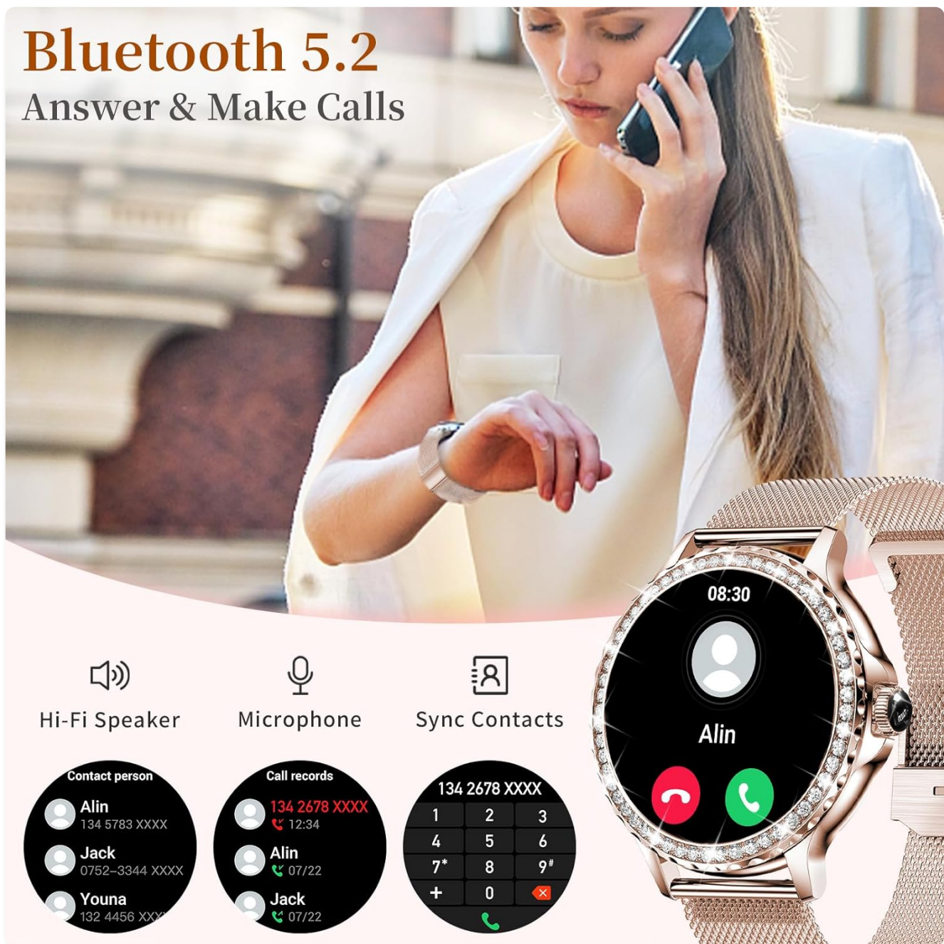
Figure 3.1: A user demonstrating the Bluetooth call feature, showing the watch displaying an incoming call interface.