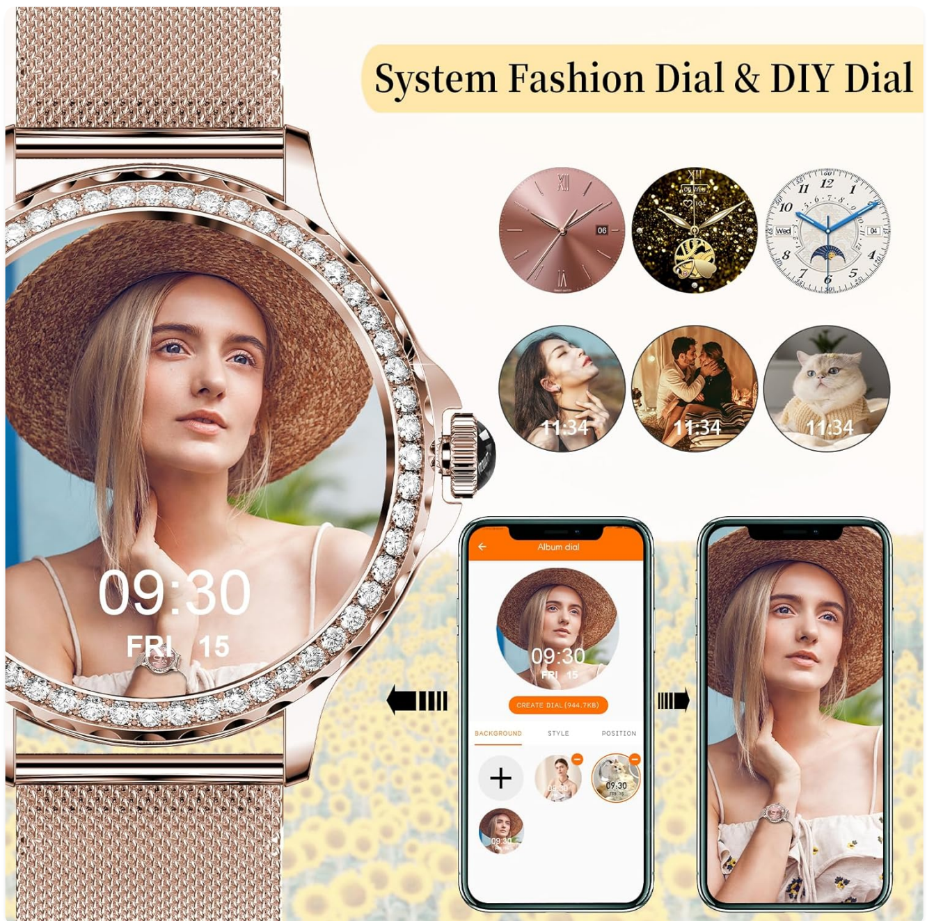
Figure 3.4: A woman wearing the smartwatch, with an accompanying image showing the FitCloudPro app interface for customizing watch faces with personal photos.