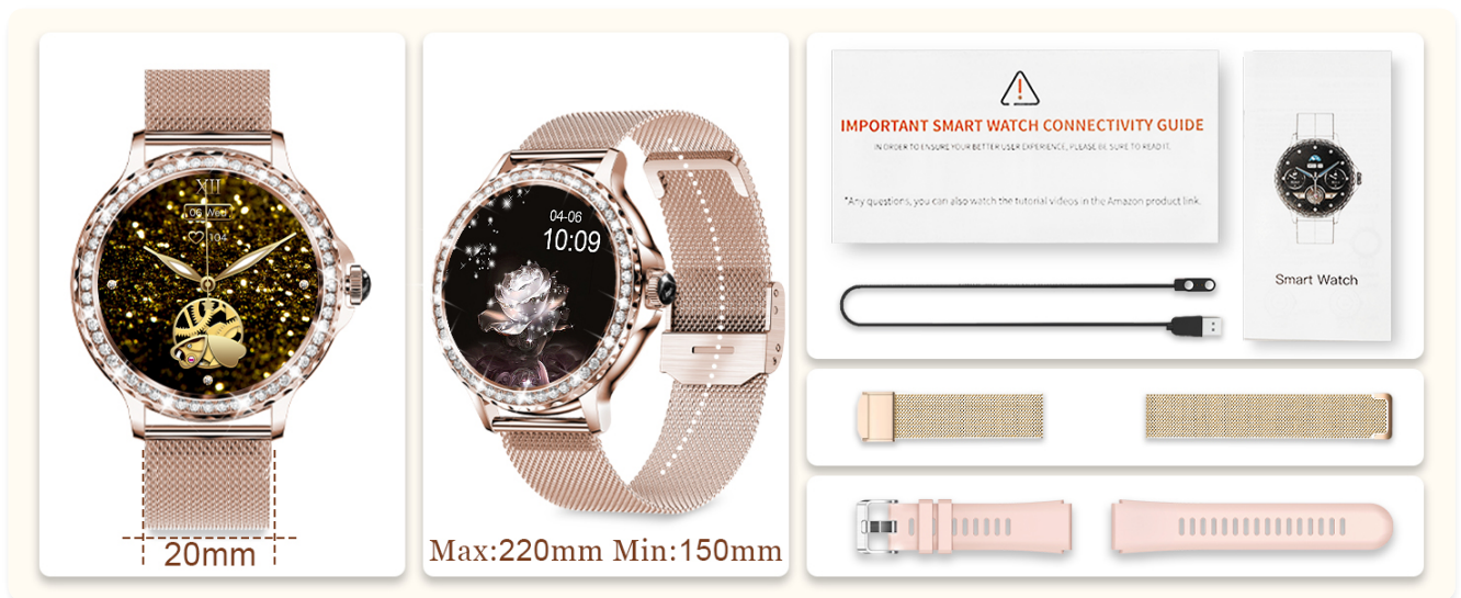
Figure 1.2: An illustration of the items included in the product packaging, showing the smartwatch, two bands, charging cable, user manual, and screen protectors.