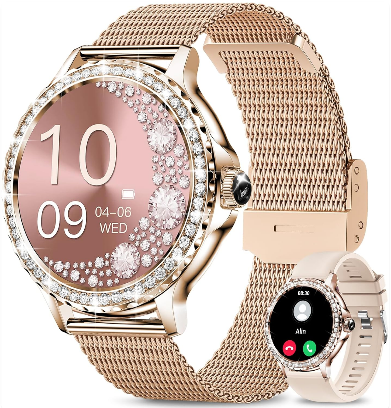
Figure 1.1: The Fitoncloud F19 Feminine Smartwatch in Elegant Rosegold, showcasing its diamond-embellished bezel and vibrant display.