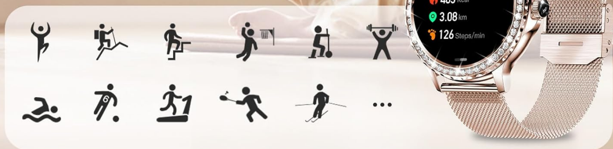
Figure 5.1: A woman performing a yoga pose, with the smartwatch displaying various fitness metrics like calories, distance, steps, and heart rate, illustrating its multi-sport tracking capabilities.