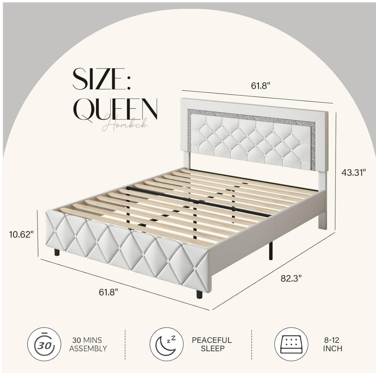
Image: Dimensions of the HOMBCK Queen Platform Bed Frame.