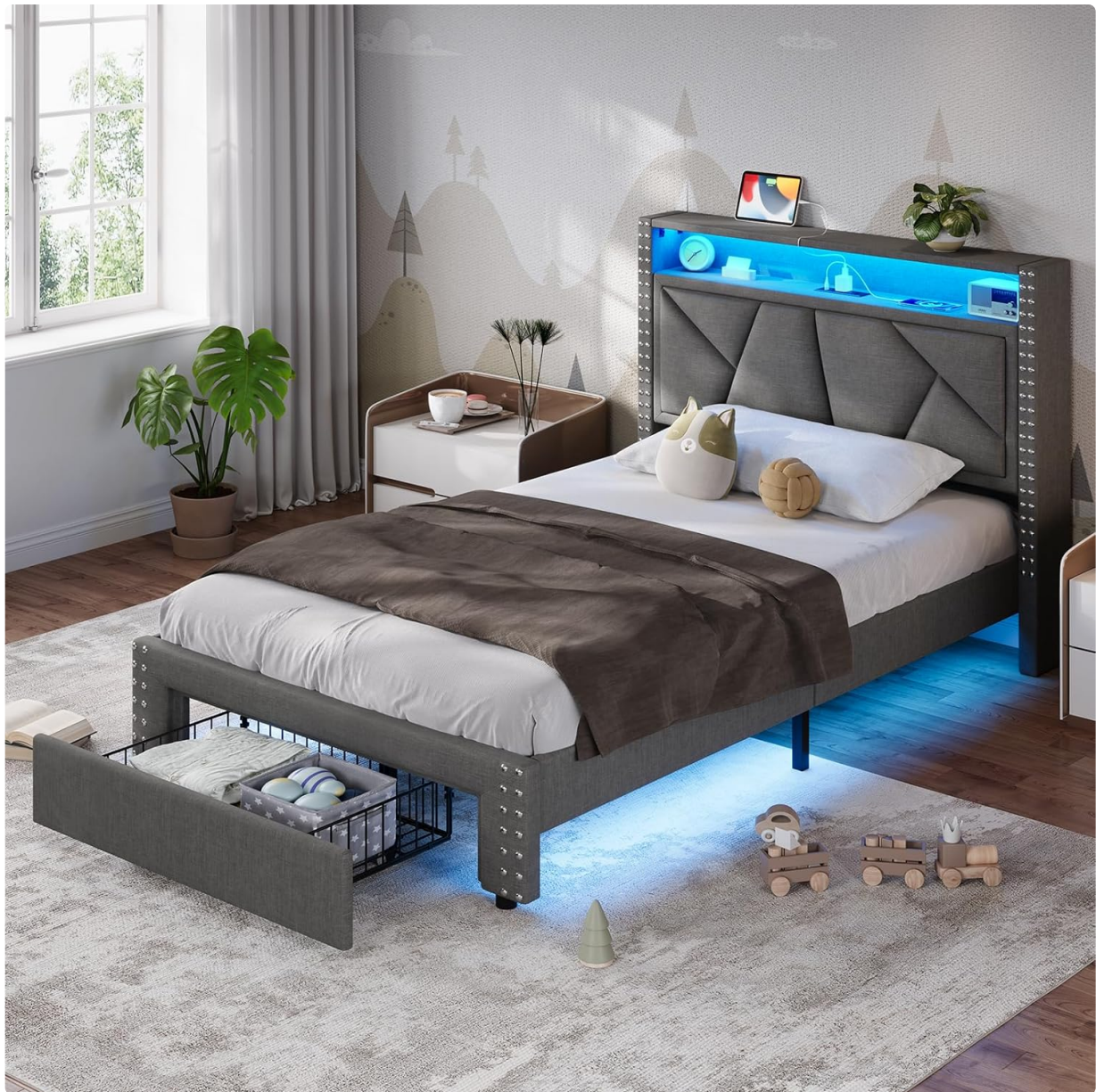
Image 1.1: The VIAGDO Twin Upholstered Platform Bed Frame in a bedroom setting.