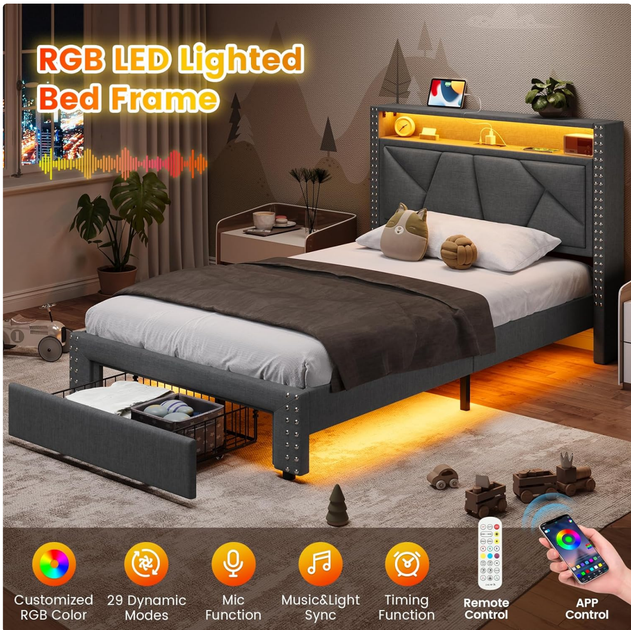
Image 5.1: RGB LED lights in operation, highlighting control features.