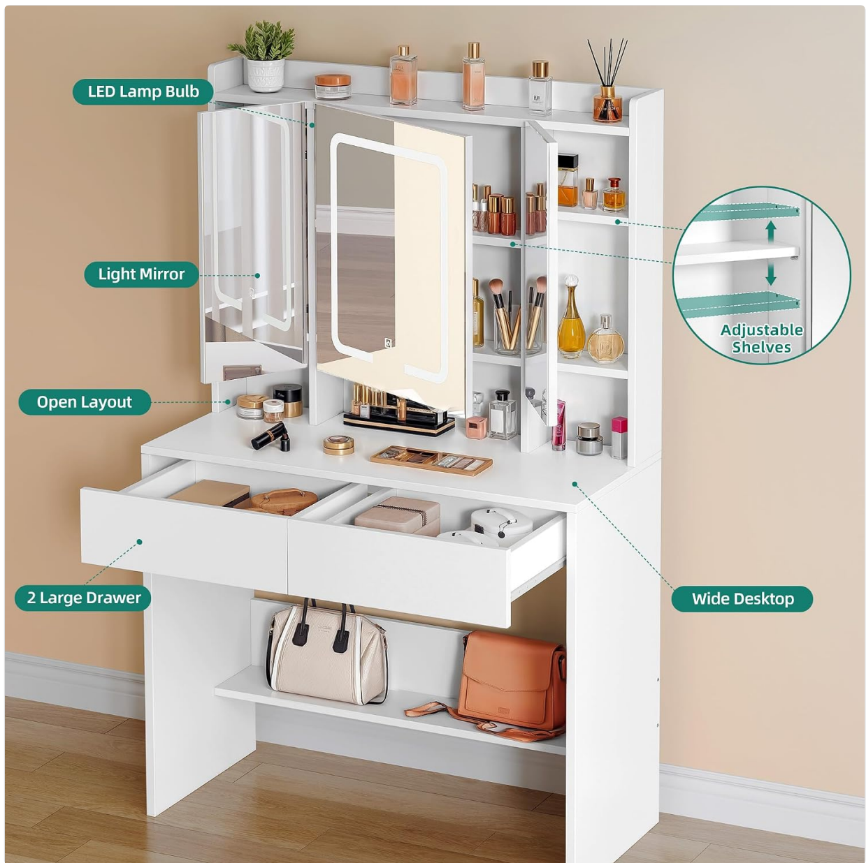
Overview of the vanity desk's storage and features.