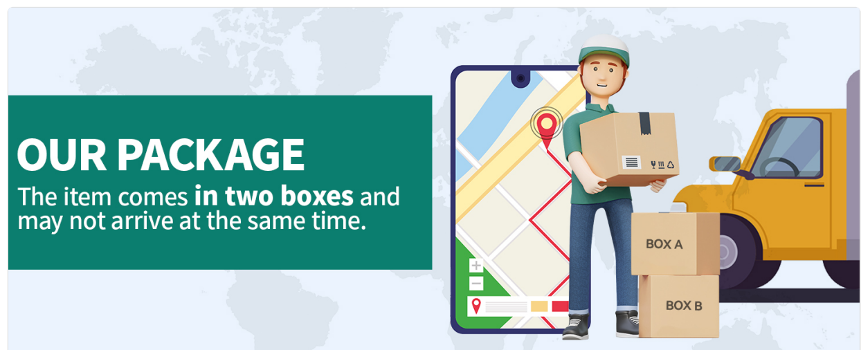
Illustration of the two-box delivery system for the vanity desk.

The YITAHOME Vanity Desk is delivered in two separate boxes, which may arrive at different times. Please ensure you have received both packages before beginning assembly.