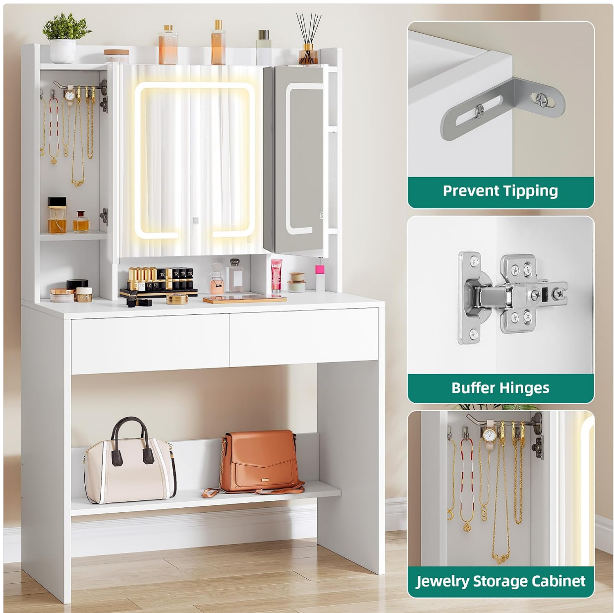
Detail of the anti-tipping bracket and buffer hinges for safe and smooth operation.