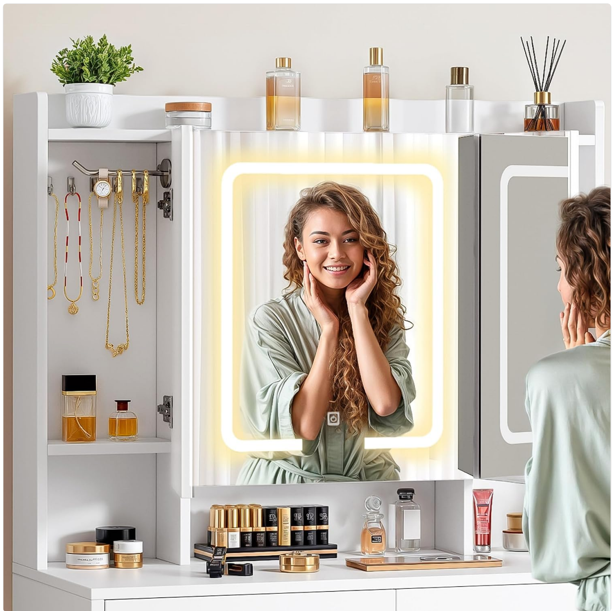
The assembled YITAHOME Vanity Desk.