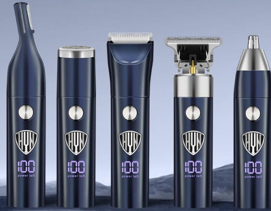
Image: A visual guide demonstrating the four main detachable heads: Electric Shaver, Nose Hair Trimming, Eyebrow Scraper, and Trim Hairs, along with an example of body trimming.