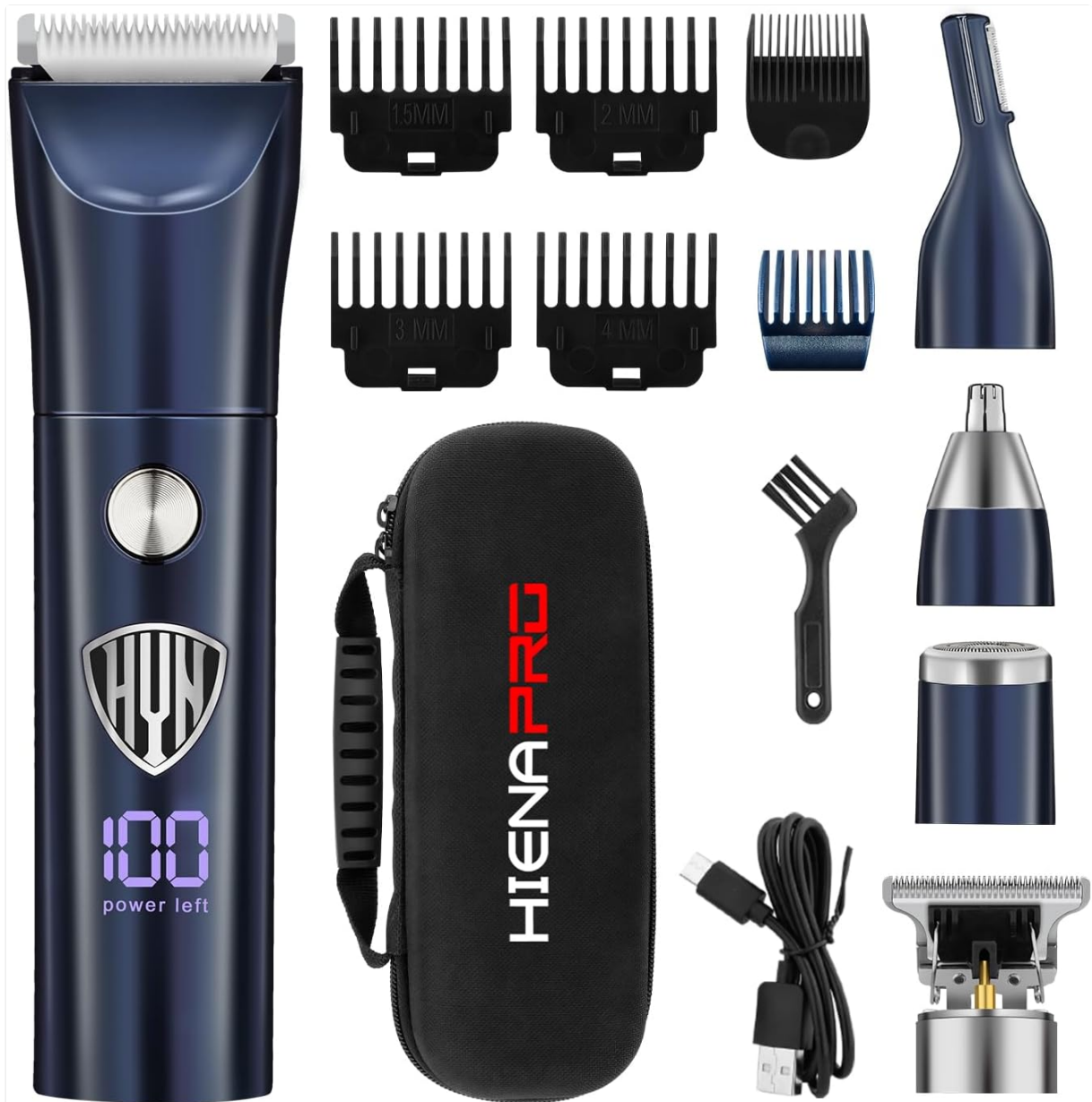
Image: The complete HIENA PRO HYN-T06 grooming kit, showing the main trimmer unit, various attachment heads (trimmer, nose, shaver, eyebrow), guide combs (1.5mm, 2mm, 3mm, 4mm), cleaning brush, USB charging cable, and a travel case.