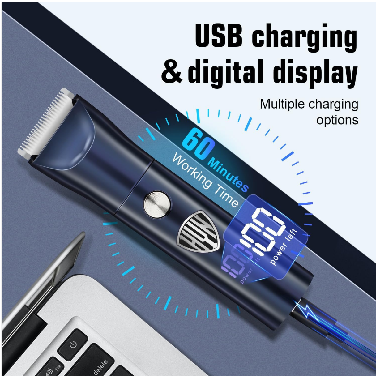
Image: The HIENA PRO trimmer being charged via a USB cable, with its digital display indicating "100 power left" and "60 Minutes Working Time".