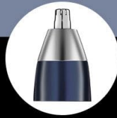
Nose hair trimming