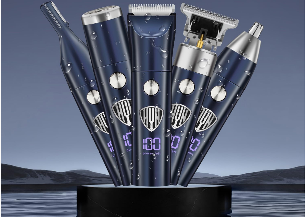
Image: Five individual grooming tools, each with a digital display, standing upright, illustrating the 5-in-1 multifunctional design of the kit.