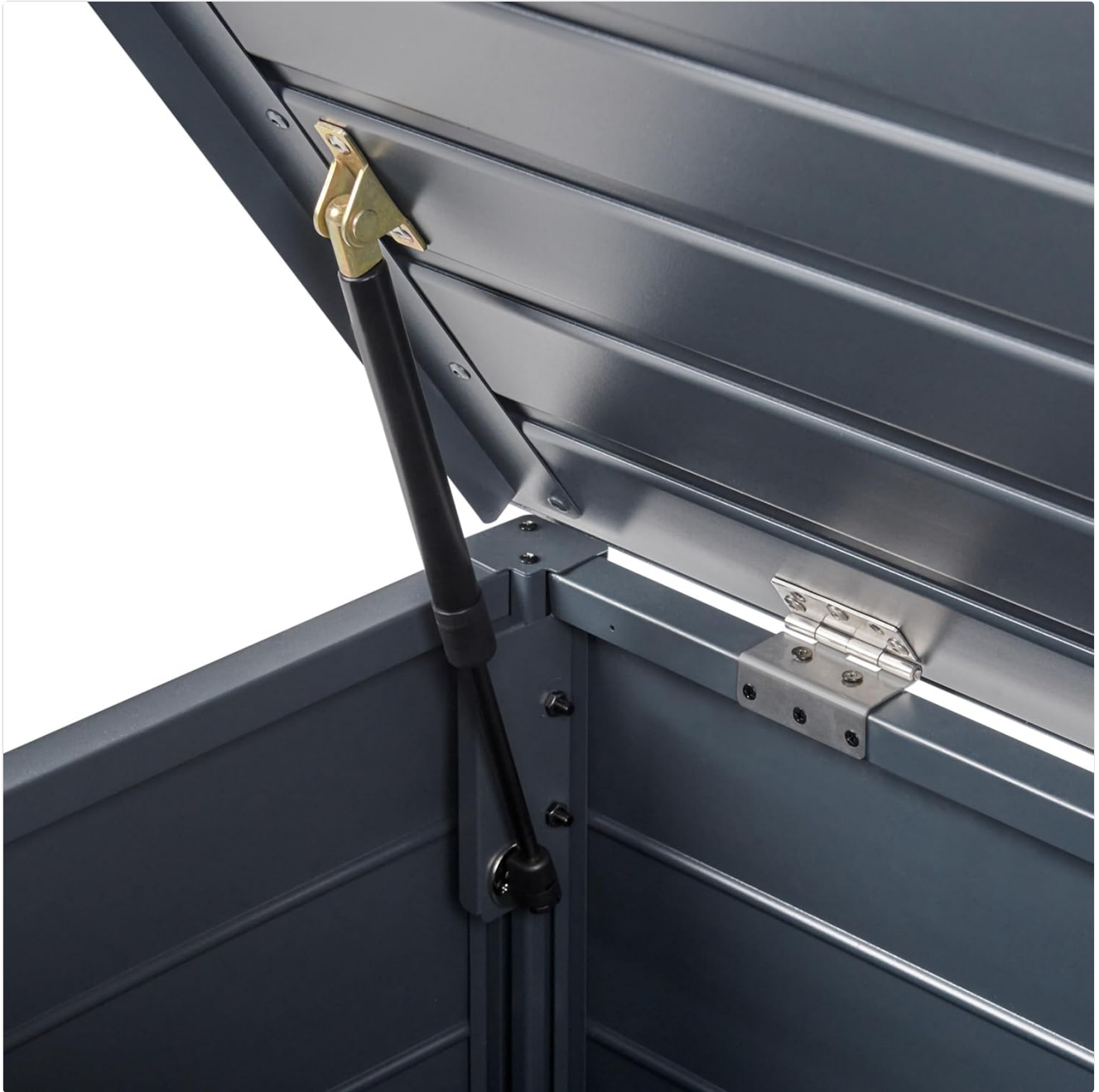
Image: A detailed view of the internal gas lift mechanism and hinges of the storage box. This mechanism ensures smooth and controlled opening and closing of the lid.