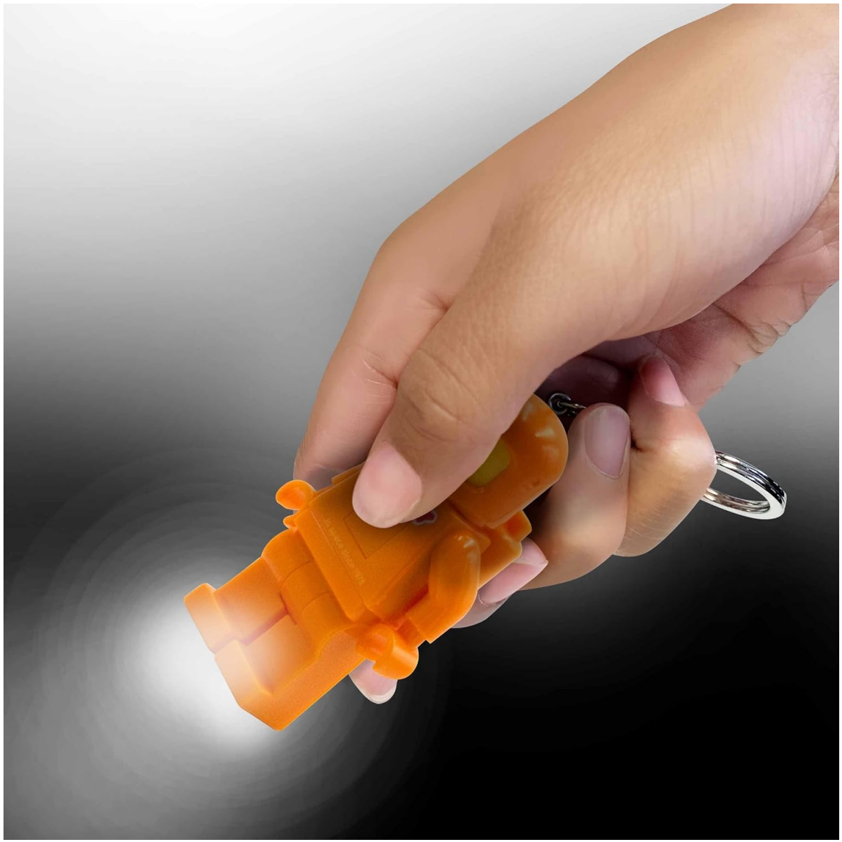
A hand holding the orange LEGO Spaceman Keychain Light, demonstrating the LED lights illuminated from the feet.