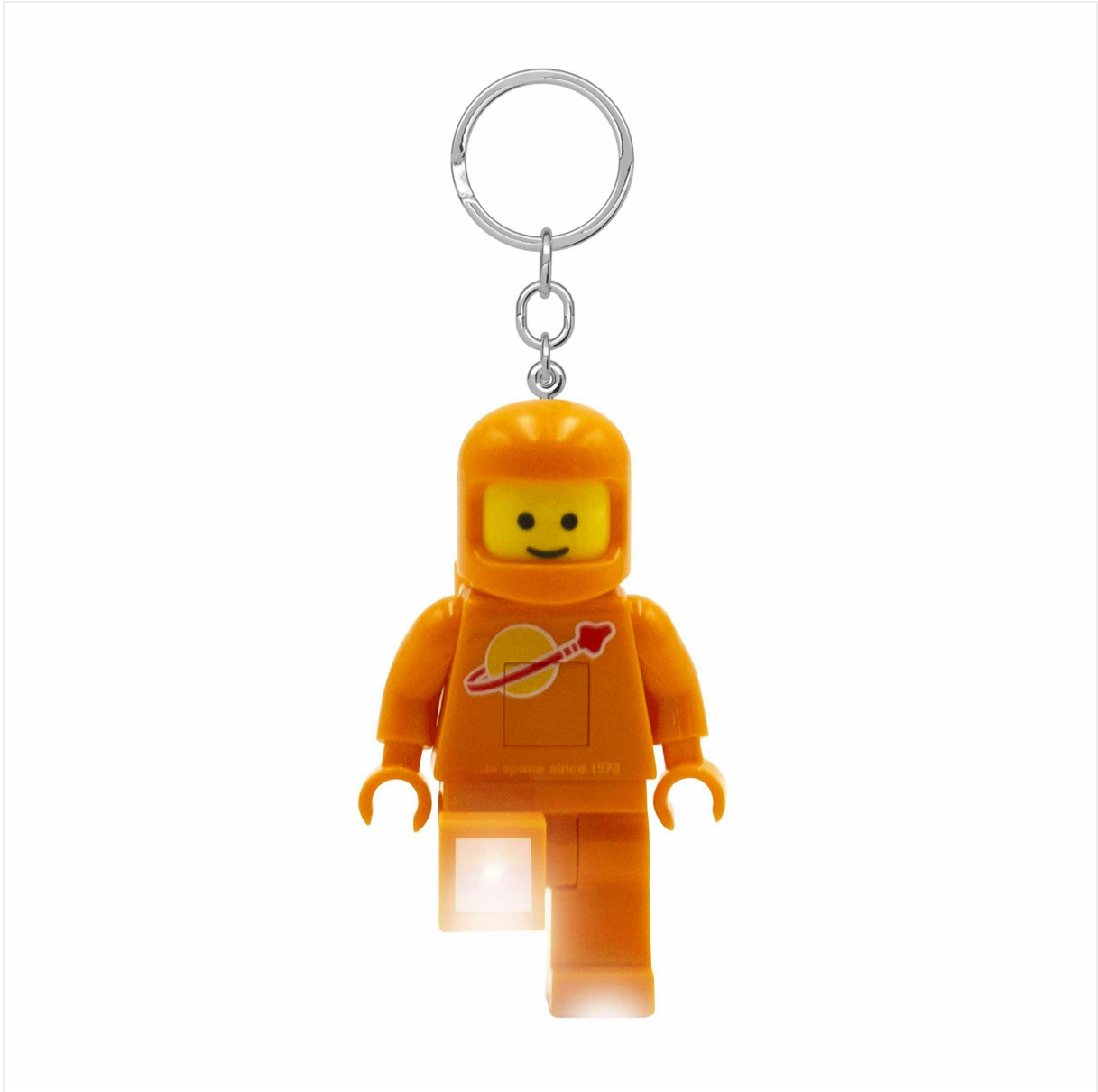
Front view of the orange LEGO Spaceman Keychain Light.

The LEGO Minifigures Spaceman Keychain Light is a 3-inch (76mm) tall replica of the classic LEGO spaceman minifigure, scaled at 175%. It features a metal key ring for easy attachment and integrated LED lights in its feet. The figure is fully posable with movable head, arms, hands, and legs.