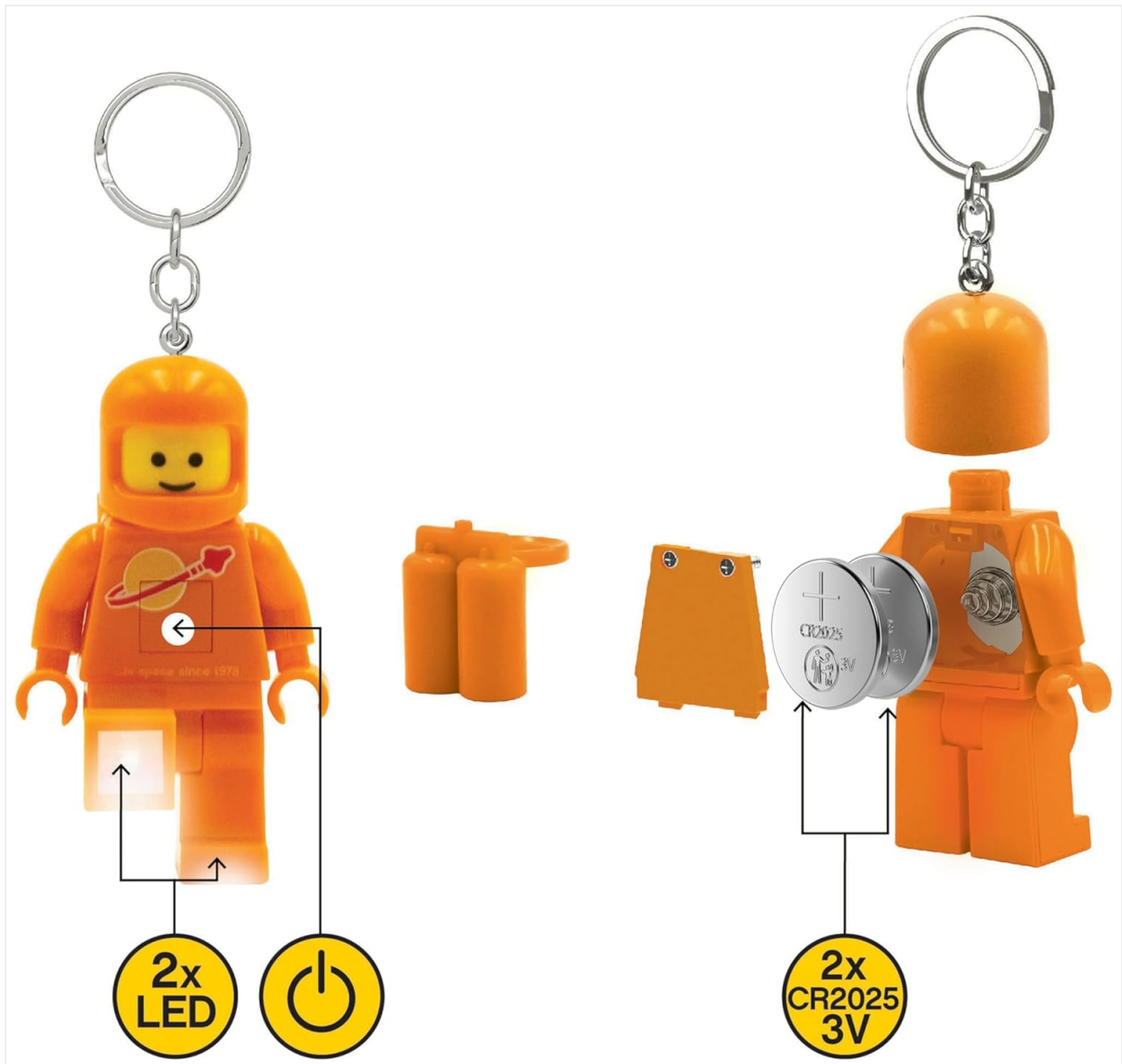
A diagram illustrating the internal components and battery replacement process for the LEGO Spaceman Keychain Light, showing the location of the 2x LED lights, the power button, and the 2x CR2025 3V batteries.