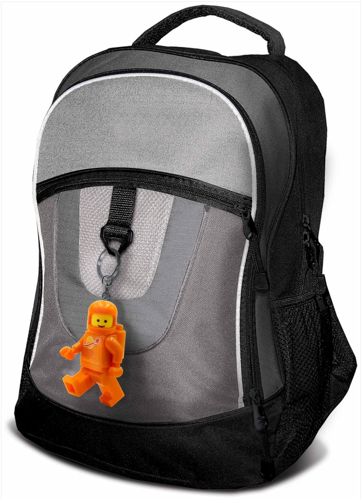
The orange LEGO Spaceman Keychain Light attached to a grey and black backpack, demonstrating its use as a bag charm.