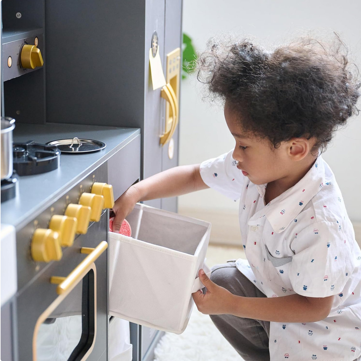
Figure 3.1: Included Accessories