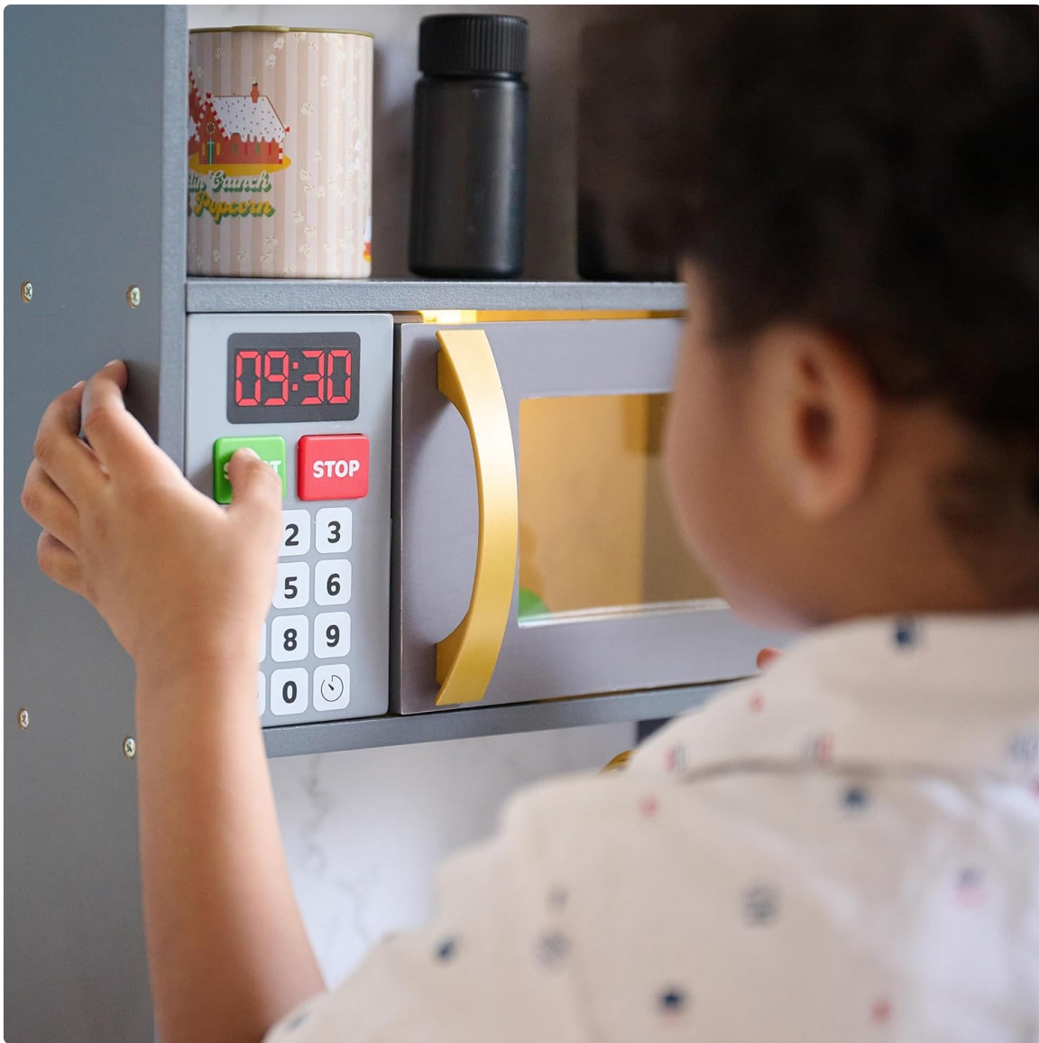
Figure 5.2: Microwave Interaction