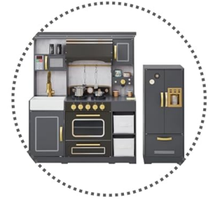
Free Standing Units