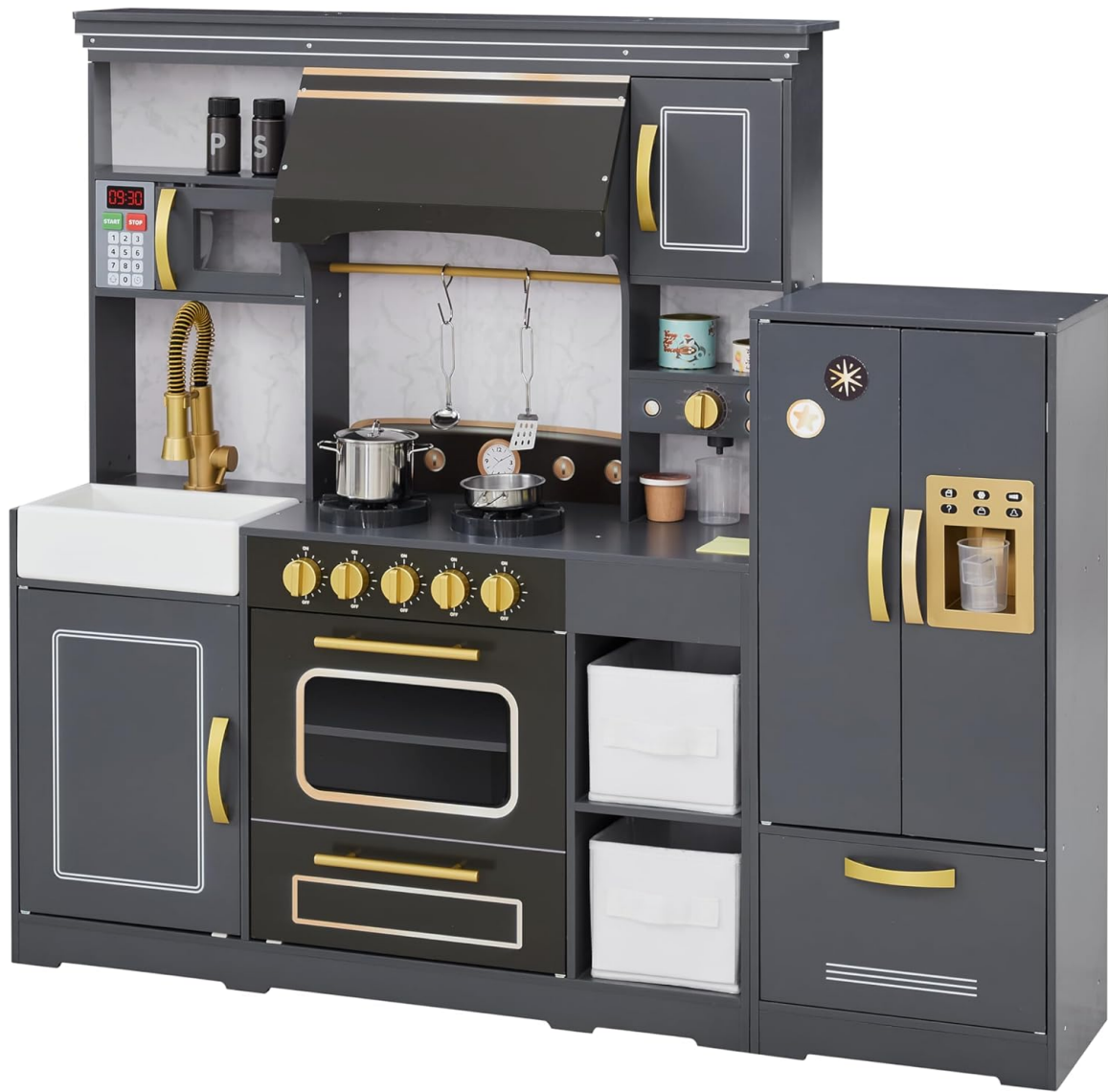
Figure 4.1: Fully Assembled Play Kitchen