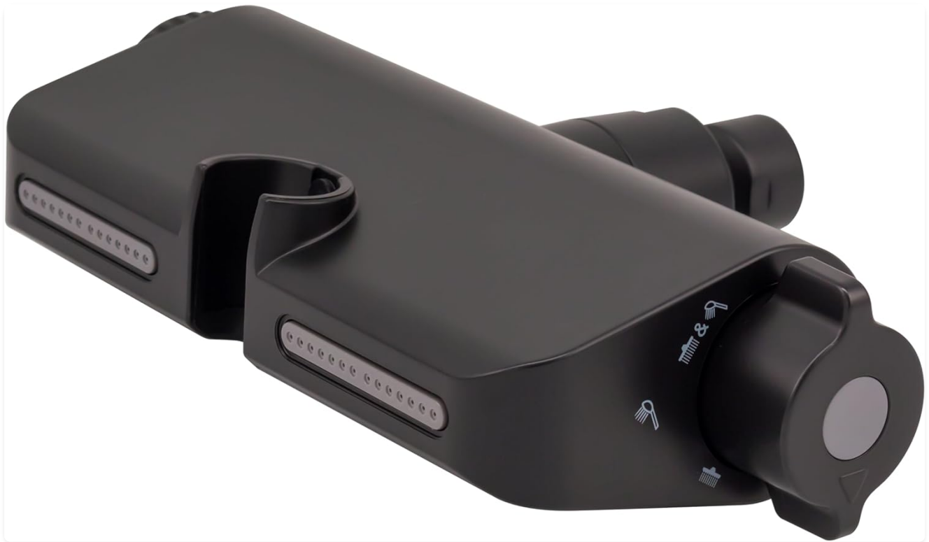
Figure 3: Angled view of the diverter bracket, showing the mode selection dial on the right side. The dial allows users to switch between different spray patterns for the massage function.