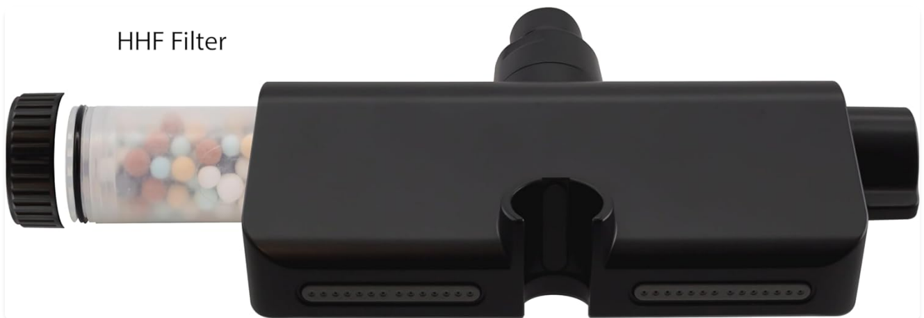
Figure 2: Top-down view of the diverter bracket, illustrating the internal filter element. This view helps in understanding the filter's placement during installation and replacement.