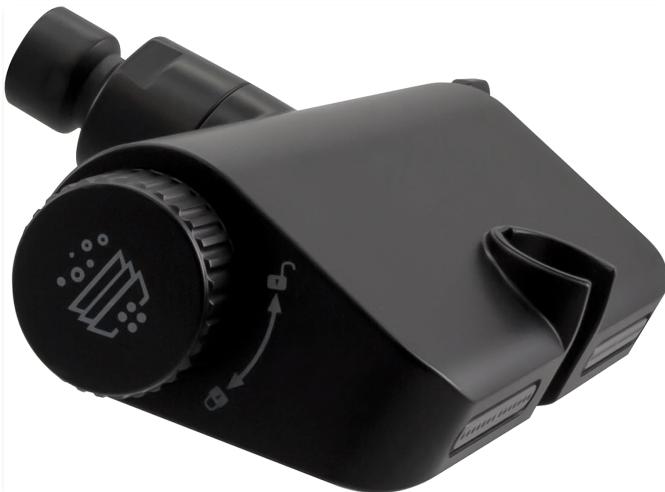
Figure 1: Front view of the Westbrass F730-62 Filtered Handheld Shower Head Diverter Bracket. This image displays the overall design and matte black finish of the product.

The Westbrass F730-62 is a filtered handheld shower head diverter bracket designed to enhance your showering experience. It converts a standard handheld shower to a filtered system, helping to reduce impurities in the water. This unit also features a powerful jetted spray for massage, targeting specific areas for muscle relief.