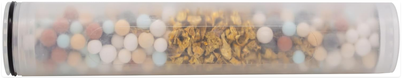
Figure 5: Close-up view of the HHF filter cartridge, displaying the different types of filtration media contained within.